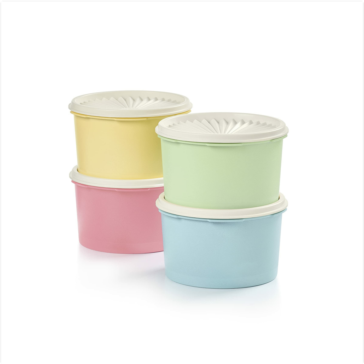
Image 1: The Tupperware Heritage Collection 8 Piece Food Storage Canister Set, showcasing the four containers and lids in various vintage colors.