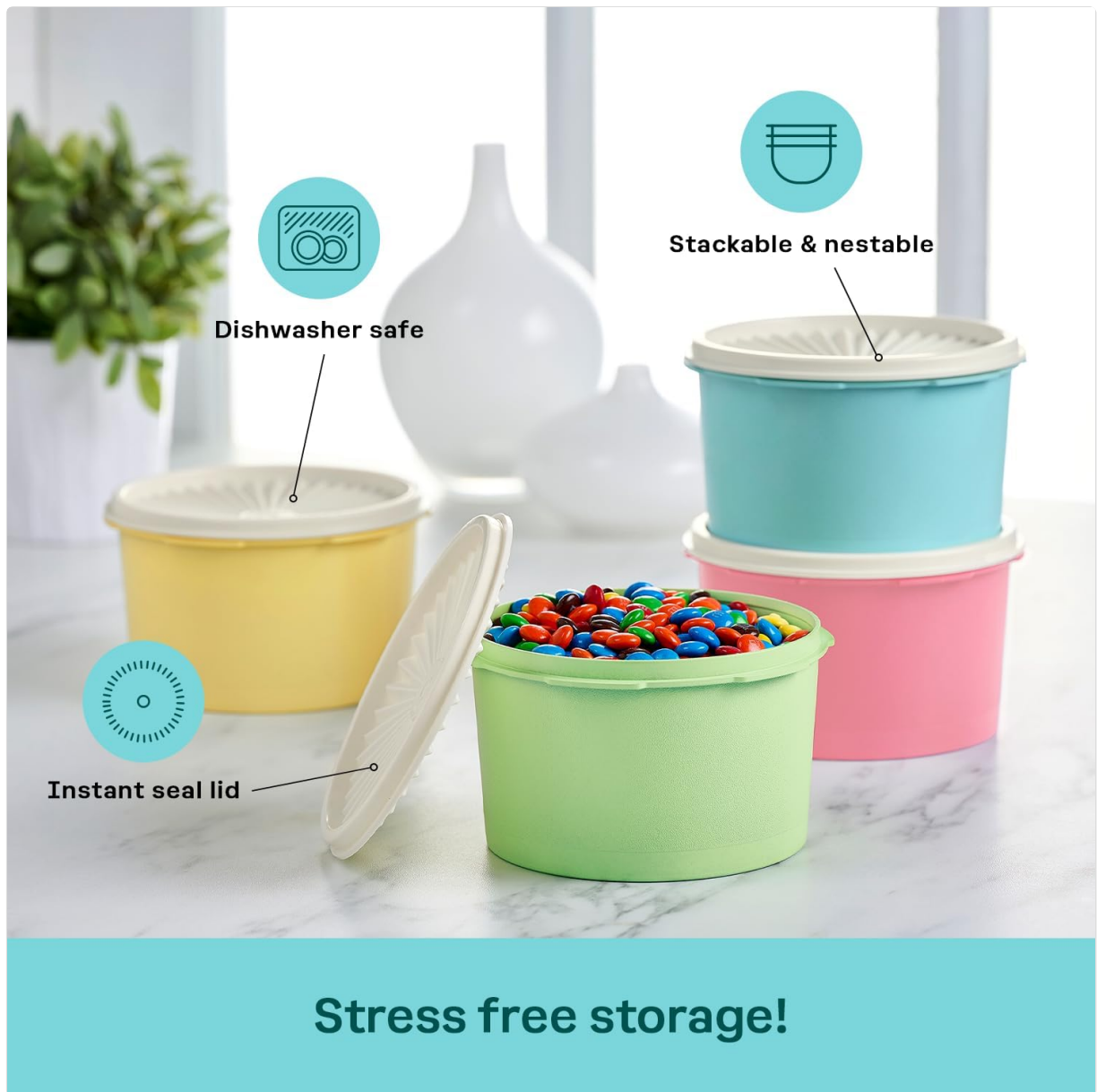
Image 3: Three Tupperware Heritage canisters in green, pink, and blue, illustrating key features such as being dishwasher safe, stackable & nestable, and having an instant seal lid.