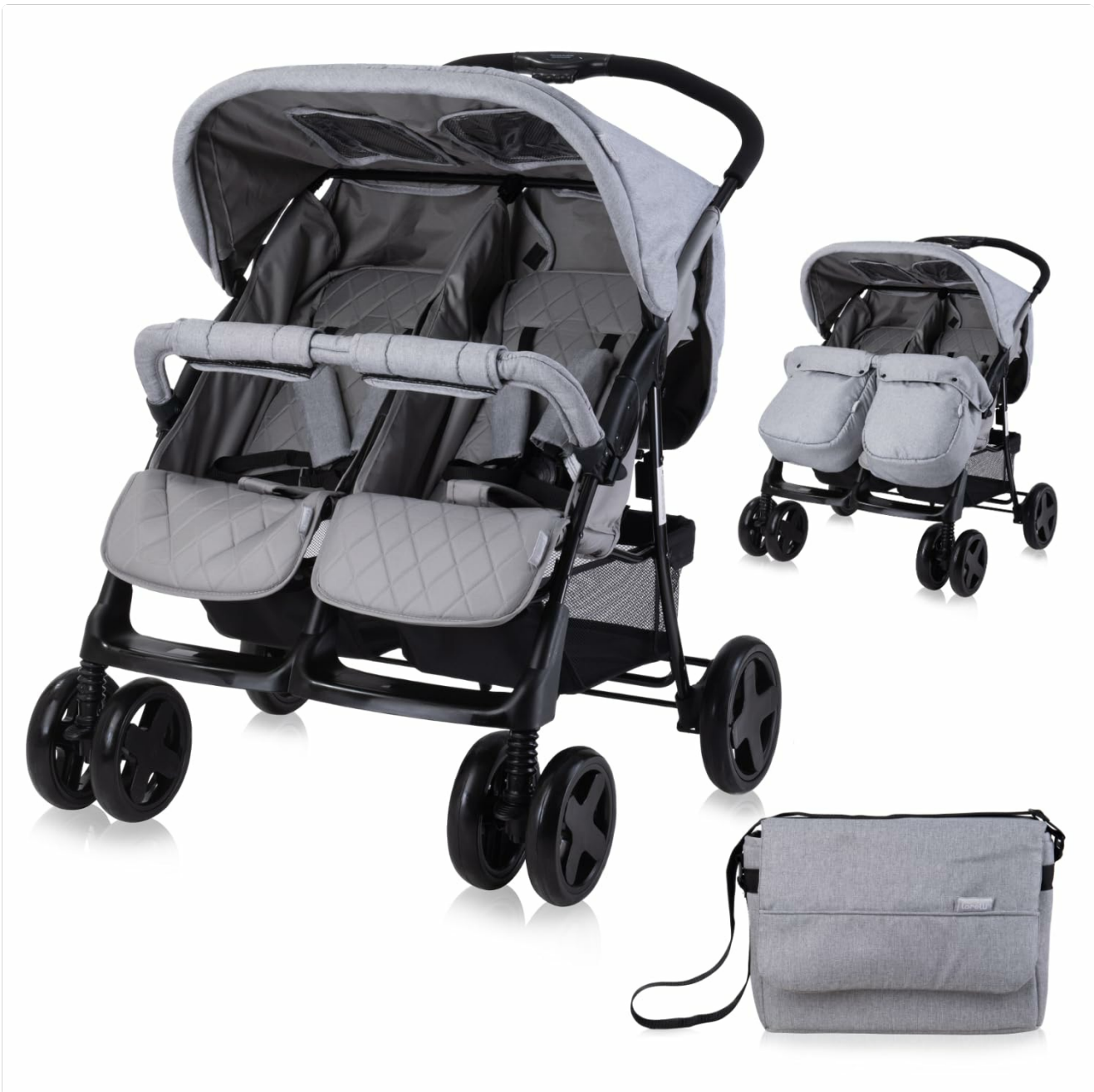
Image: Fully assembled Lorelli Twin Twin Double Stroller.