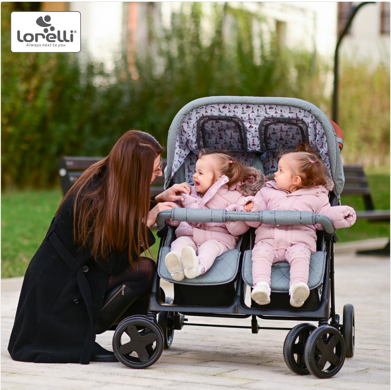
Image: Foldable canopy for sun and wind protection.