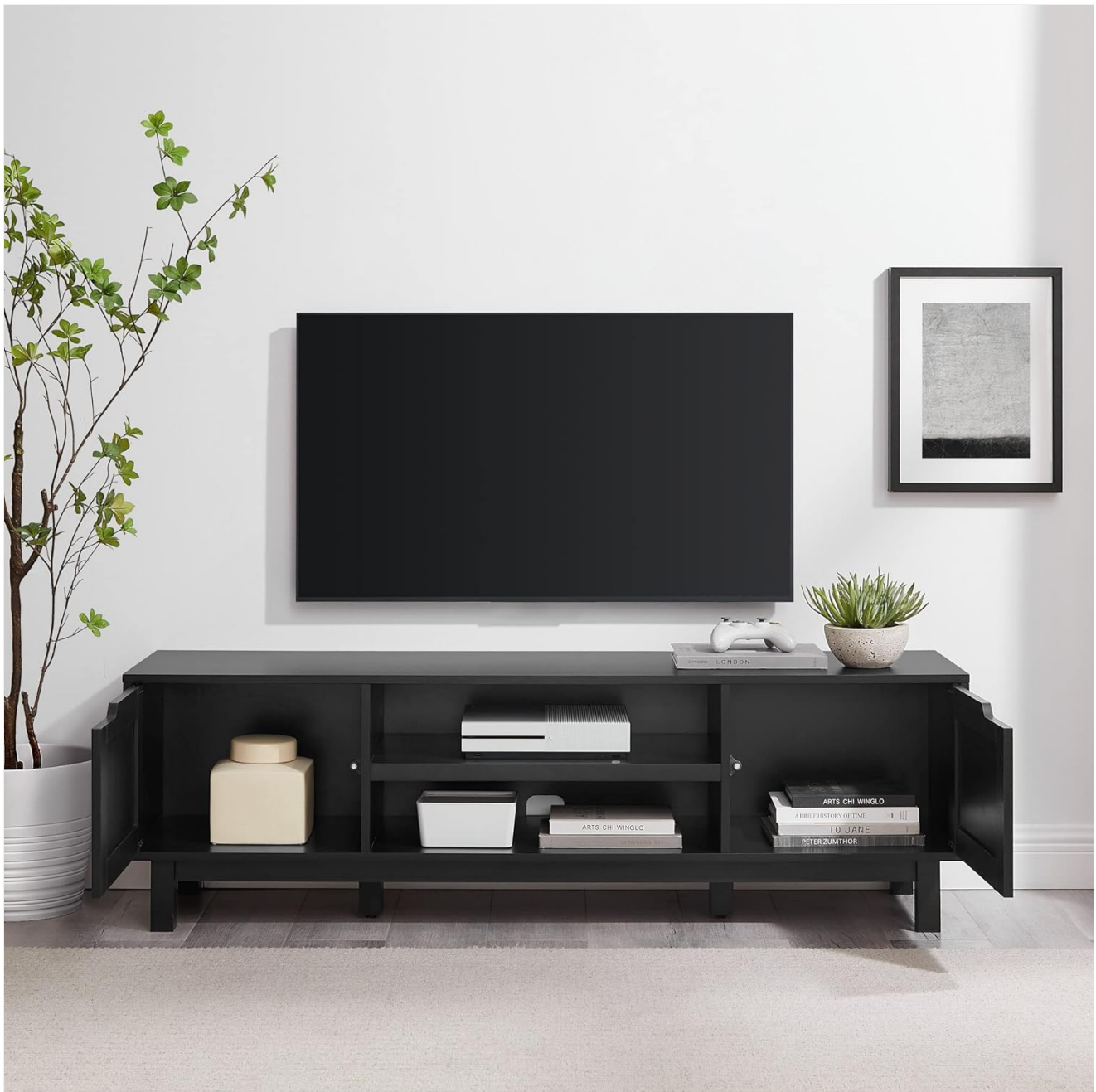
Image 5.1: The TV stand with its two cabinet doors open, revealing the internal storage space suitable for media consoles, books, or other items, alongside the central open shelves.