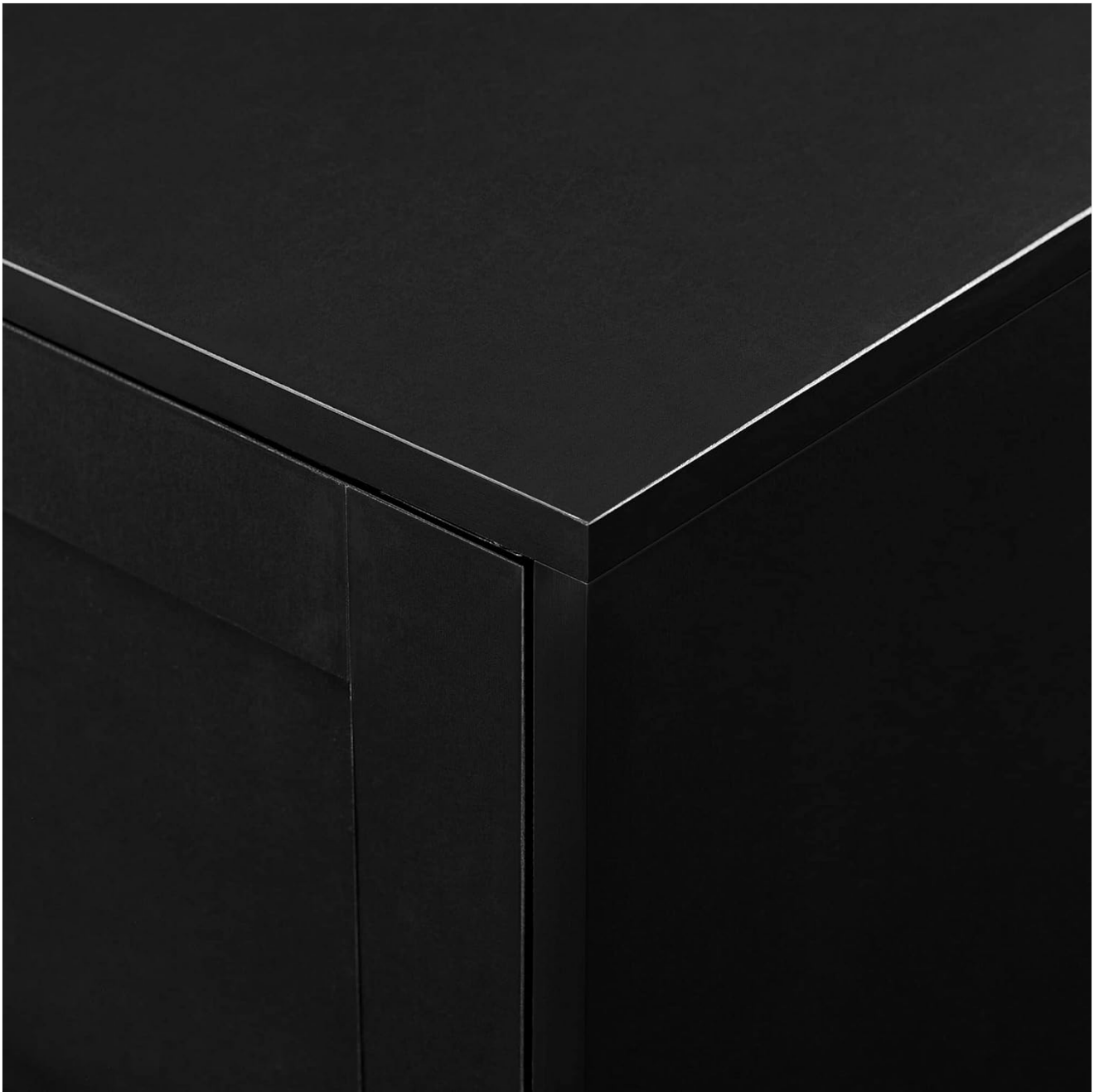
Image 6.1: A close-up view of the solid black laminate finish, highlighting the material and construction details.