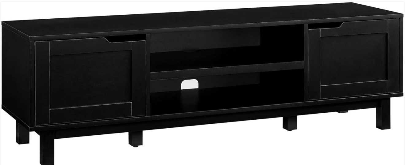
Image 1.1: The Walker Edison Tage Modern Pull-Open Door Low TV Stand in Solid Black, showcasing its minimalist design and storage compartments.

This TV stand is designed to accommodate televisions up to 65 inches, offering a stylish and functional solution for your entertainment needs. It features two open storage cubbies and two cabinets with stylish finger-pull door openings, along with a cord management port to keep cables tidy.