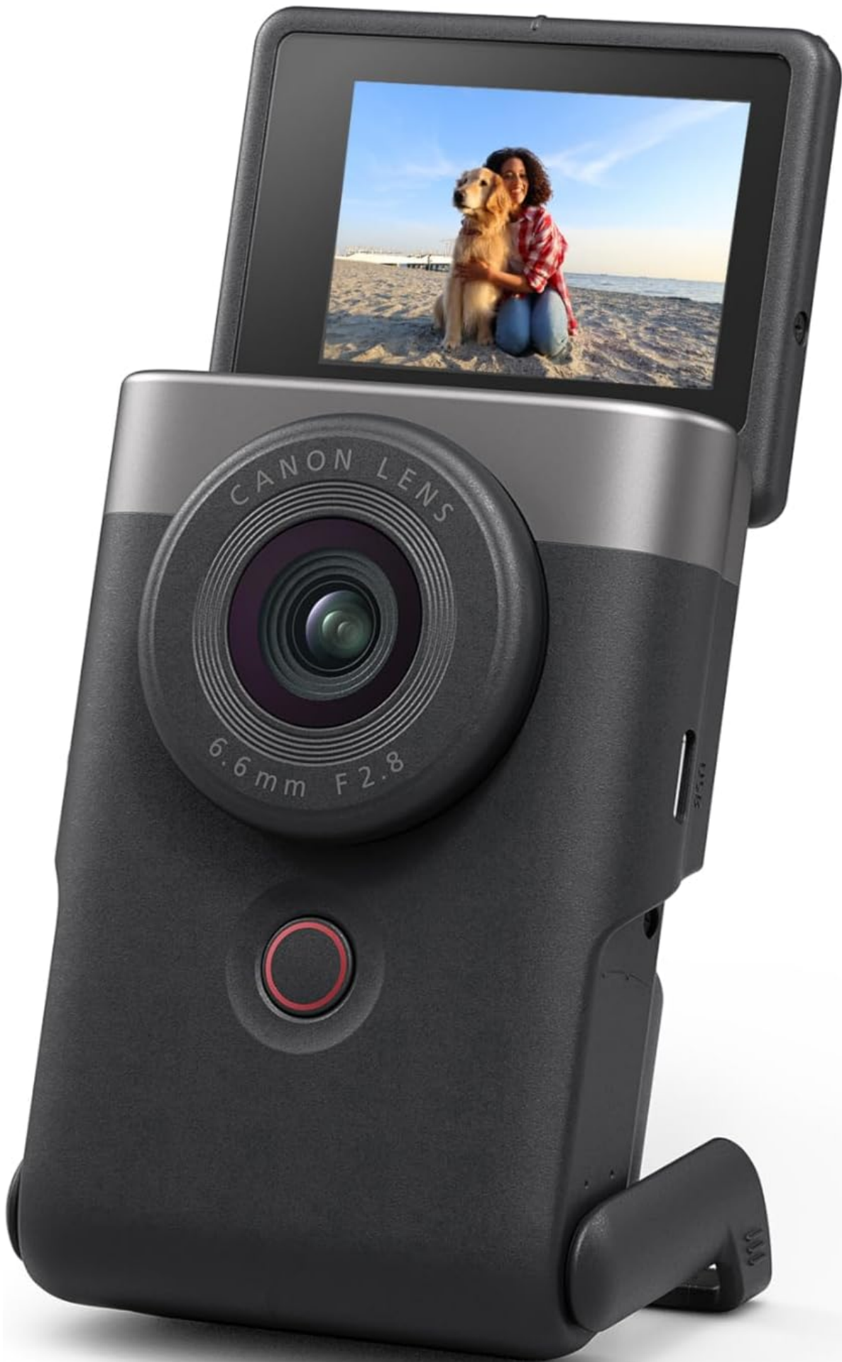
Figure 1.1: The Canon PowerShot V10 camera with its flip-up screen, ideal for vlogging and self-recording.