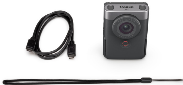
Figure 2.1: Included accessories with the Canon PowerShot V10 camera.