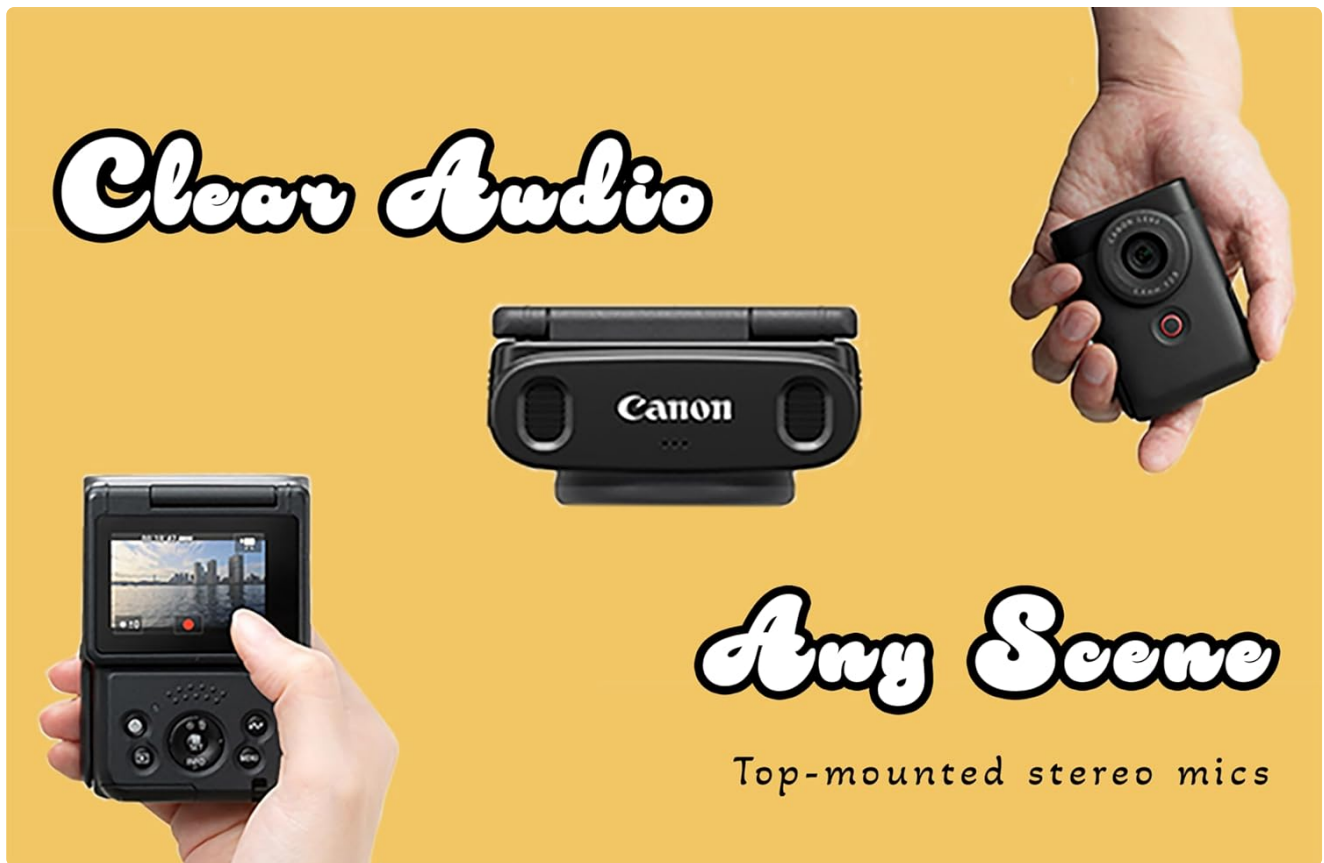
Figure 4.1: Rear controls of the PowerShot V10.