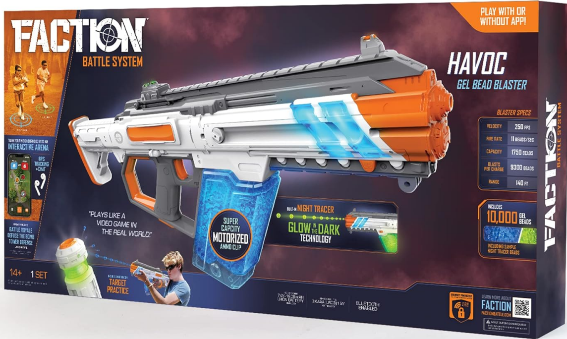
Image: All components included in the Faction Havoc Gel Bead Blaster package, laid out clearly.