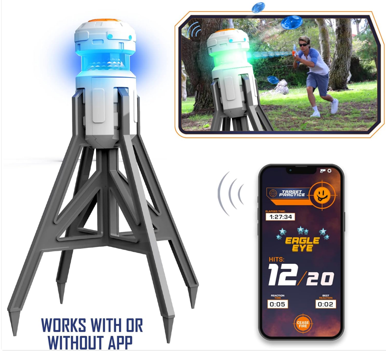
Image: The Interactive Smart Beacon on its stand, with an inset showing a user shooting at it. A smartphone screen displays the "Target Practice" interface from the Faction app, showing hits and reaction time.