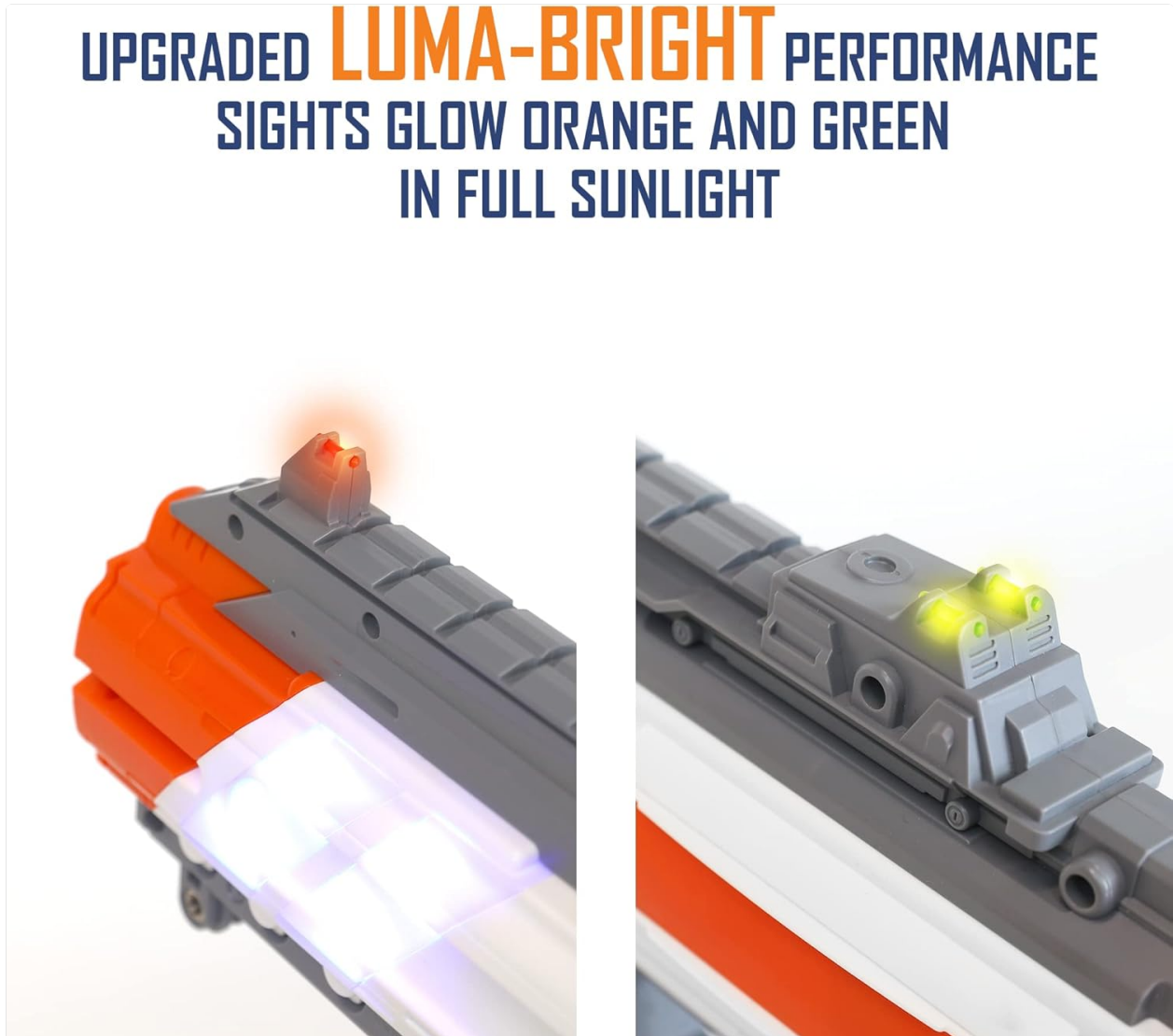
Image: Close-up views of the front and rear Luma-Bright sights on the Faction Havoc Blaster, showing their orange and green glow in daylight conditions.

The Luma-Bright sights are designed for precision aiming, glowing orange and green in full sunlight for improved visibility.