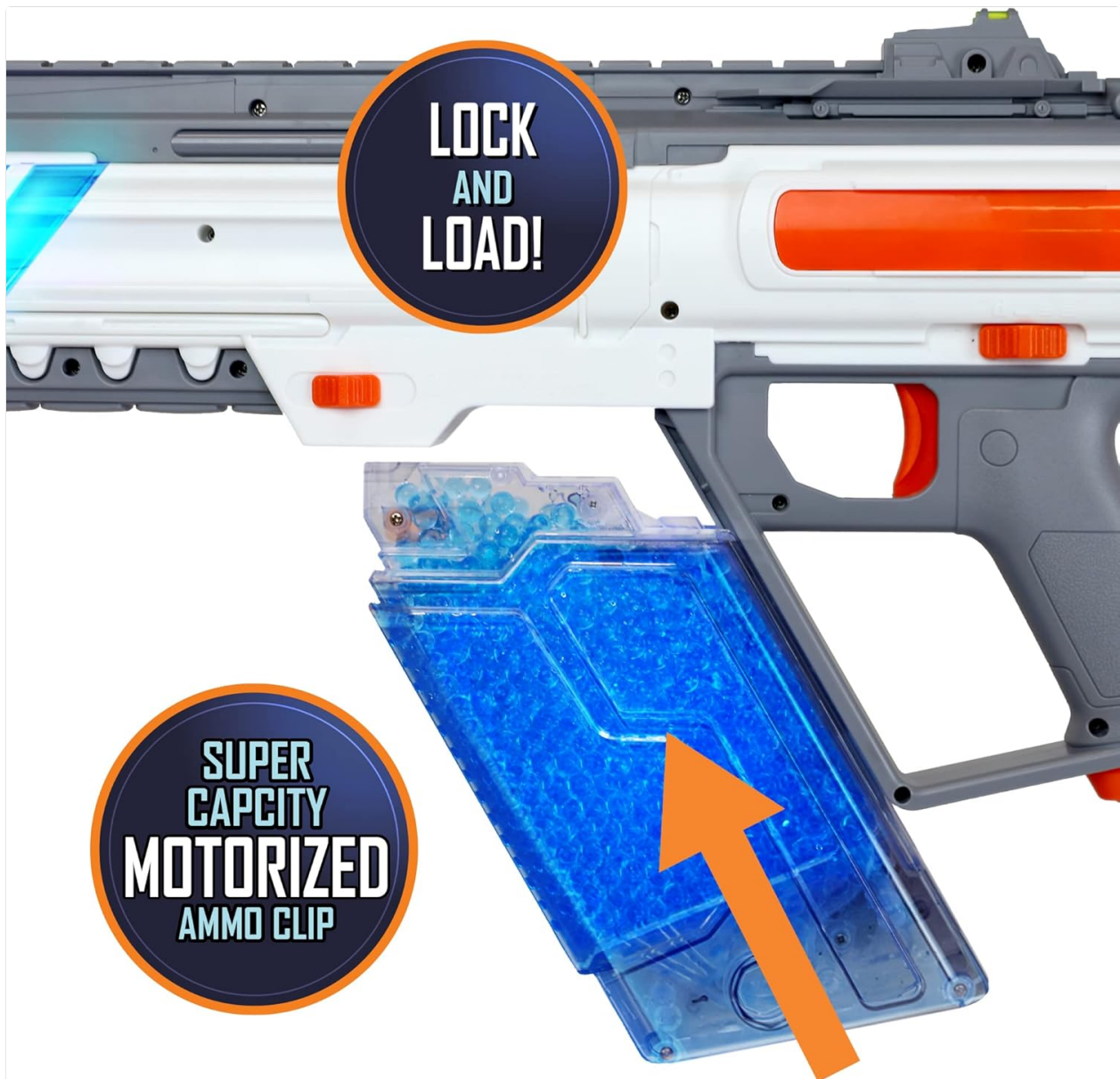
Image: Close-up of the blaster's motorized ammo clip, with an arrow indicating the direction to load gel beads, and text "LOCK and LOAD!" and "SUPER CAPACITY MOTORIZED AMMO CLIP".