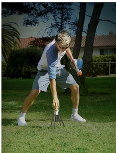
A FLAG TO CAPTURE

The smart beacon can also be used as a multifunction objective, adversary or marker...in both the real and virtual game world. The Faction gameserver tracks the beacon's location and status, the exact same way it tracks players in real time.