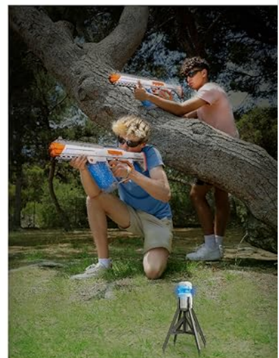
A TOWER TO DEFEND