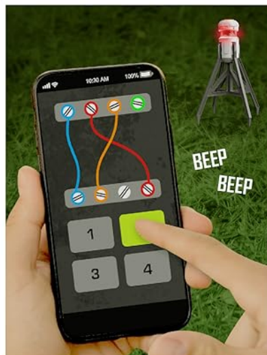
A BOMB TO DEFUSE