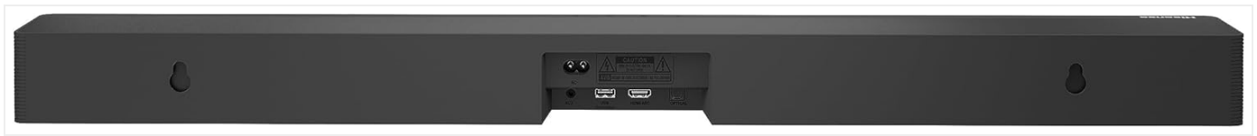
Image: The rear panel of the Hisense HS2100 Sound Bar, highlighting the available input ports for various connections.