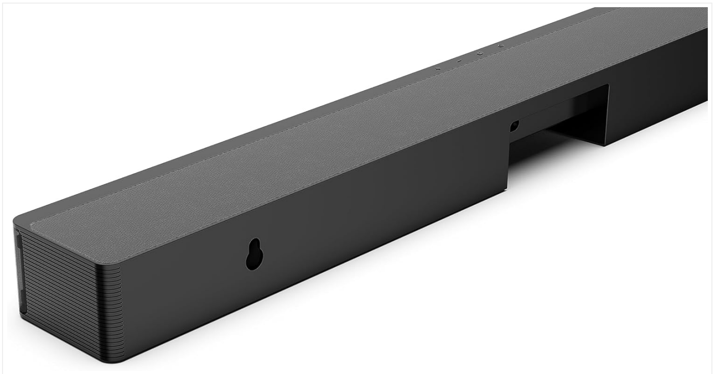
Image: A close-up of the Hisense HS2100 Sound Bar's rear, indicating the keyholes for wall mounting.