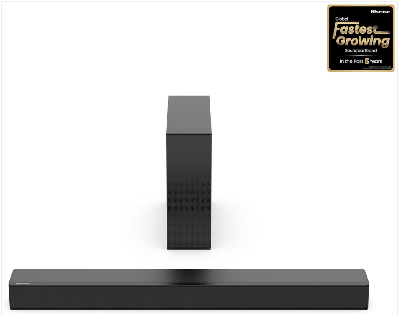
Image: The Hisense HS2100 sound bar and its accompanying wireless subwoofer, showcasing their sleek, compact design.