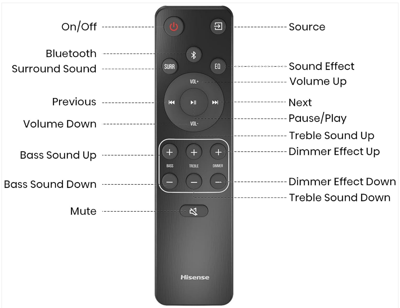
Image: The remote control for the Hisense HS2100 Sound Bar, detailing the function of each button for easy operation.