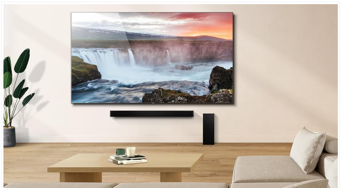
Image: The Hisense HS2100 sound bar and wireless subwoofer integrated into a modern living room environment, demonstrating its aesthetic appeal and placement flexibility.