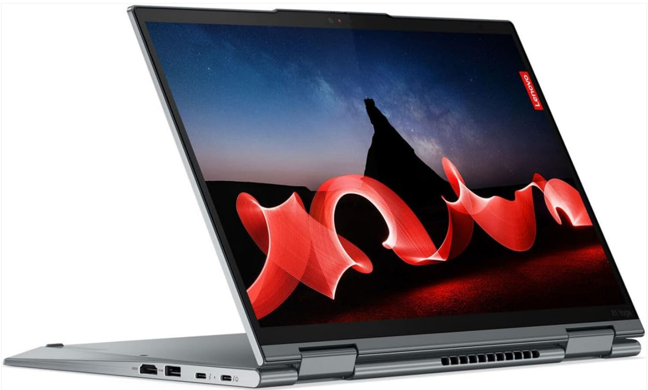
Figure 1.1: Lenovo ThinkPad X1 Yoga Gen 8 in its standard laptop configuration.

The Lenovo ThinkPad X1 Yoga Gen 8 is an ultralight and versatile 14-inch business 2-in-1 notebook designed for productivity and adaptability. It features a stunning display and supports multiple flexible modes to suit various work, presentation, creation, and connection needs. This manual provides essential information for setting up, operating, maintaining, and troubleshooting your device.