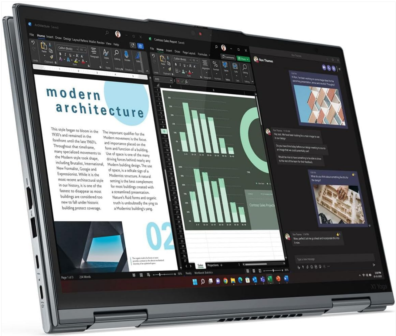
Figure 4.2: Stand Mode for presentations and touch interaction.