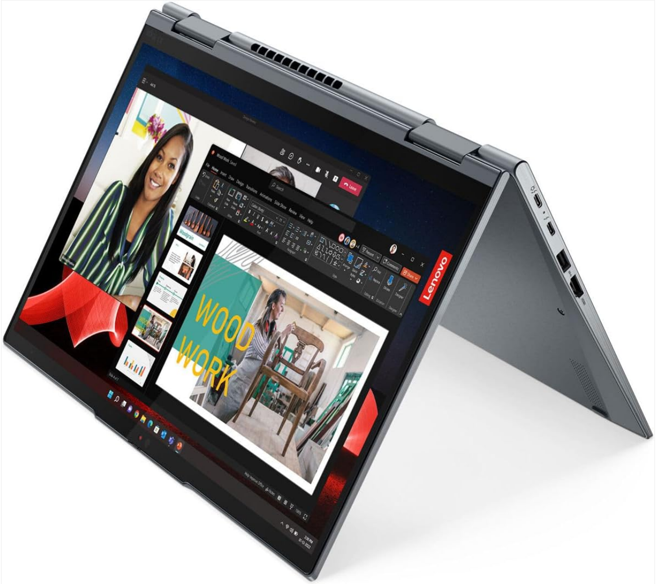
Figure 4.1: Tent Mode for media viewing.