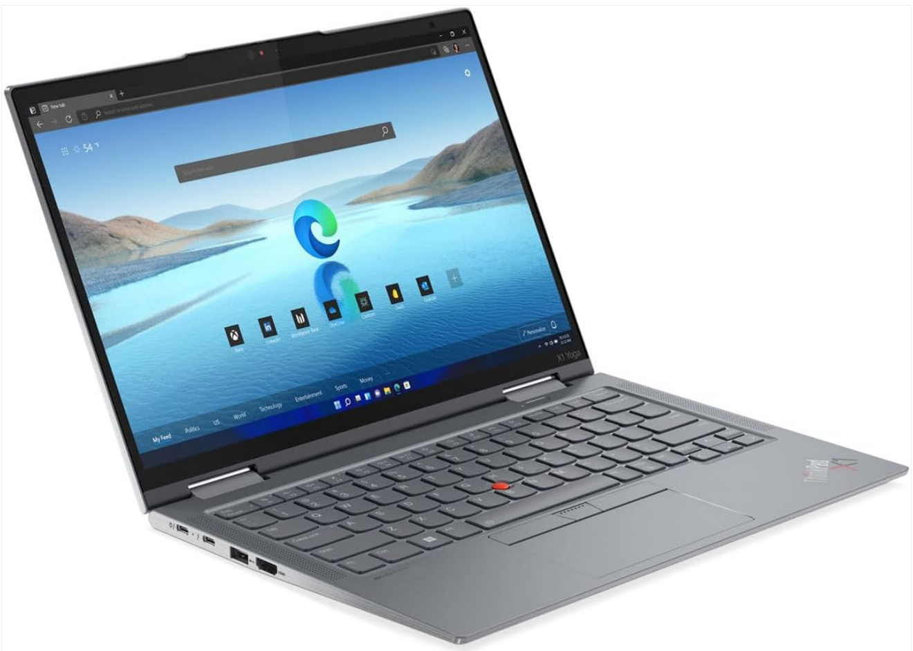
Figure 3.1: Side view illustrating the various ports for connectivity and power.