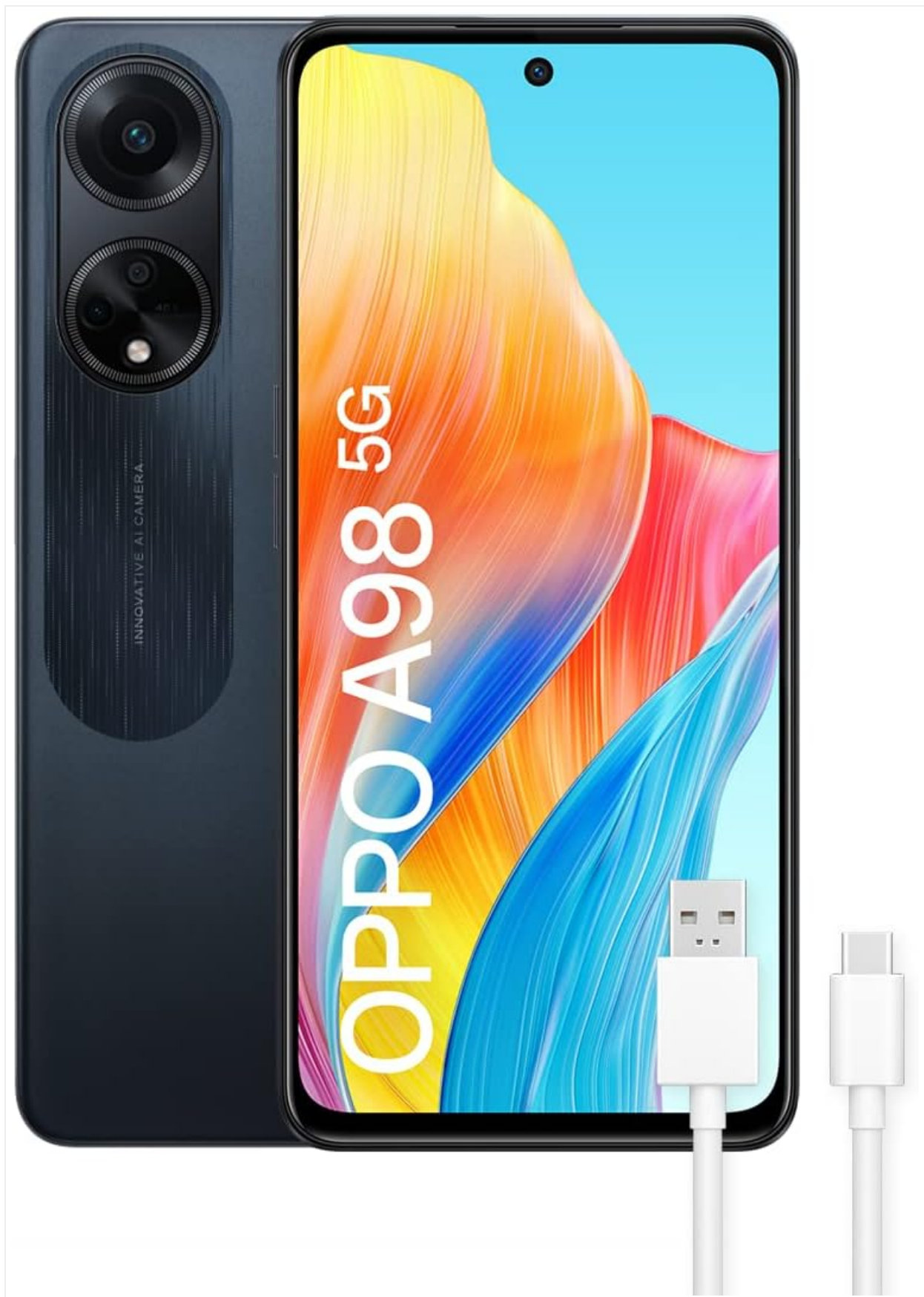
Figure 1.1: Front and rear view of the OPPO A98 5G smartphone, showcasing its design and included USB-C cables.