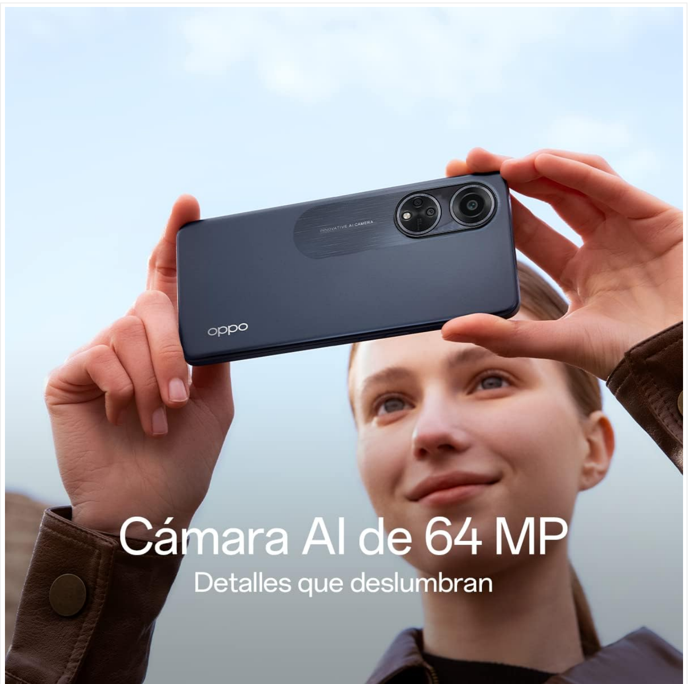
Figure 3.3: A user holding the OPPO A98 5G, demonstrating the use of its 64MP AI Camera for capturing detailed images.