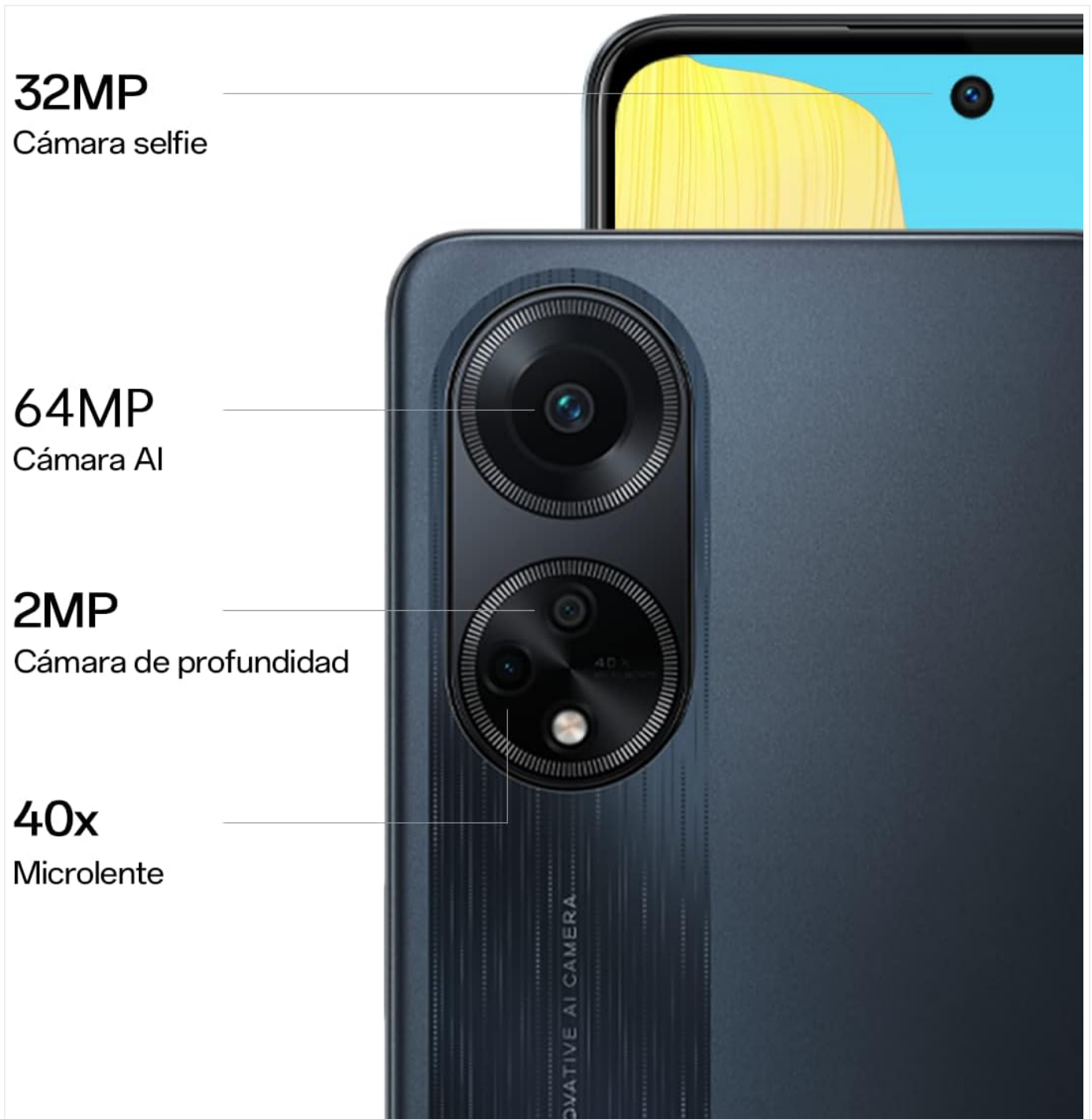
Figure 3.2: Detailed view of the OPPO A98 5G's camera module, highlighting the 32MP selfie camera, 64MP AI main camera, 2MP depth camera, and 40x microlens.