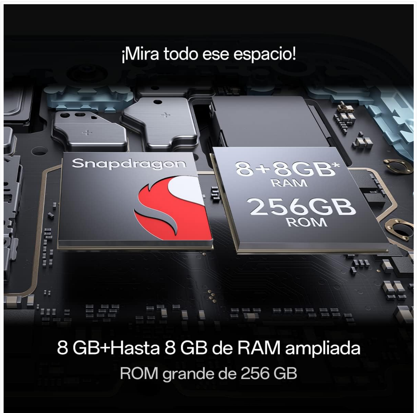
Figure 6.1: Internal view of the OPPO A98 5G, highlighting the Snapdragon processor, 8GB RAM, and 256GB ROM storage components.