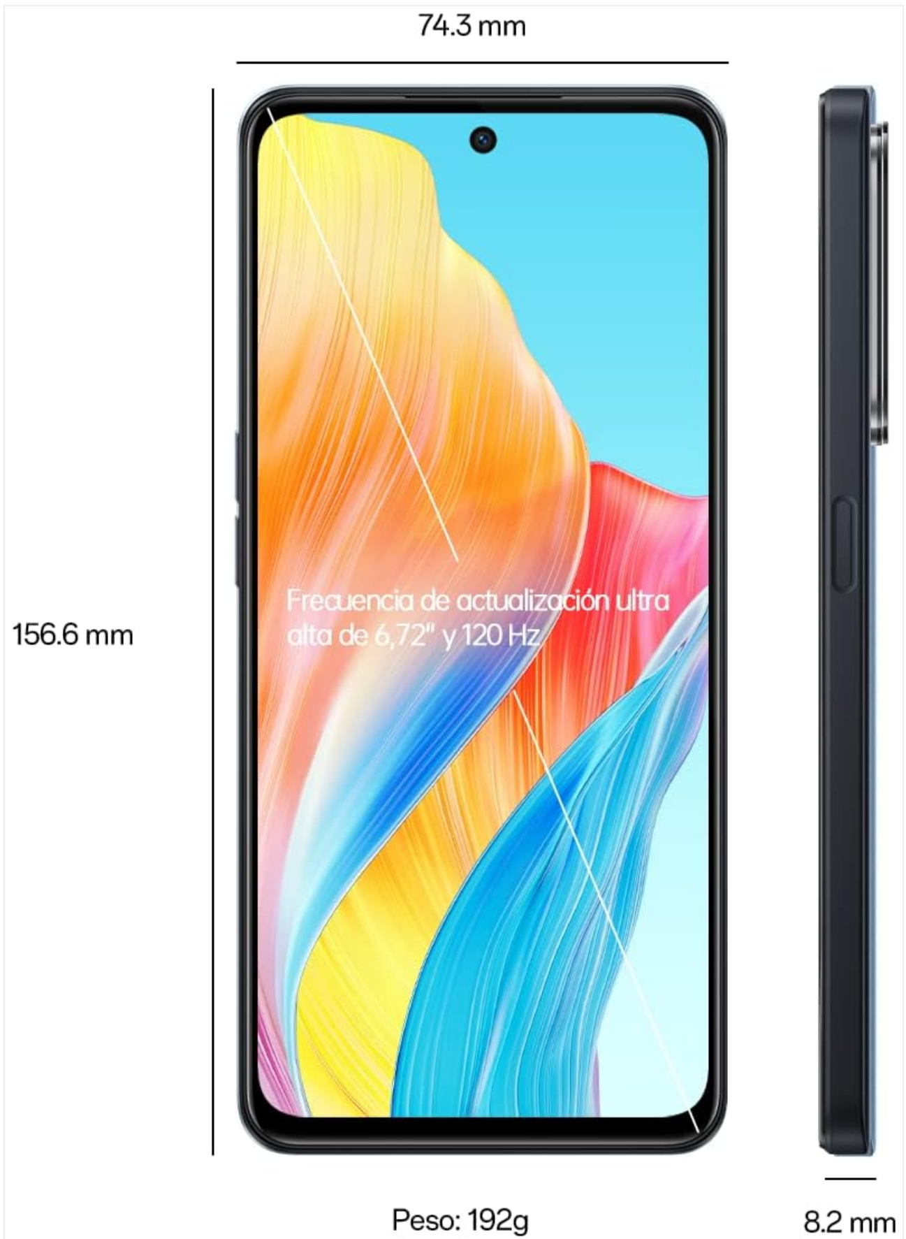
Figure 3.1: Side view of the OPPO A98 5G, illustrating its slim profile and button placement, along with key dimensions.

The OPPO A98 5G features a responsive touchscreen for navigation. Swipe, tap, and pinch gestures are used to interact with the interface. Physical buttons include the Power button and Volume buttons for controlling device functions.