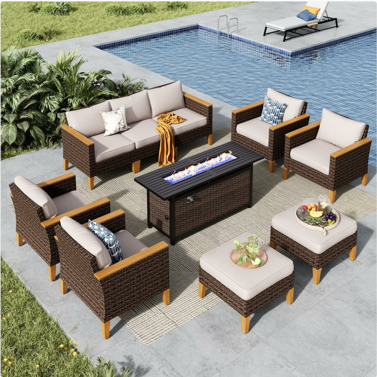
Image 1: Complete MFSTUDIO 9-Piece Wicker Patio Furniture Set with 56-inch Fire Pit Table.