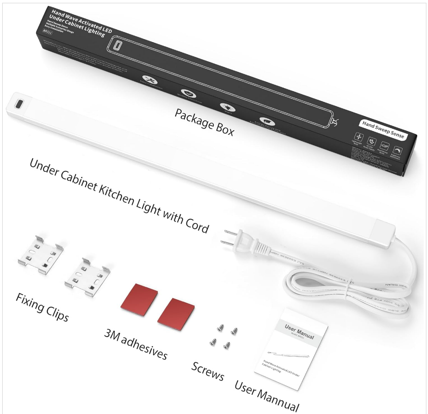
Image: All components included in the MYPLUS Under Cabinet Light package.