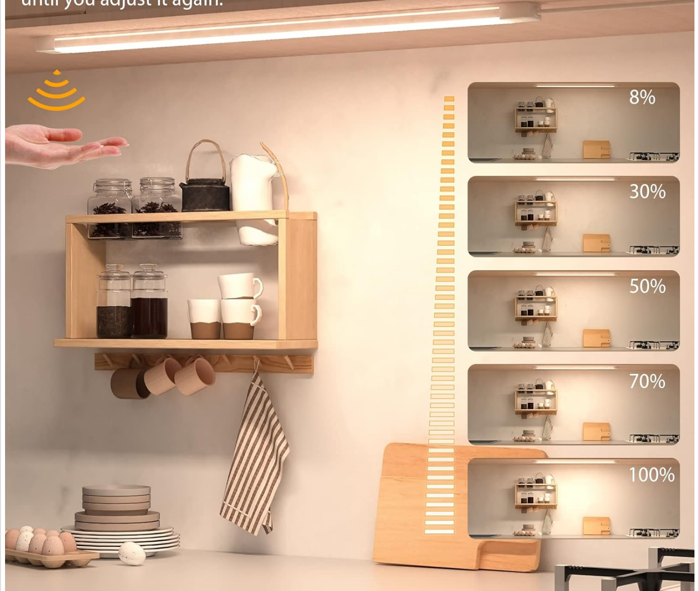
Image: Demonstrates the hand wave gesture to activate or deactivate the light.

The light will remember the brightness until you adjust it again.