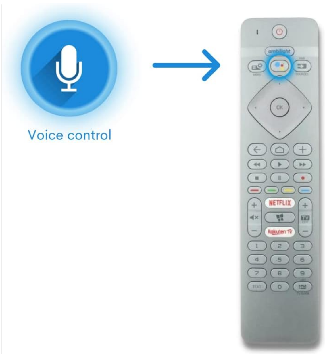
Image 2: Illustration showing the voice control icon and its activation on the BELIFE remote control, pointing to the blue button with a microphone symbol.