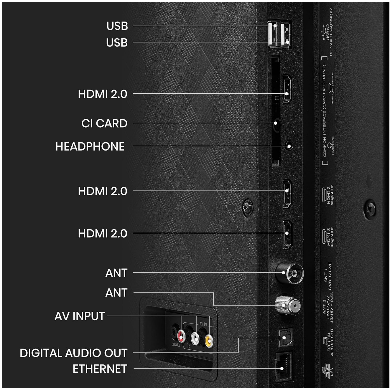
Figure 4: Detailed view of the TV's rear panel with labeled connection ports.