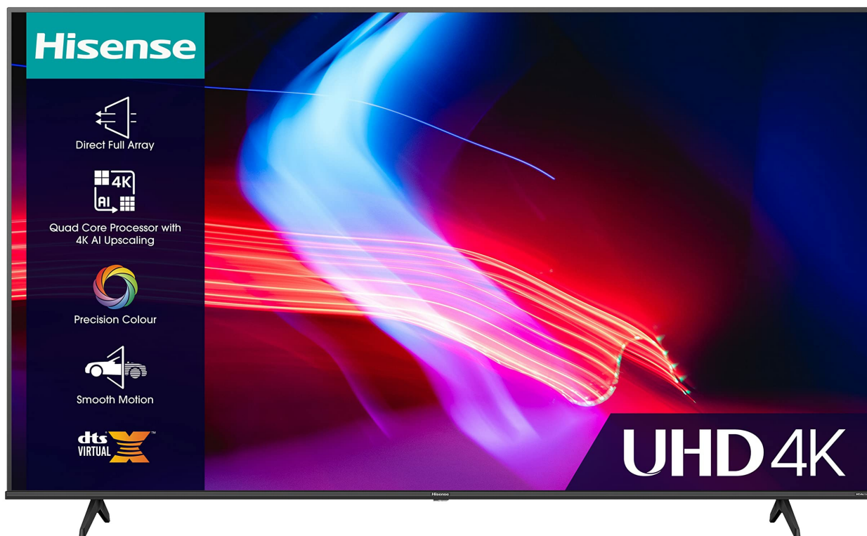
Figure 1: Front view of the Hisense VIDAA Smart TV 58A6KTUK.