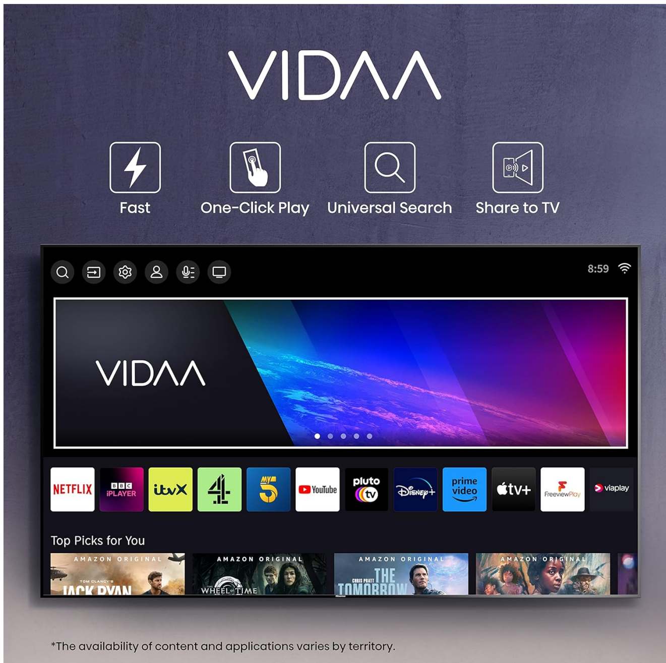
Figure 6: The VIDAA Smart TV home screen with various application icons.