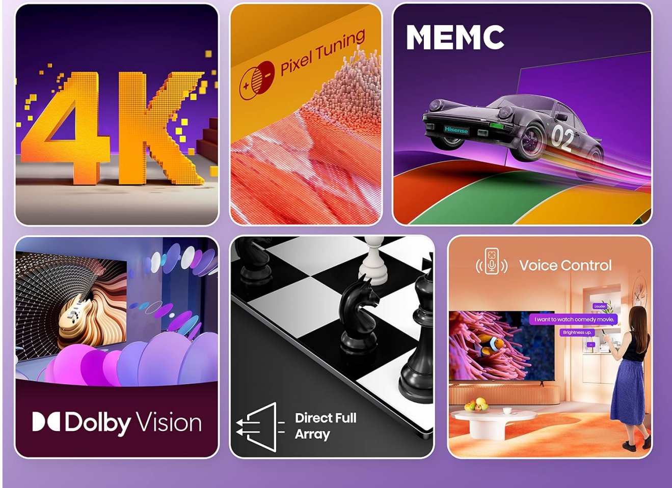
Figure 8: Overview of the TV's top features, including 4K resolution, Pixel Tuning, MEMC, Dolby Vision, Direct Full Array, and Voice Control.