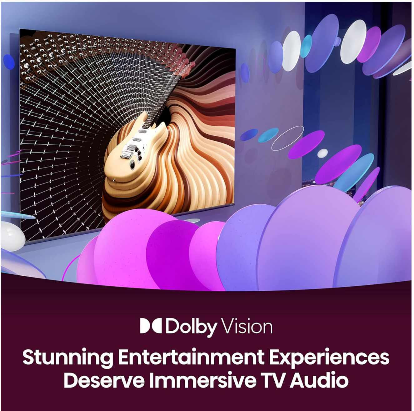
Figure 7: Visual representation of Dolby Vision technology and its impact on entertainment experience.