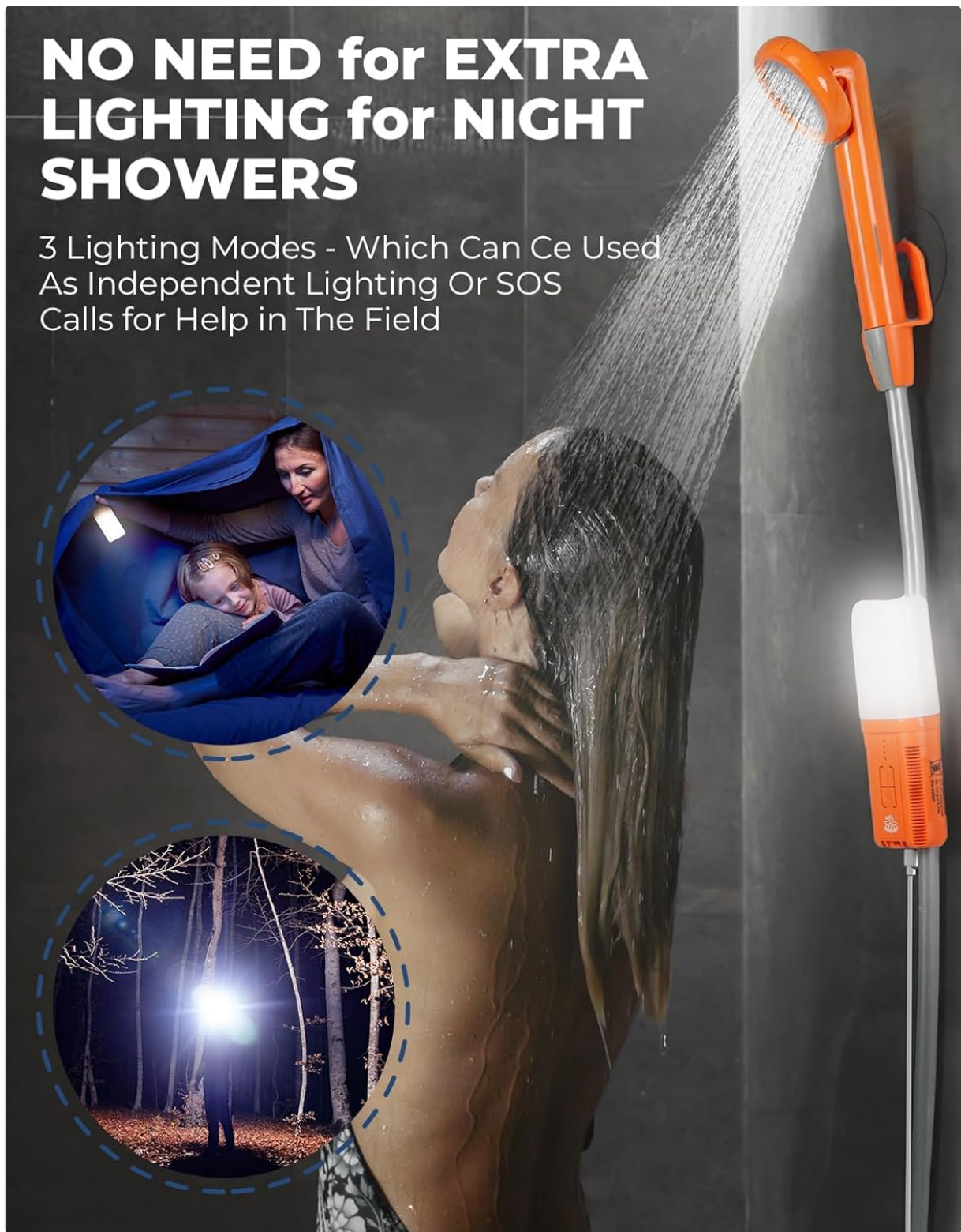
Image: Shows the portable shower in use with its integrated lighting, demonstrating its utility for night showers and as an independent light source.

3 Lighting Modes - Which Can Be Used As Independent Lighting Or SOS Calls for Help in The Field