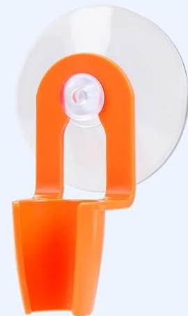
Image: Demonstrates how to hang the shower head using the provided hook on a branch and a suction cup hook on a car window.