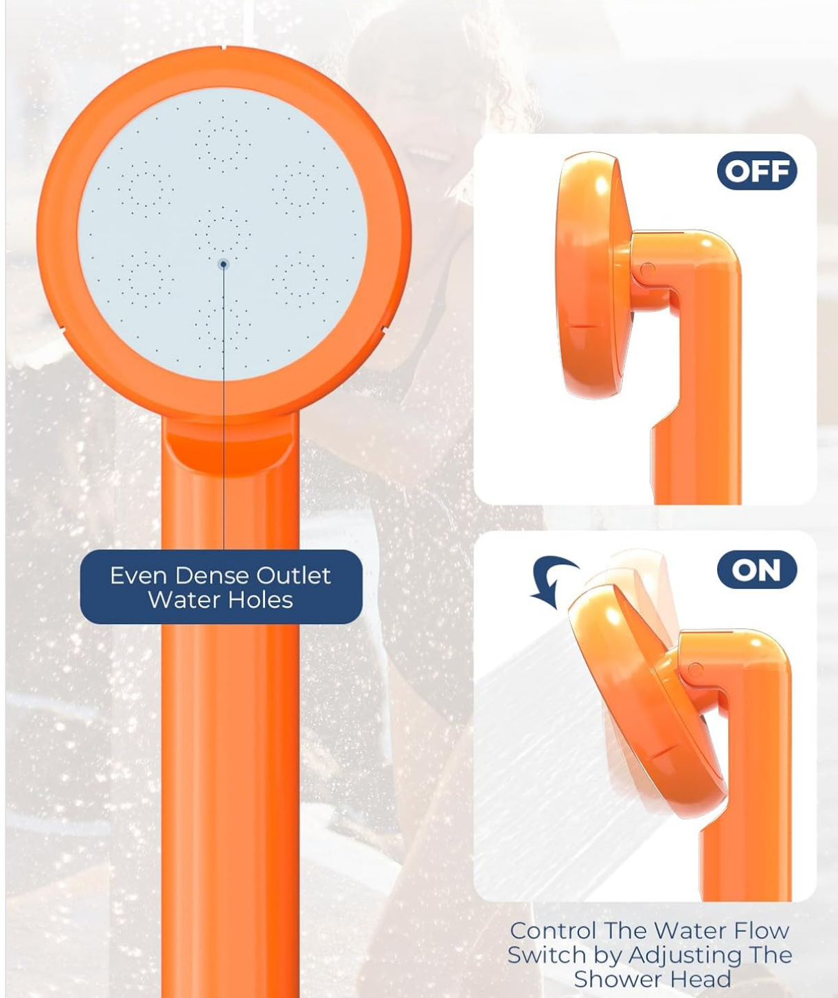
Image: Details the shower head's dense water outlet holes and the ON/OFF mechanism by adjusting its position.