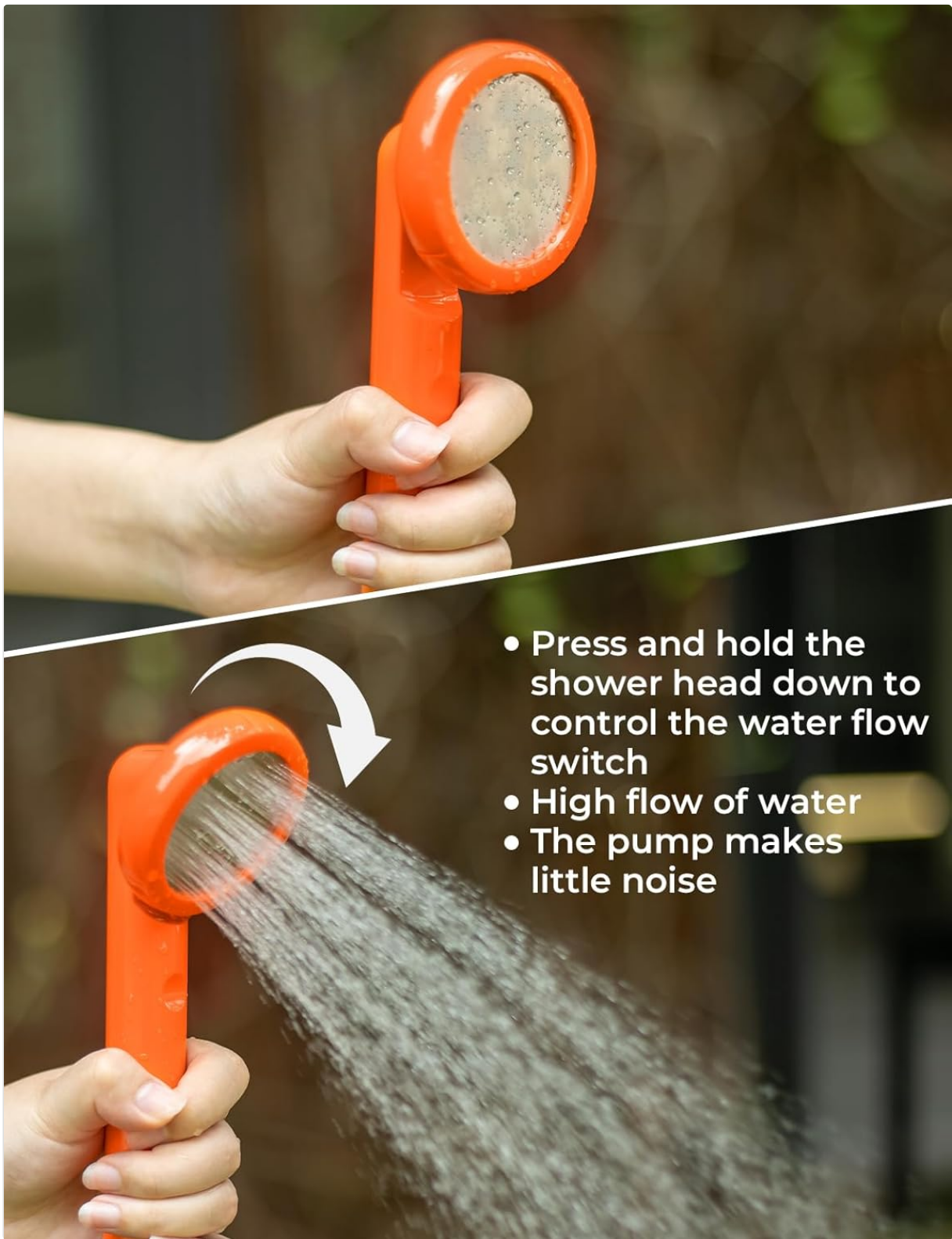
Image: Illustrates how to control the water flow by pressing and holding the shower head down.

ON/OFF control by adjusting the shower head position.