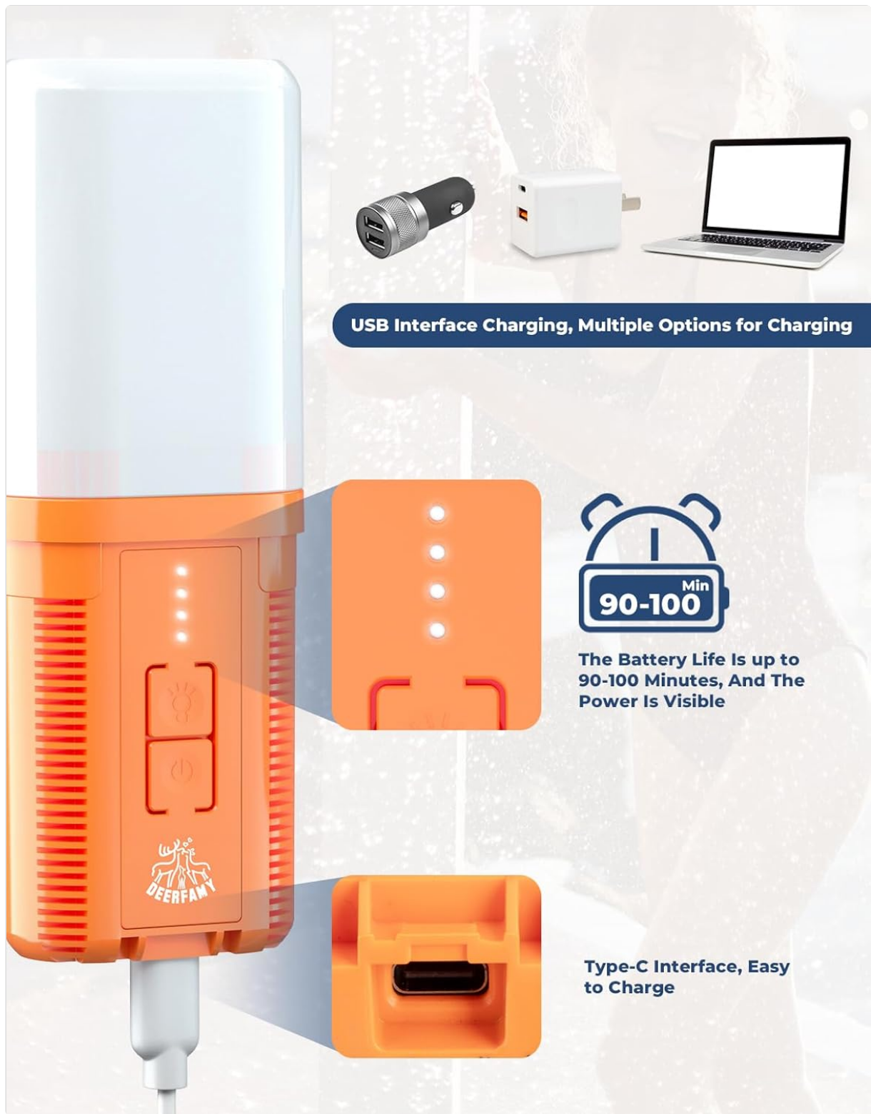
Image: Shows the battery unit with its Type-C charging interface and indicator lights, along with various USB charging options like a car charger, wall adapter, and laptop.