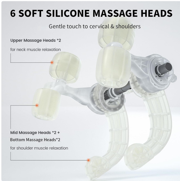
Figure 3: 5D Massage Head Configuration