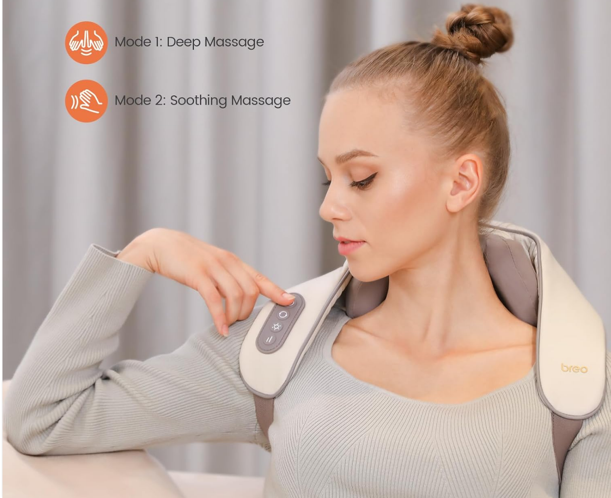
Figure 6: Control Panel and Modes