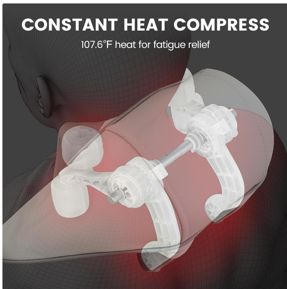
Figure 4: Constant Heat Compress