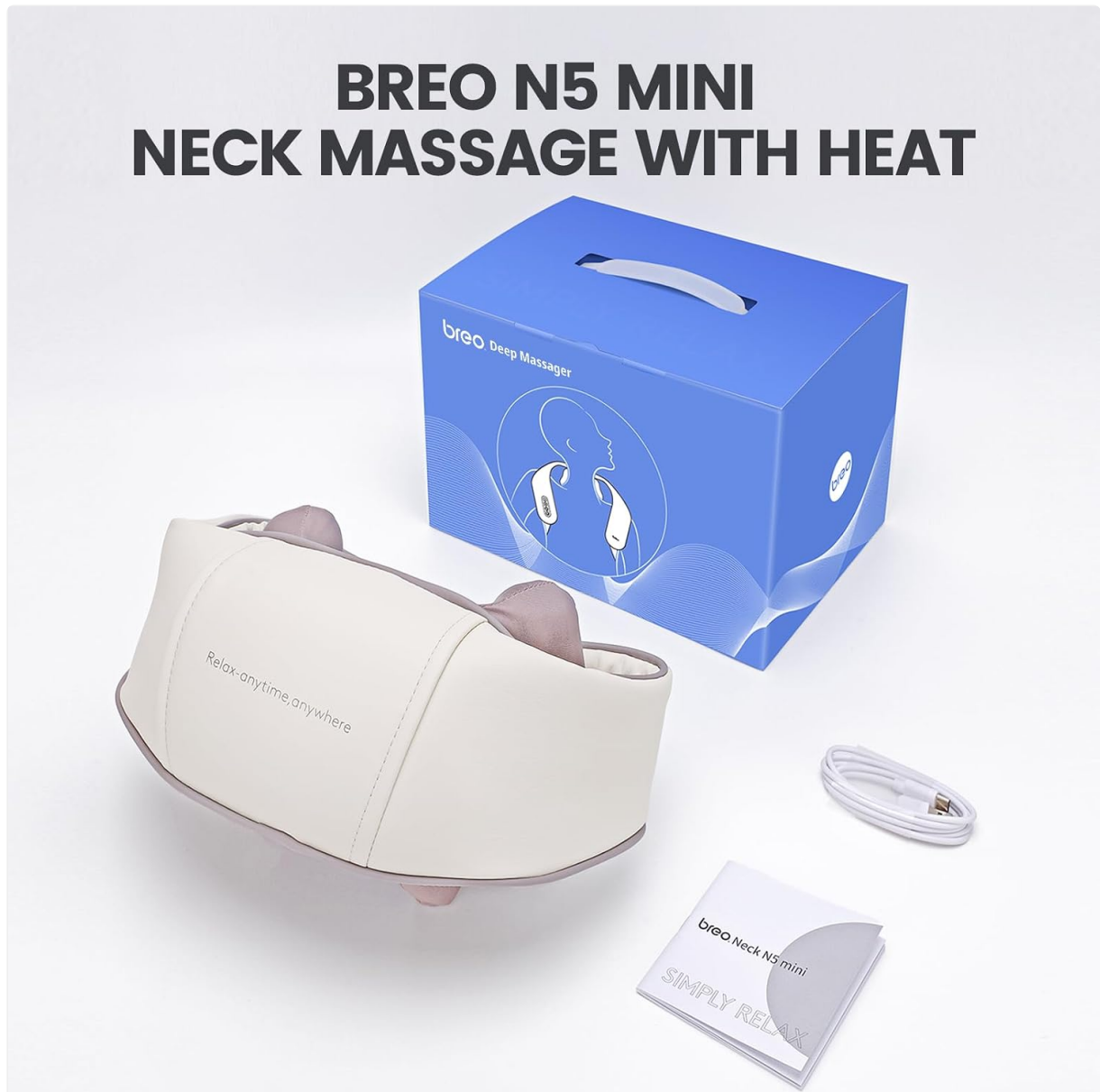
Figure 2: Package Contents