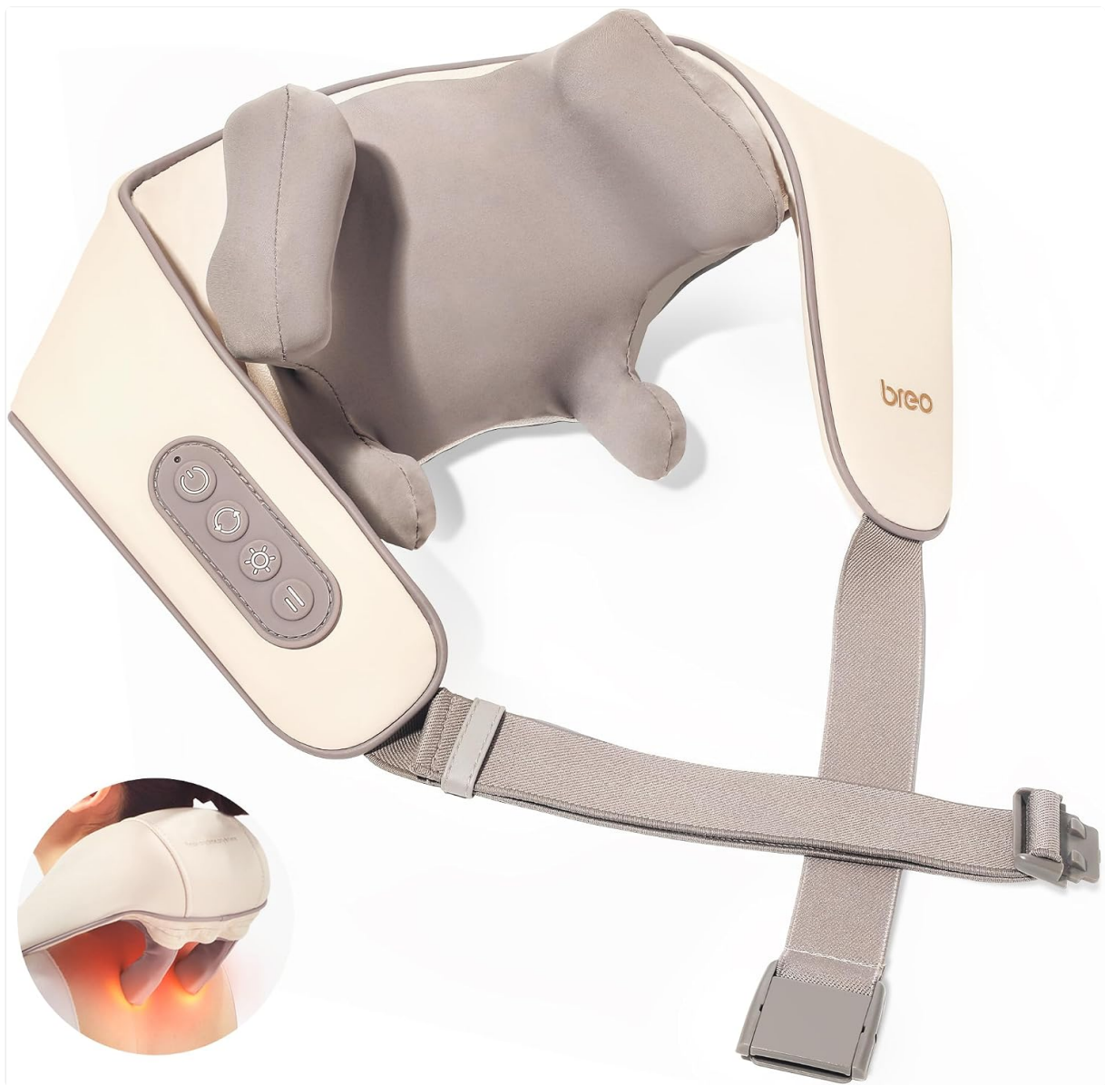
Figure 1: Breo N5 Mini Neck Massager