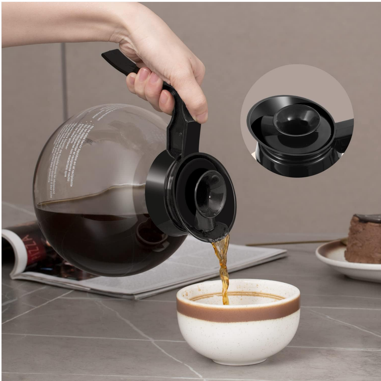
Image: Pouring coffee from the decanter.