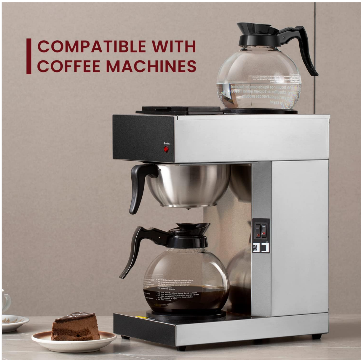
Image: Decanter placed on a compatible coffee machine.