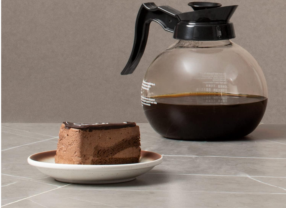
Image: Warning against direct heating of the decanter.