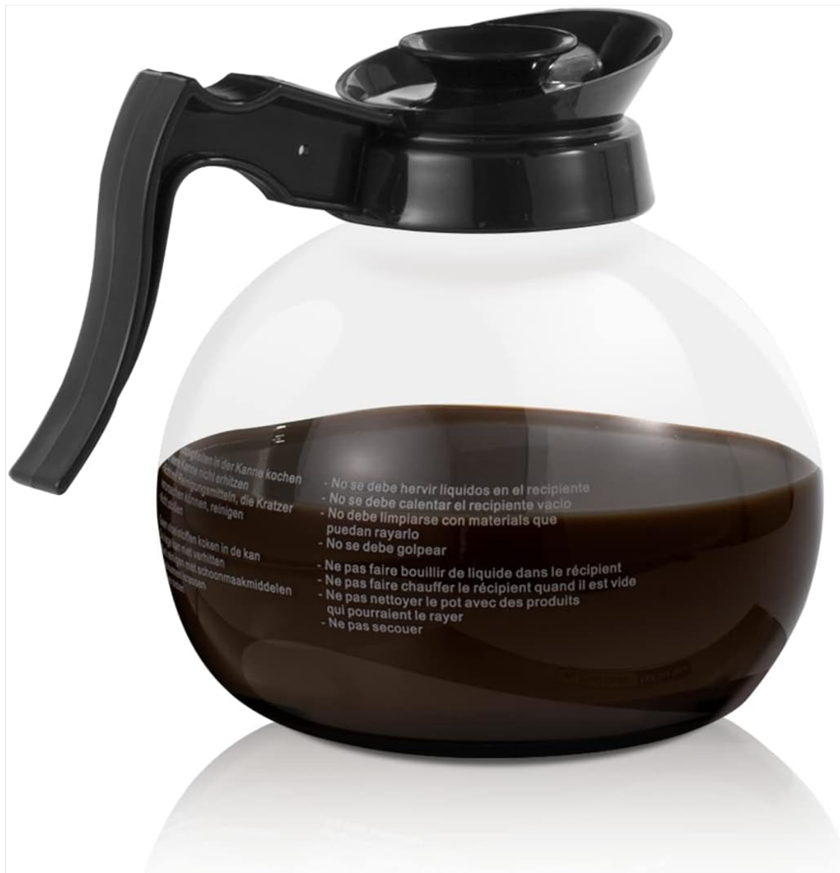
Image: SYBO 12-Cup Glass Coffee Decanter.