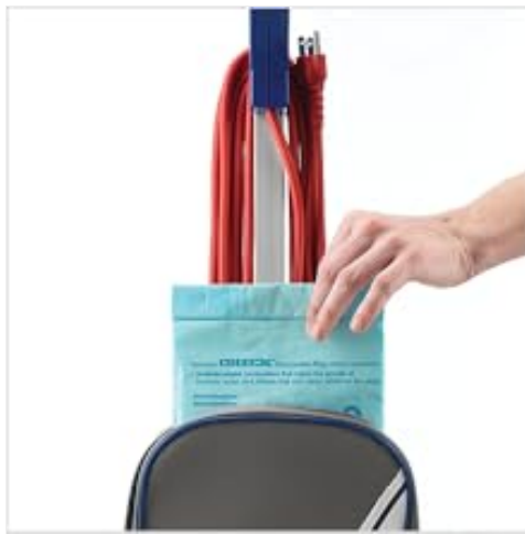
Figure 8: Demonstrates the simple process of replacing the disposable inner bag.

Periodically check the high-speed brush roll for tangled hair, threads, or debris. Unplug the vacuum before attempting to clean the brush roll. Use scissors to carefully cut away any entangled material. A clean brush roll ensures effective agitation and cleaning performance.