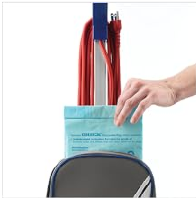
Figure 3: Illustrates the process of installing or checking the disposable inner bag. Ensure the bag is securely fitted for optimal performance.