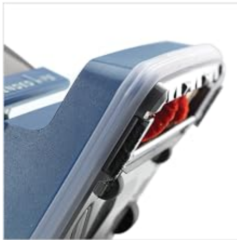
Figure 9: Close-up view of the high-speed brush roll, which should be regularly inspected for debris.

Periodically check the high-speed brush roll for tangled hair, threads, or debris. Unplug the vacuum before attempting to clean the brush roll. Use scissors to carefully cut away any entangled material. A clean brush roll ensures effective agitation and cleaning performance.