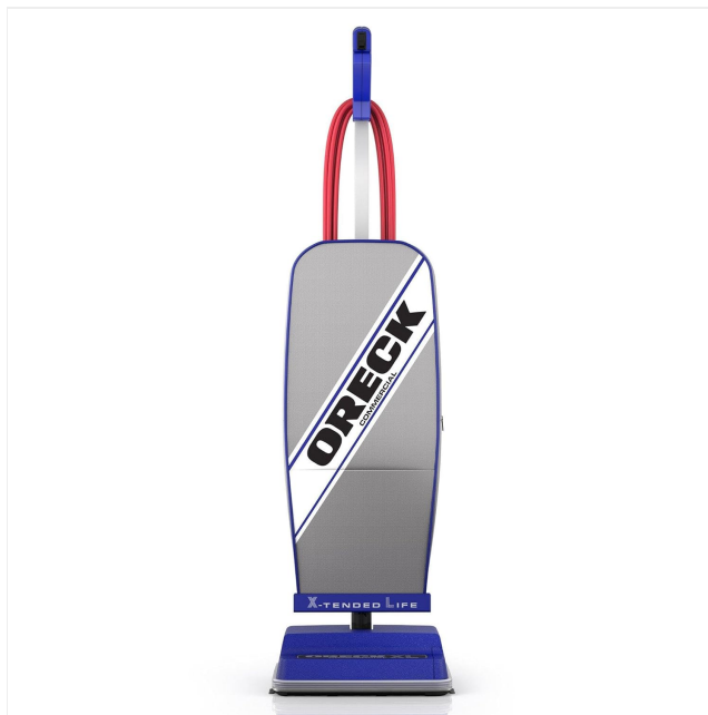
Figure 1: Oreck Commercial XL Upright Vacuum Cleaner. This image shows the full upright vacuum cleaner, highlighting its compact and functional design.

This user manual provides essential information for the safe and effective operation, maintenance, and troubleshooting of your Oreck Commercial XL Upright Vacuum Cleaner. Designed for powerful suction and durability, this lightweight vacuum is ideal for tackling tough messes on various floor types, including carpets and hard floors. Please read this manual thoroughly before initial use and retain it for future reference.