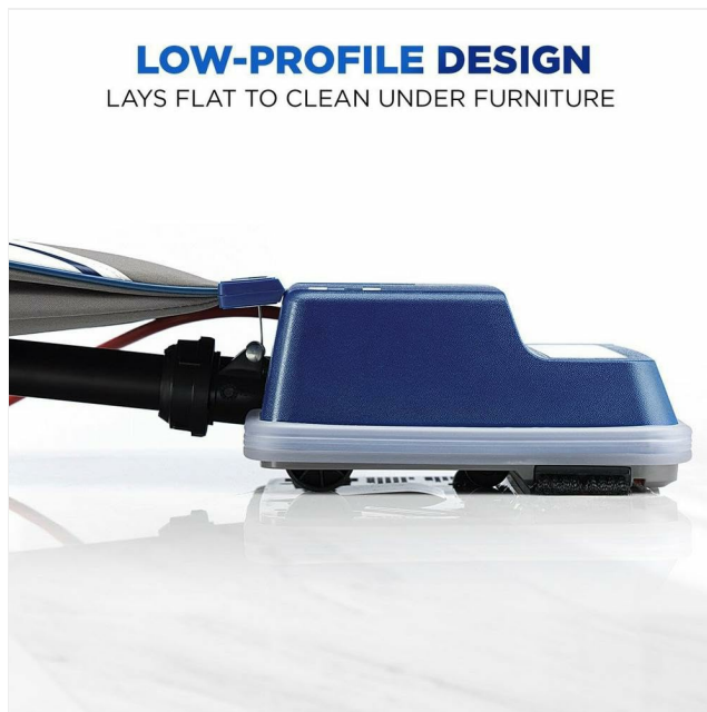
Figure 7: Illustrates the low-profile design of the vacuum, allowing it to reach under furniture for comprehensive cleaning.