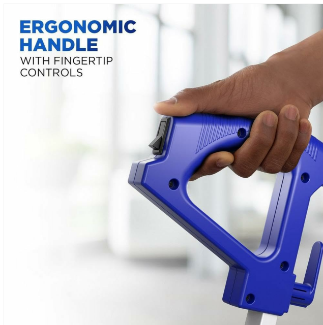
Figure 5: Close-up of the ergonomic Helping Hand Handle with fingertip controls, designed for comfortable operation.