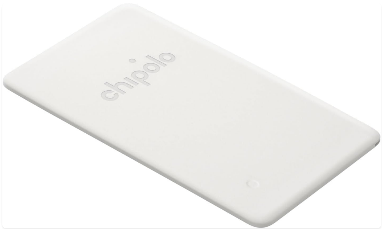
Image: The Chipolo Card Point, an off-white, rectangular Bluetooth tracker, designed to fit discreetly into wallets or passport holders.