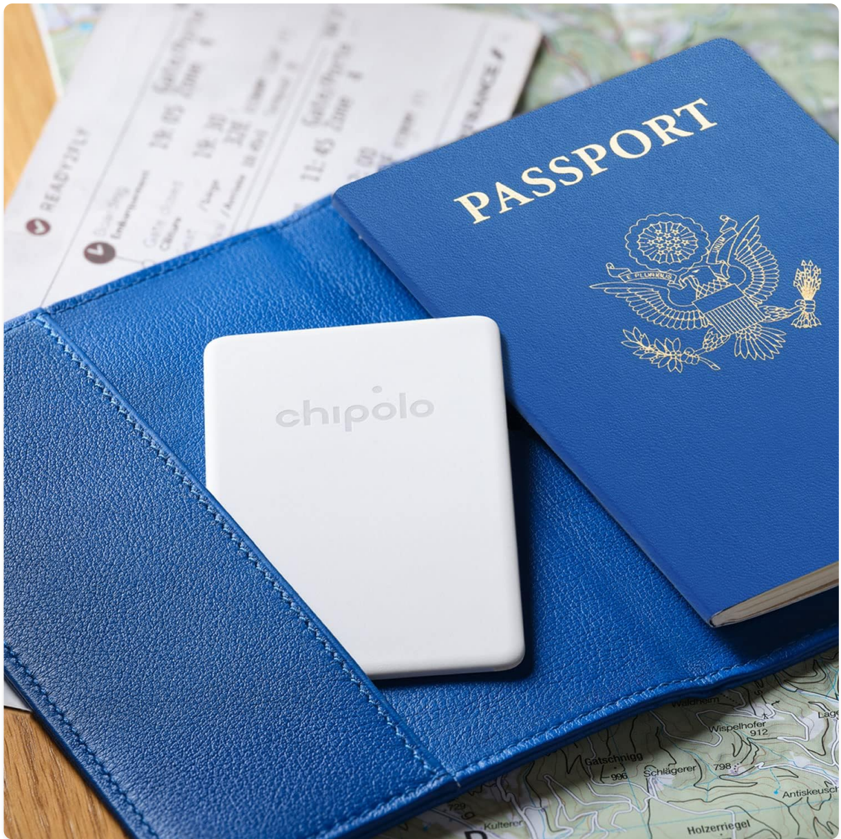
Image: The Chipolo Card Point is shown tucked into a passport holder, highlighting its slim profile and suitability for travel documents.