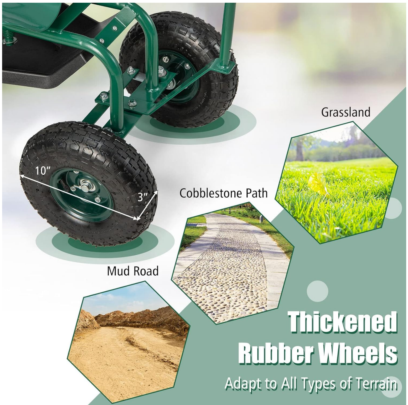
Image: The durable rubber wheels designed for stability and smooth movement across different outdoor surfaces. Equipped with thickened rubber wheels, the garden seat is designed to adapt to various outdoor terrains, including grassland, cobblestone paths, and mud roads. This ensures smooth movement and stability during your gardening activities.