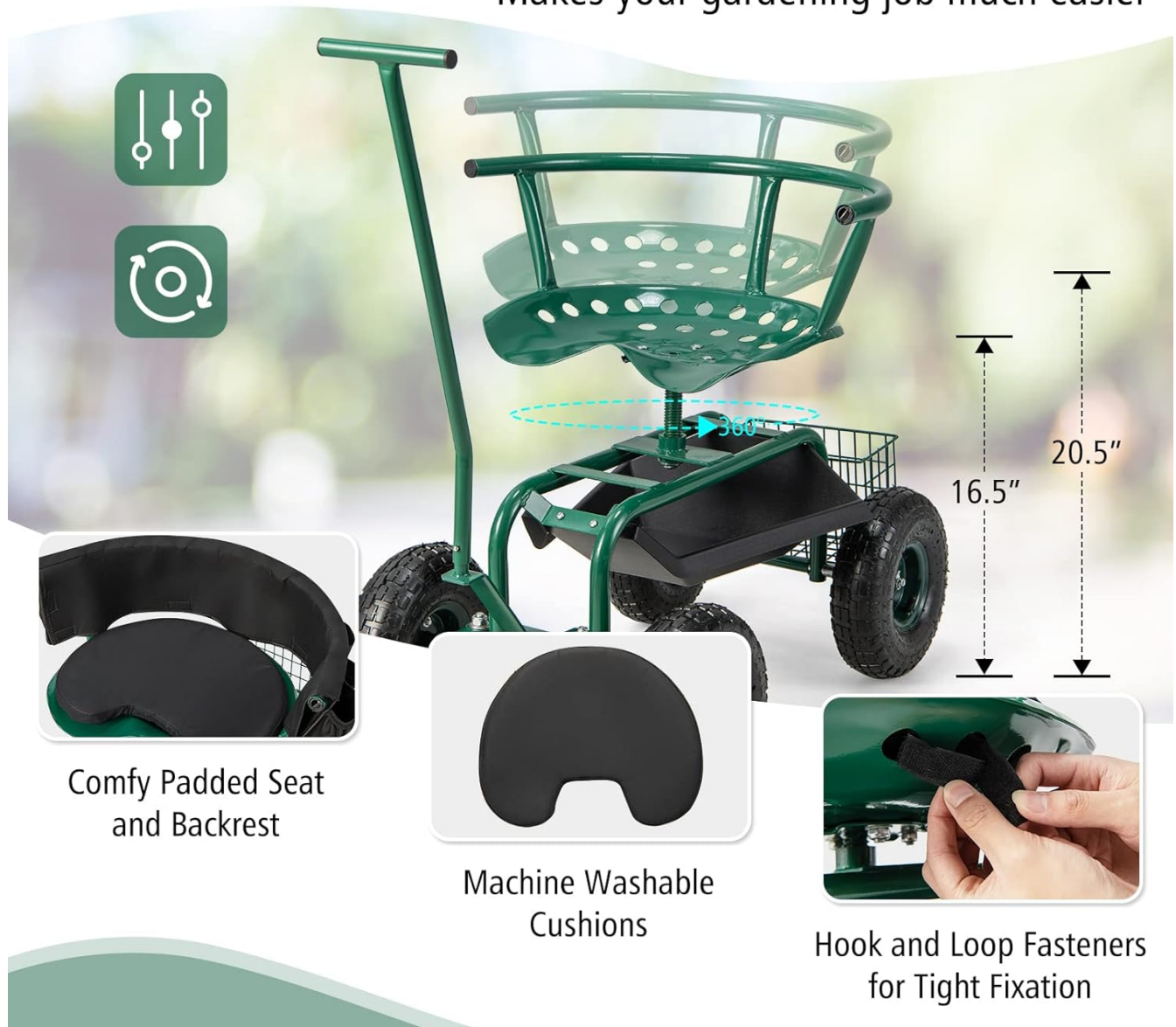
Image: The adjustable height and 360-degree swivel seat, allowing for comfortable positioning during gardening. The seat height can be adjusted from 16.5 inches to 20.5 inches to suit your preference and task. To adjust, loosen the locking mechanism under the seat, set to the desired height, and re-tighten securely. The 360-degree swivel feature allows you to rotate freely without repositioning the entire cart, reducing strain during work.