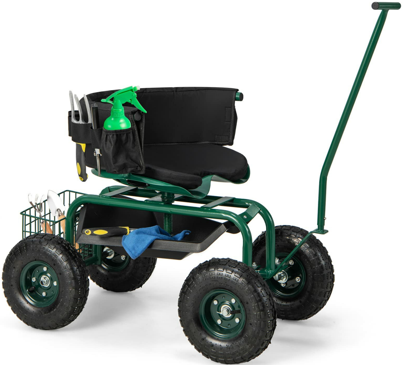
Image: The Goplus Rolling Garden Seat in use, demonstrating its comfort and utility for gardening tasks.