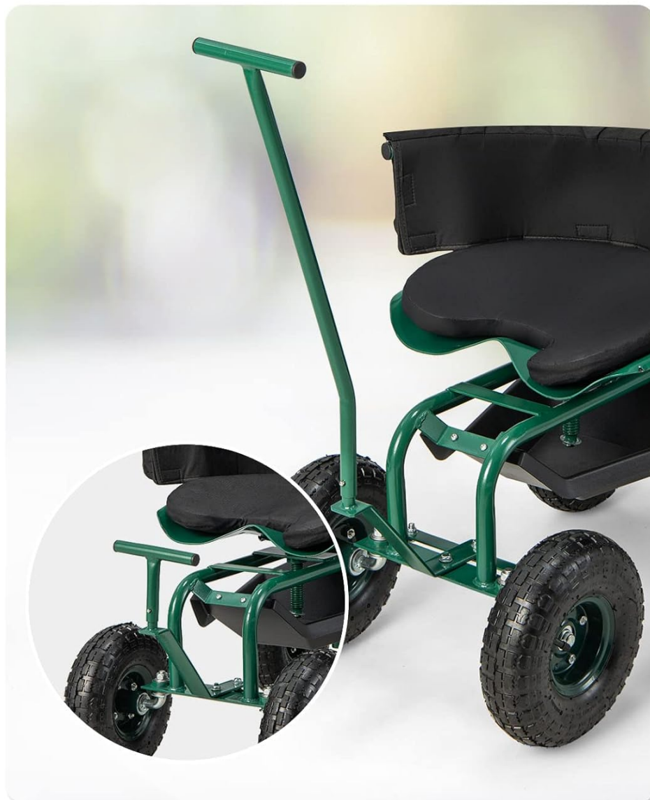
Image: The two available steering handles, offering flexibility for pulling the cart.

Choose the right one as needed to pull the cart easily