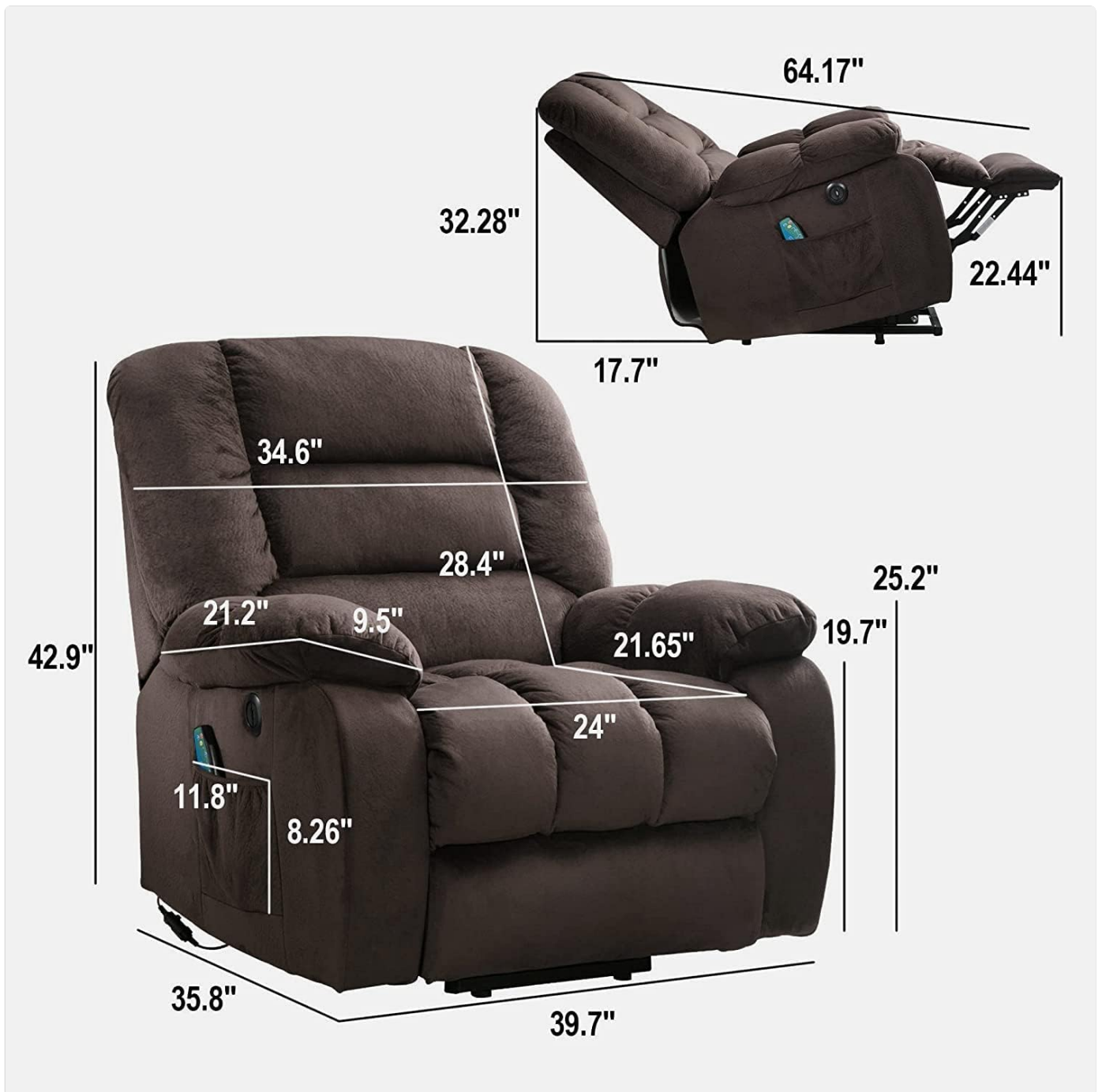
Figure 2: Recliner Dimensions. This diagram provides detailed measurements of the recliner in both upright and fully reclined positions.