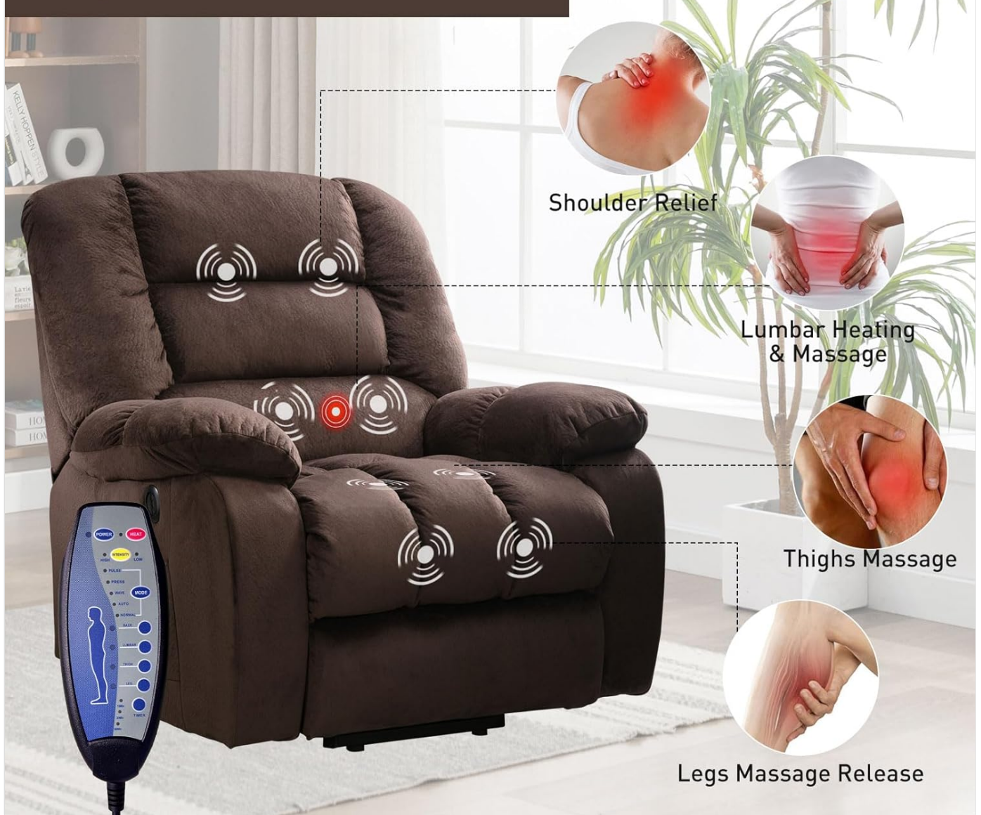
Figure 4: Massage and Heating Remote. This image displays the remote control with buttons for selecting massage zones, modes, intensity, and activating the lumbar heating function.