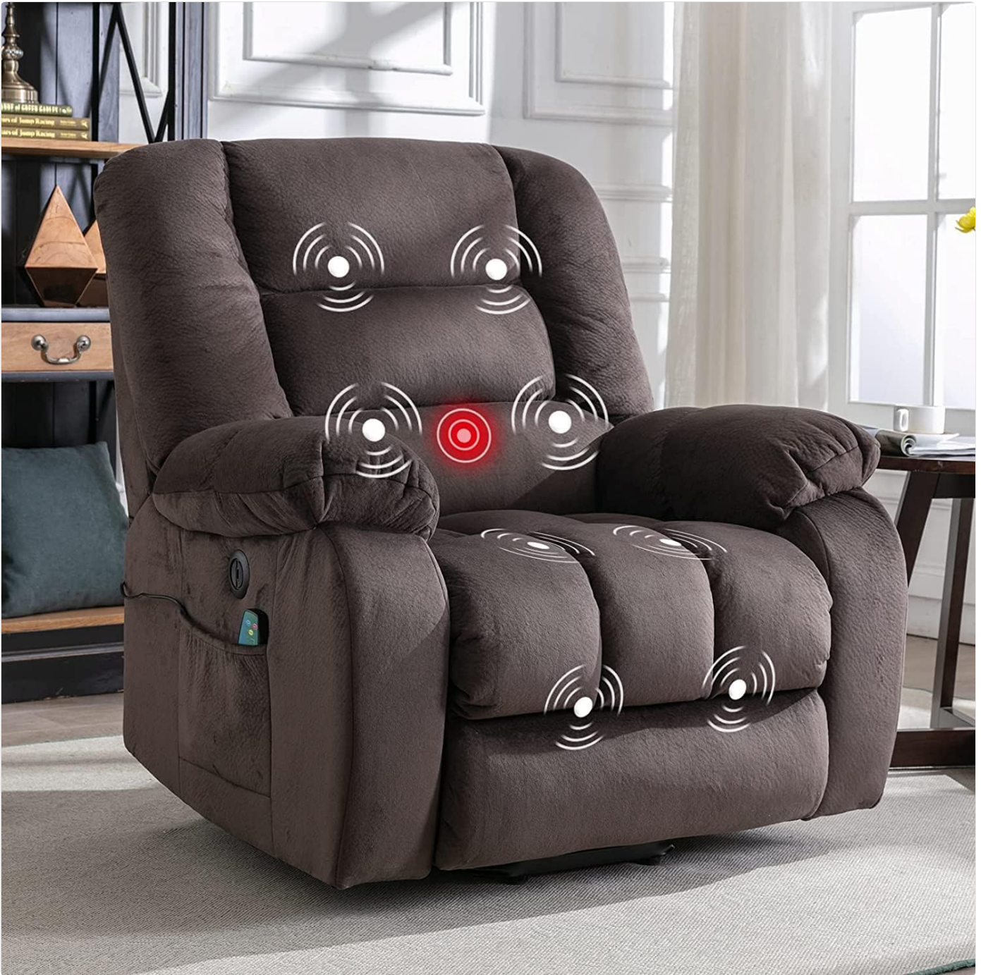
Figure 1: Phoenix Home Power Lift Recliner. This image shows the overall design of the recliner, including the indicated massage zones.