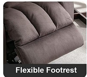
Figure 5: Detail Display. This image provides close-up views of key features including the overstuffed backrest, soft padded cushion, USB charge port, steel frame, and flexible footrest.