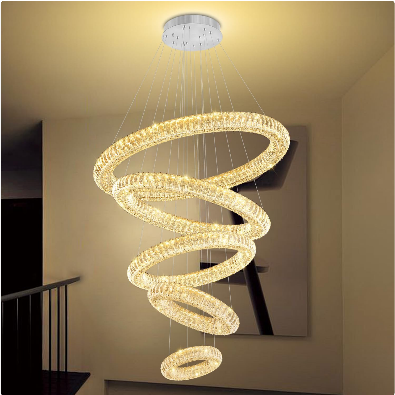
Image: The IDEQUY 5 Ring Chandelier, showcasing its design and illumination.