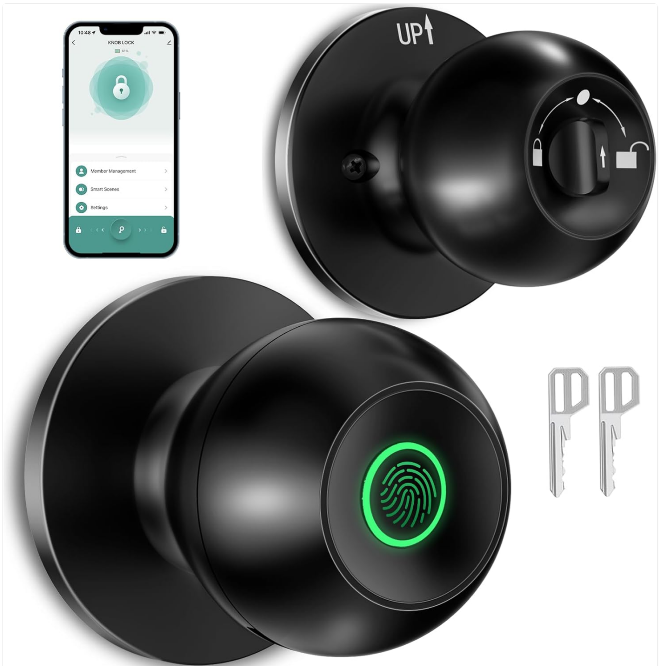
Figure 1: Main components of the HEI LIANG Fingerprint Smart Door Knob.