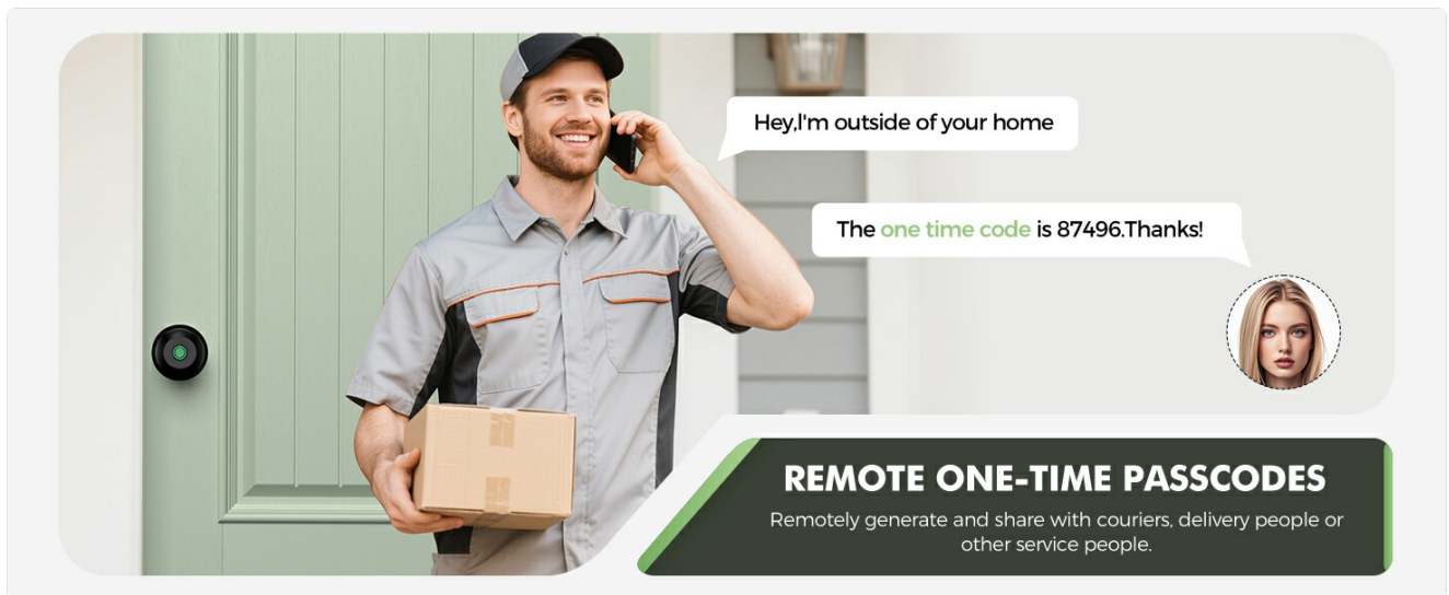
Figure 9: Remote one-time passcodes for convenient access sharing.