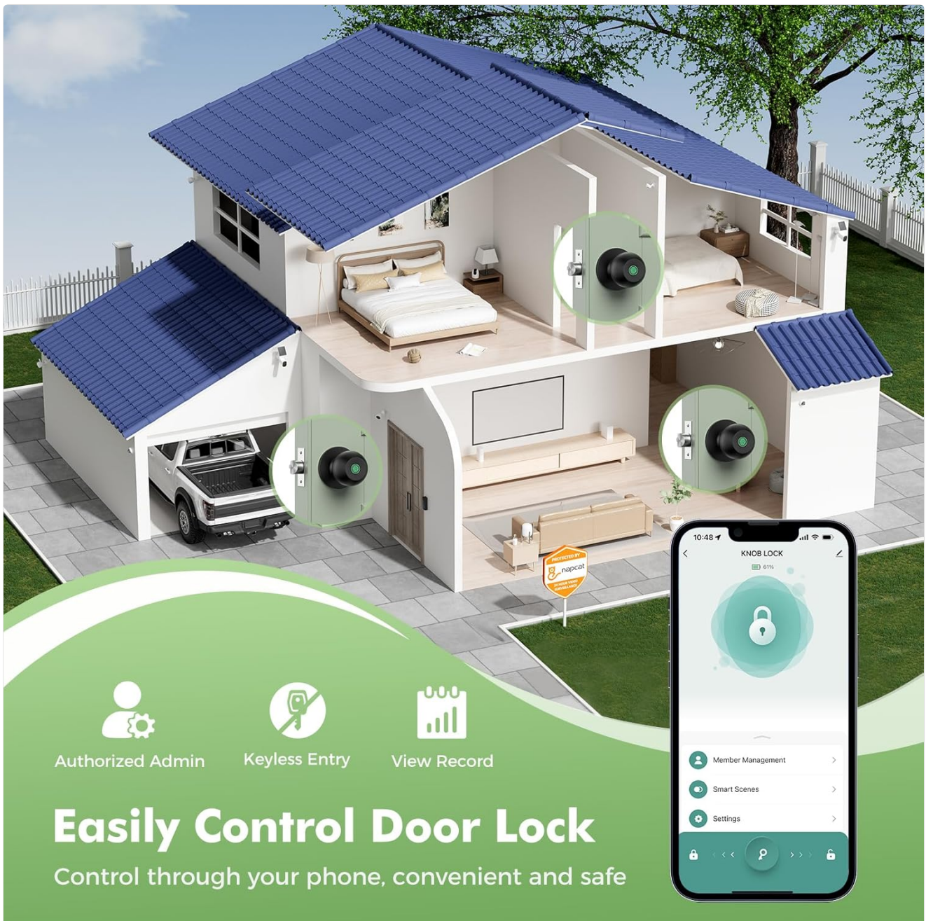
Figure 6: Multiple ways to access the door.