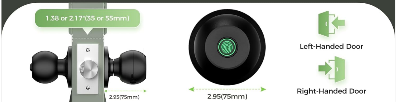
Figure 2: Door measurement guide for compatibility.

Fits on Most Standard Doors, Check Compatibility Before Purchase