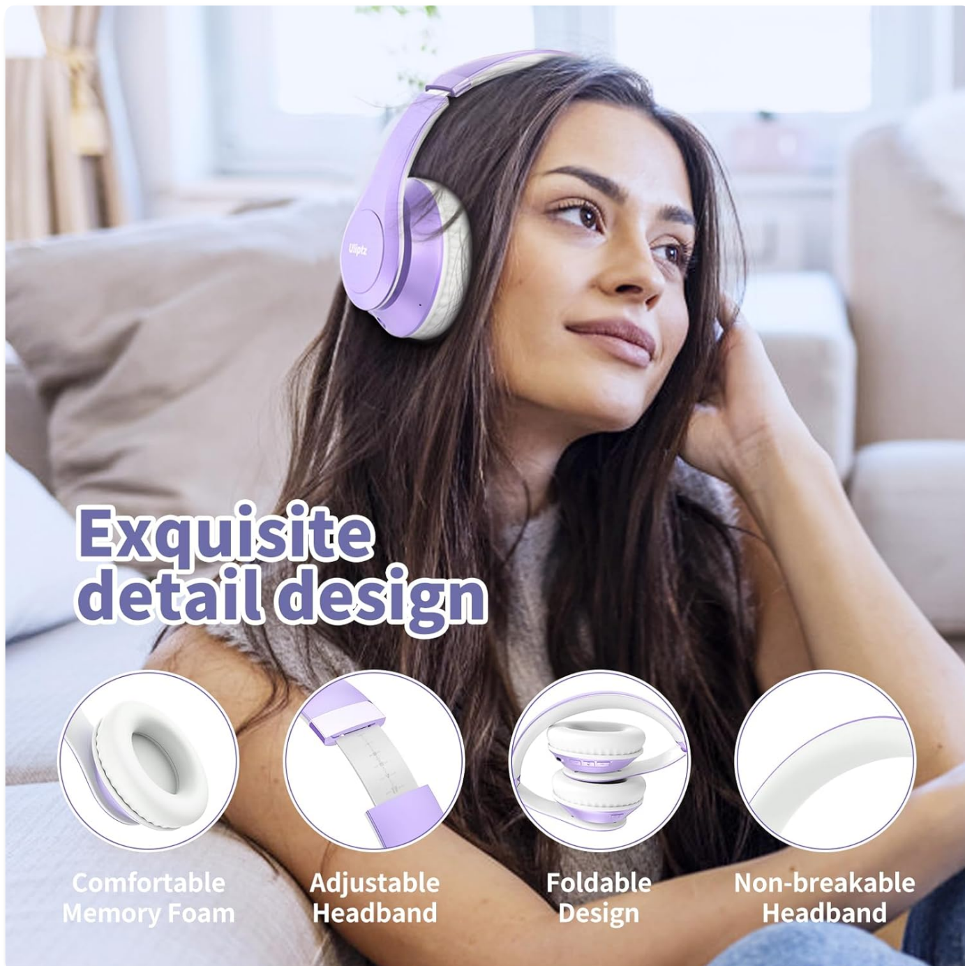
Image: Highlights the ergonomic and durable design features of the headphones.