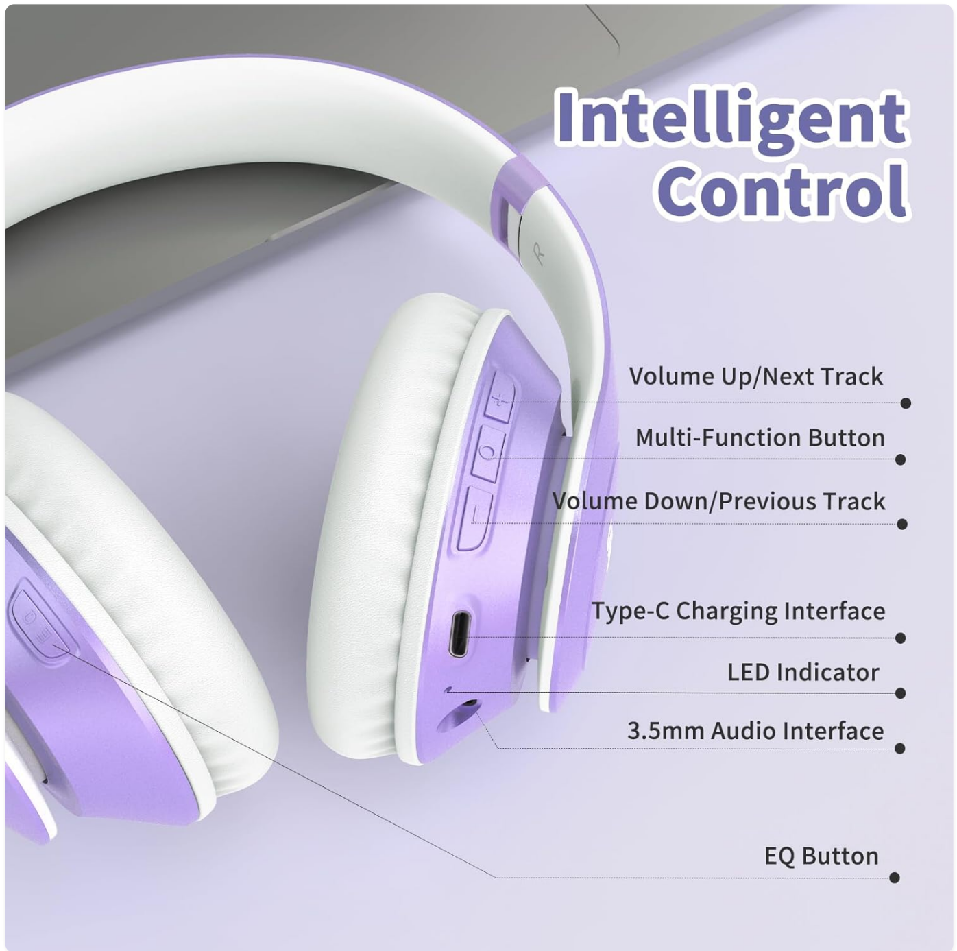
Image: Detailed view of the control buttons on the headphone earcup.

The Uliptz WH203A headphones feature intuitive touch controls located on the earcups.