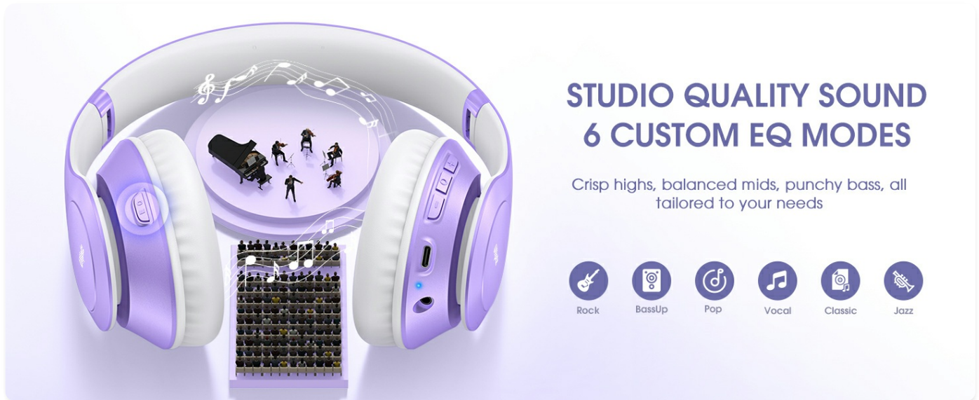
Image: Visual guide to the 6 custom EQ modes available on the headphones.