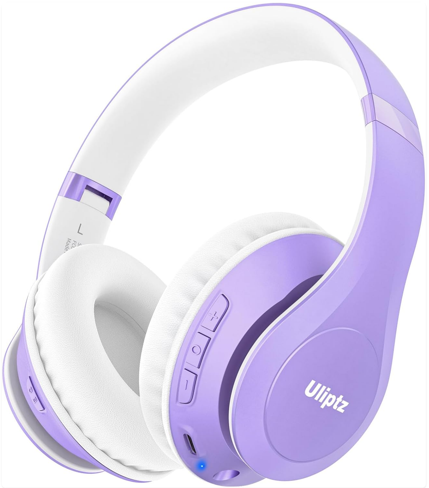
Image: Uliptz Wireless Bluetooth Headphones, showcasing their sleek purple design.