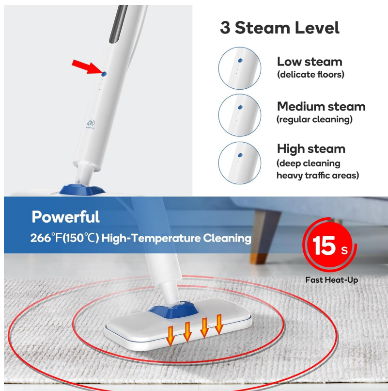
Image: Diagram showing the three steam level options (Low, Medium, High) and their recommended uses.