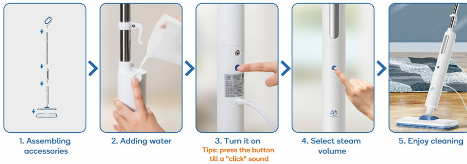
Image: Step-by-step visual guide for assembling the steam mop, adding water, turning it on, selecting steam volume, and beginning cleaning.