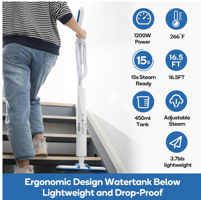
Image: Visual representation of the steam mop's key specifications and ergonomic design.