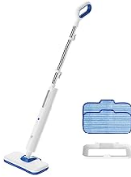
Image: The steam mop with its carpet glider accessory, positioned on a carpet for refreshing.