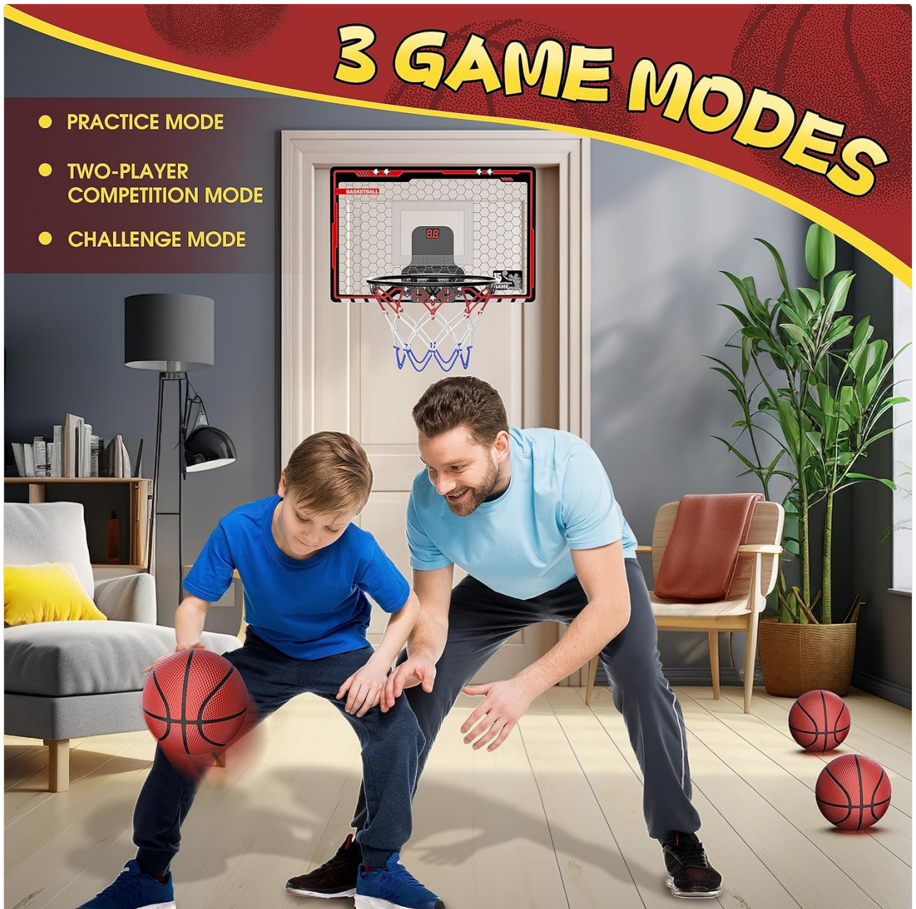
Image: The three available game modes for the basketball hoop.