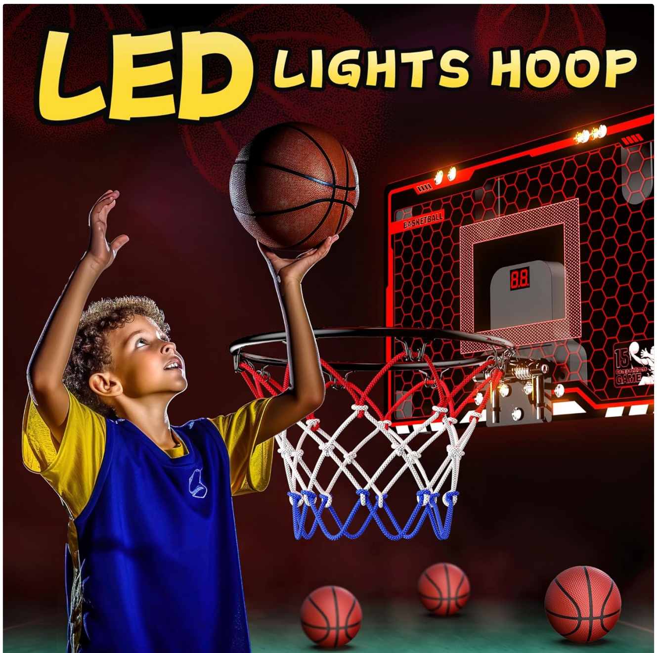
Image: The LED lights on the hoop's backboard.