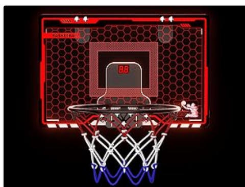
Image: Detailed view of the backboard, rim, net, and various screws for assembly.