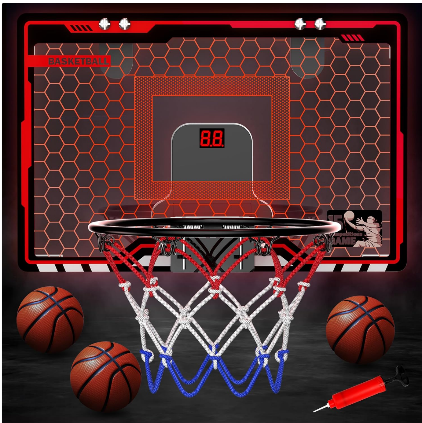
Image: All components included in the HopeRock Indoor Basketball Hoop package.