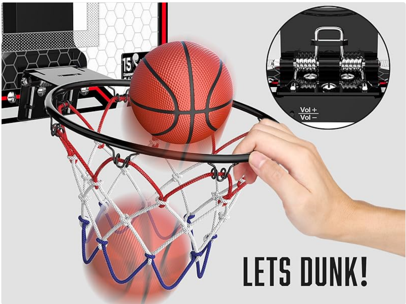
Image: The backboard with mounting hooks installed over a door.