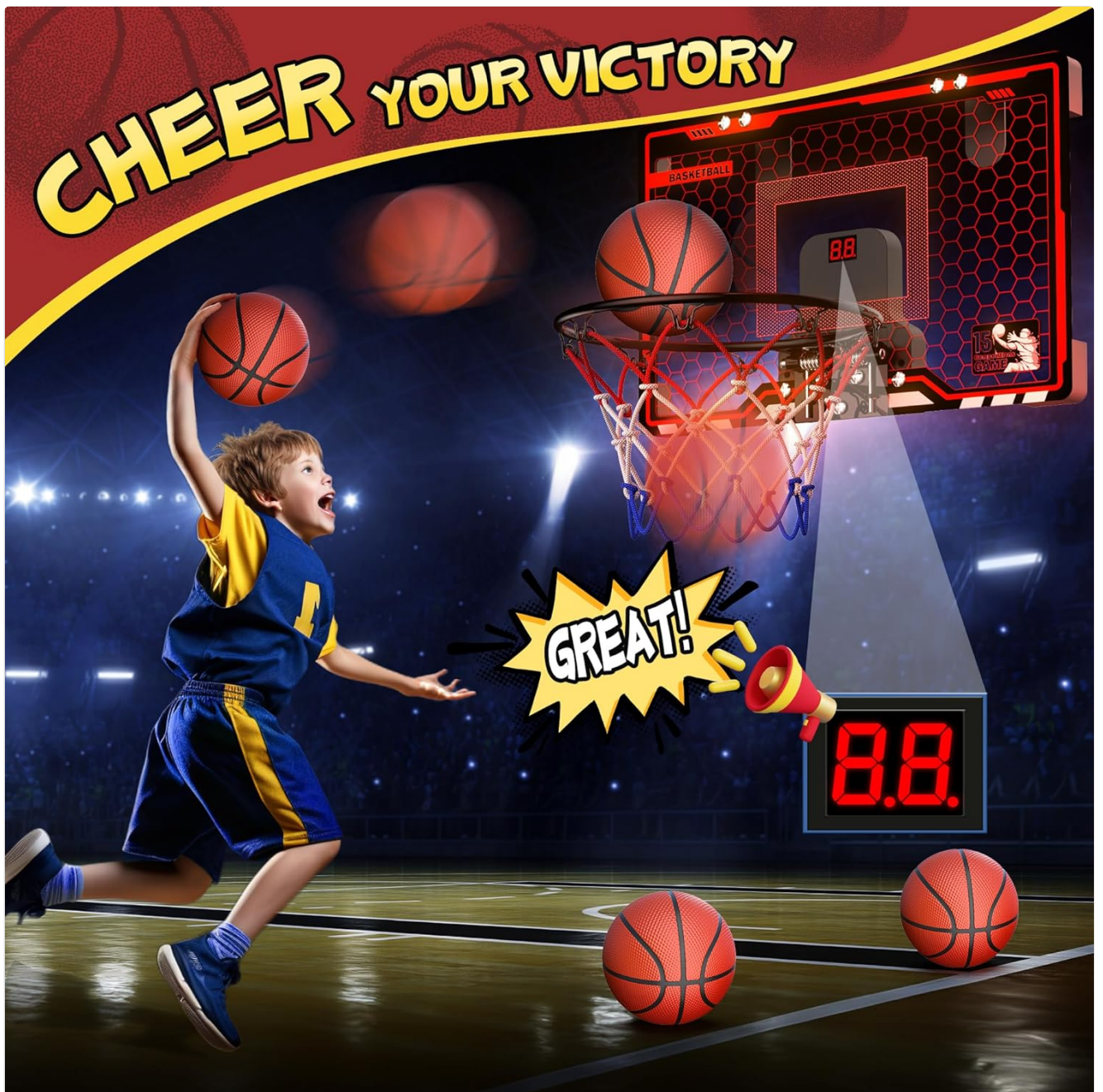
Image: LED lights and automatic scoreboard during play.