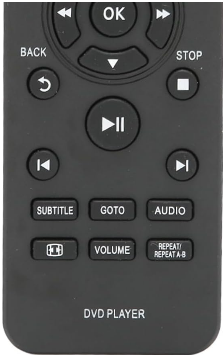
Image: Top-down view of the remote control, showing the layout of all function buttons.