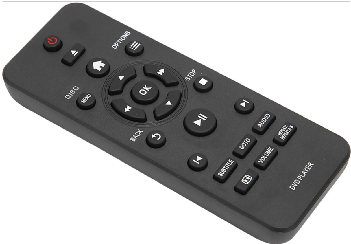
Image: Angled view of the KIMISS Replacement Remote Control, showing its ergonomic design and button layout.

This manual provides comprehensive instructions for the KIMISS Replacement Remote Control, designed for seamless operation with various DVD player models, including RC-5721, DVP3670K, DVP3864K, and DVP3870K. This remote offers a straightforward, no-programming setup for immediate use.