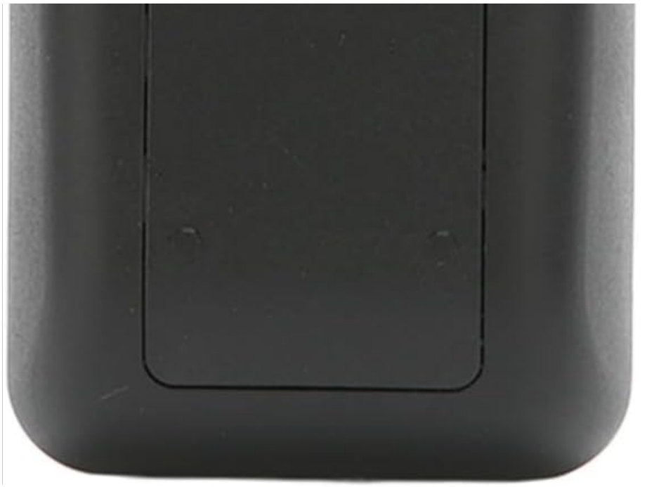
Image: Rear view of the remote control, highlighting the battery compartment for AAA battery installation.