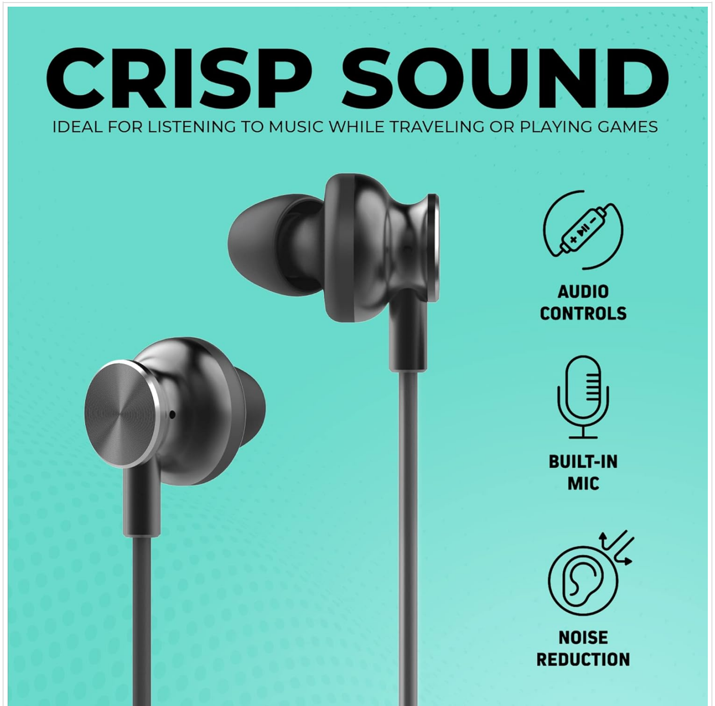
Image: Visual representation of the earbuds highlighting Audio Controls, Built-in Microphone, and Noise Reduction capabilities.