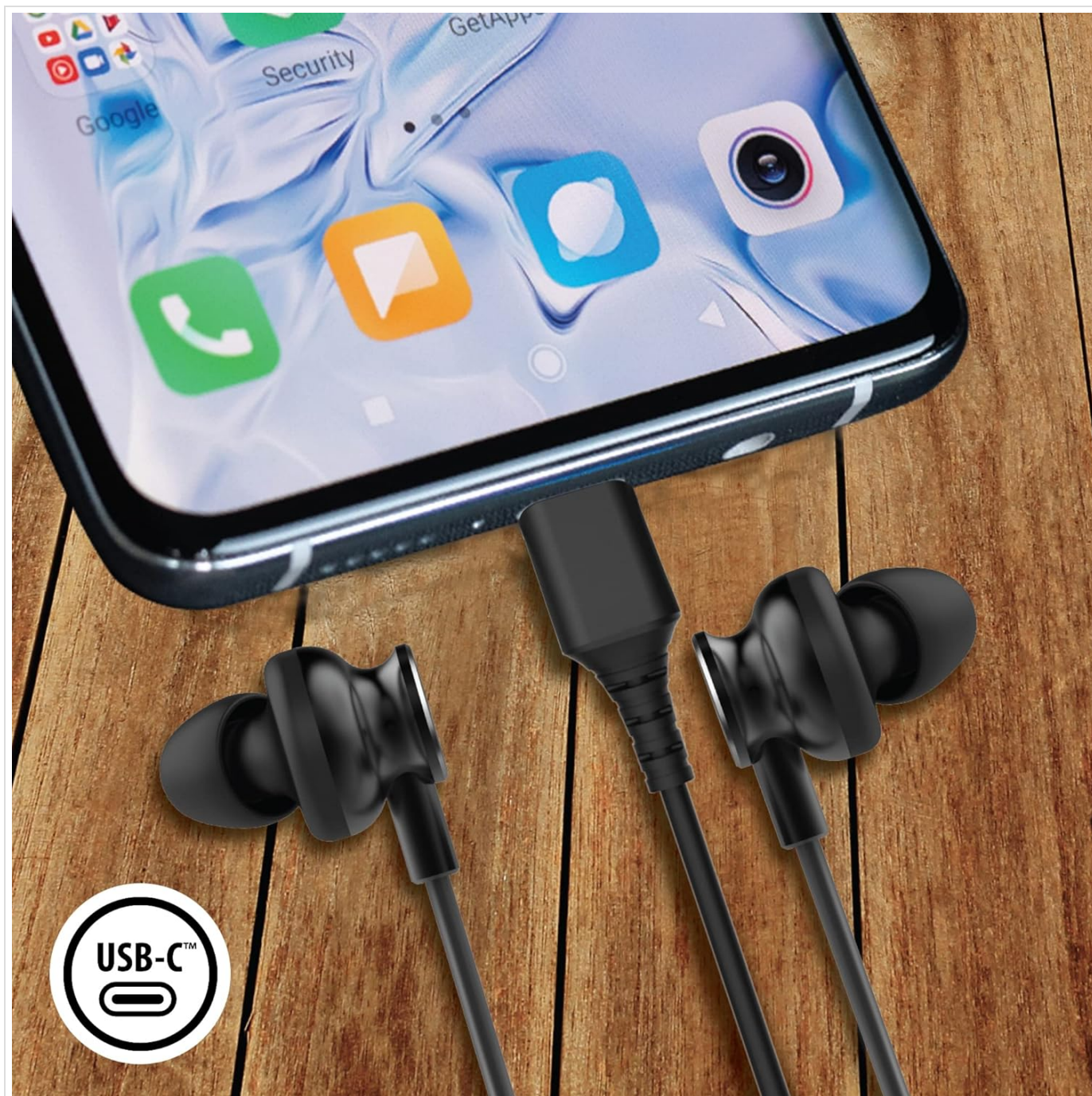
Image: The USB-C connector of the earbuds plugged into the port of a modern smartphone, demonstrating the connection process.