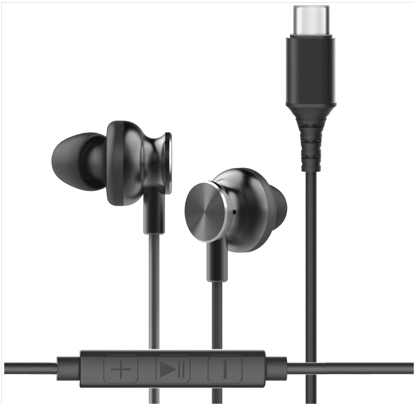
Image: The CHARGEWORX USB-C Wired Earbuds, showcasing the earbuds, the in-line control panel, and the USB-C connector.