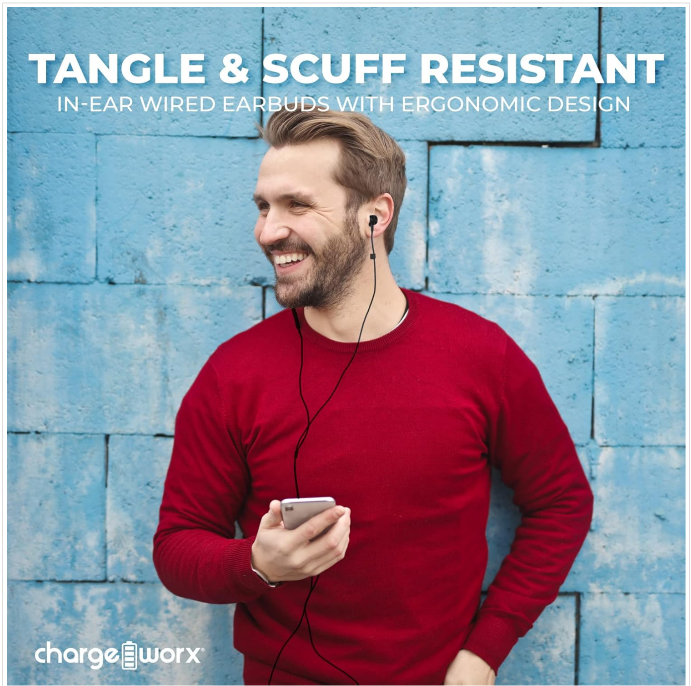
Image: A man wearing the CHARGEWORX earbuds, illustrating their ergonomic design and the tangle & scuff resistant cable for active use.