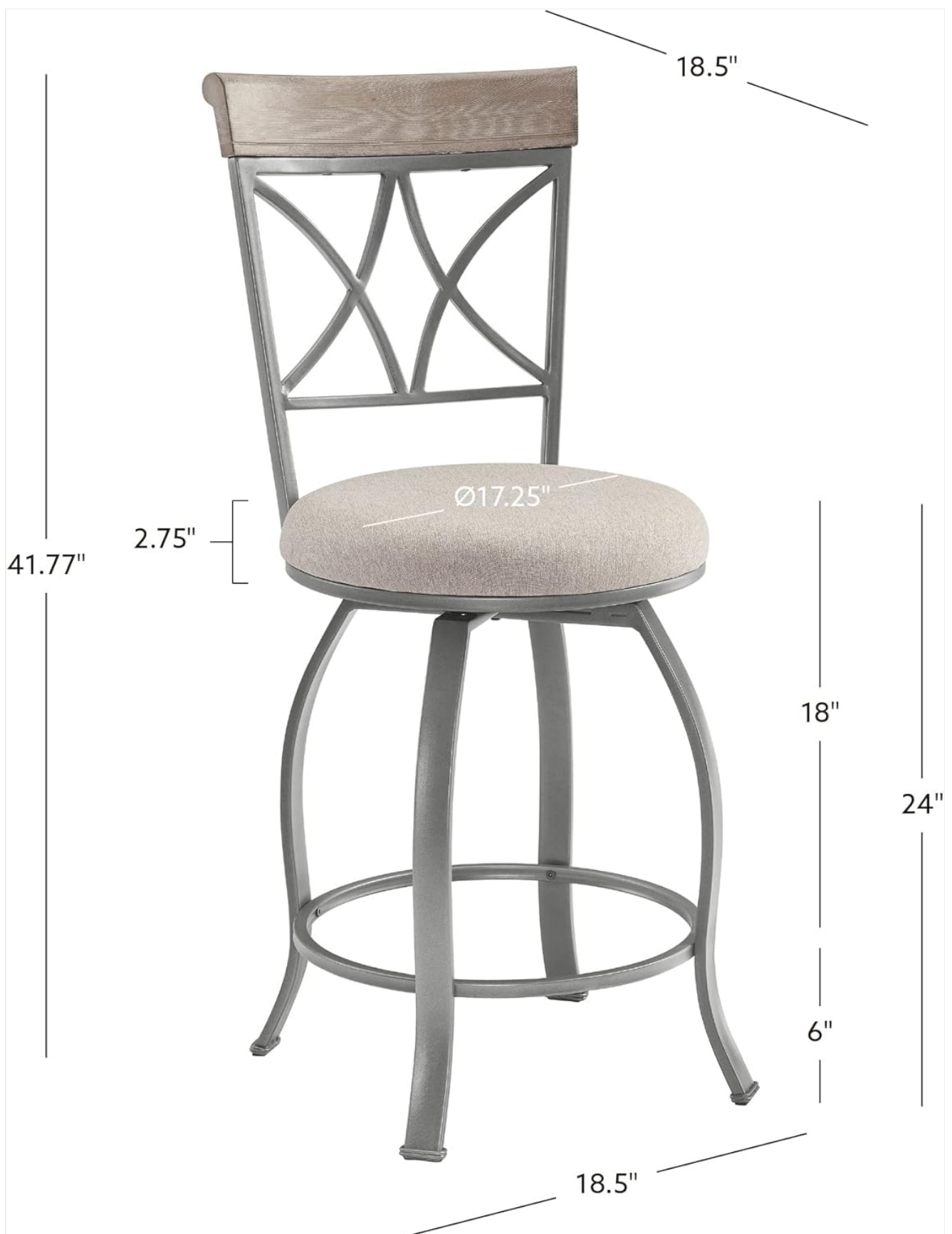
Image: Front view of the stool with key dimensions highlighted, including height and width.

5. Inspect: Verify that the stool is stable and all connections are secure before use.