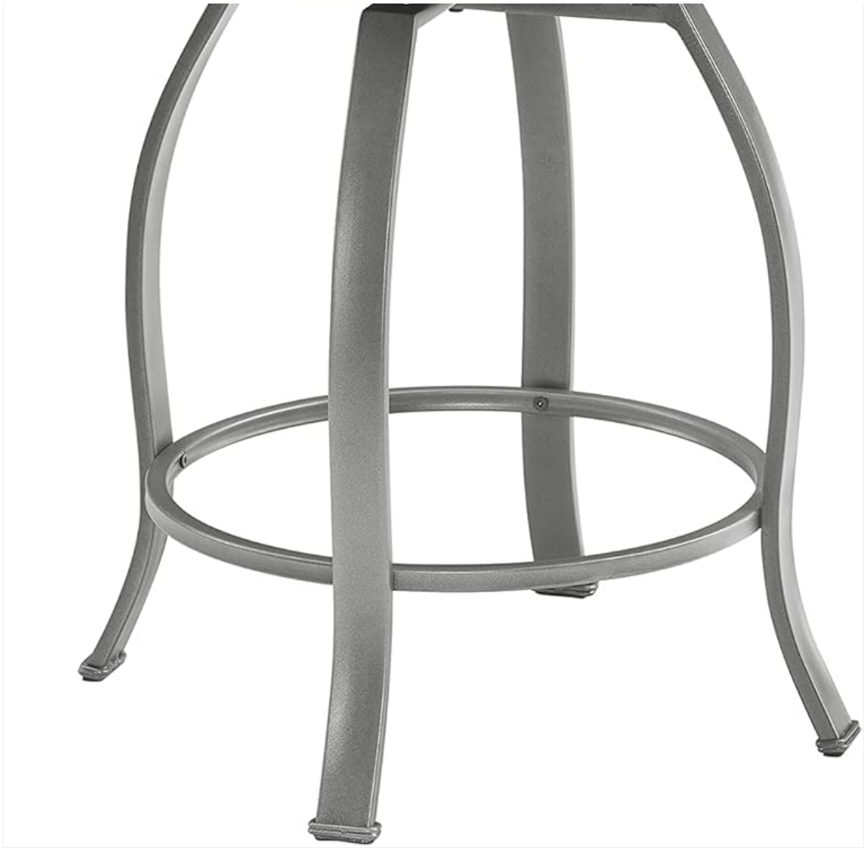
Image: Front view of the Powell Hamilton Pewter Swivel Counter Stool, showcasing its design and upholstery.