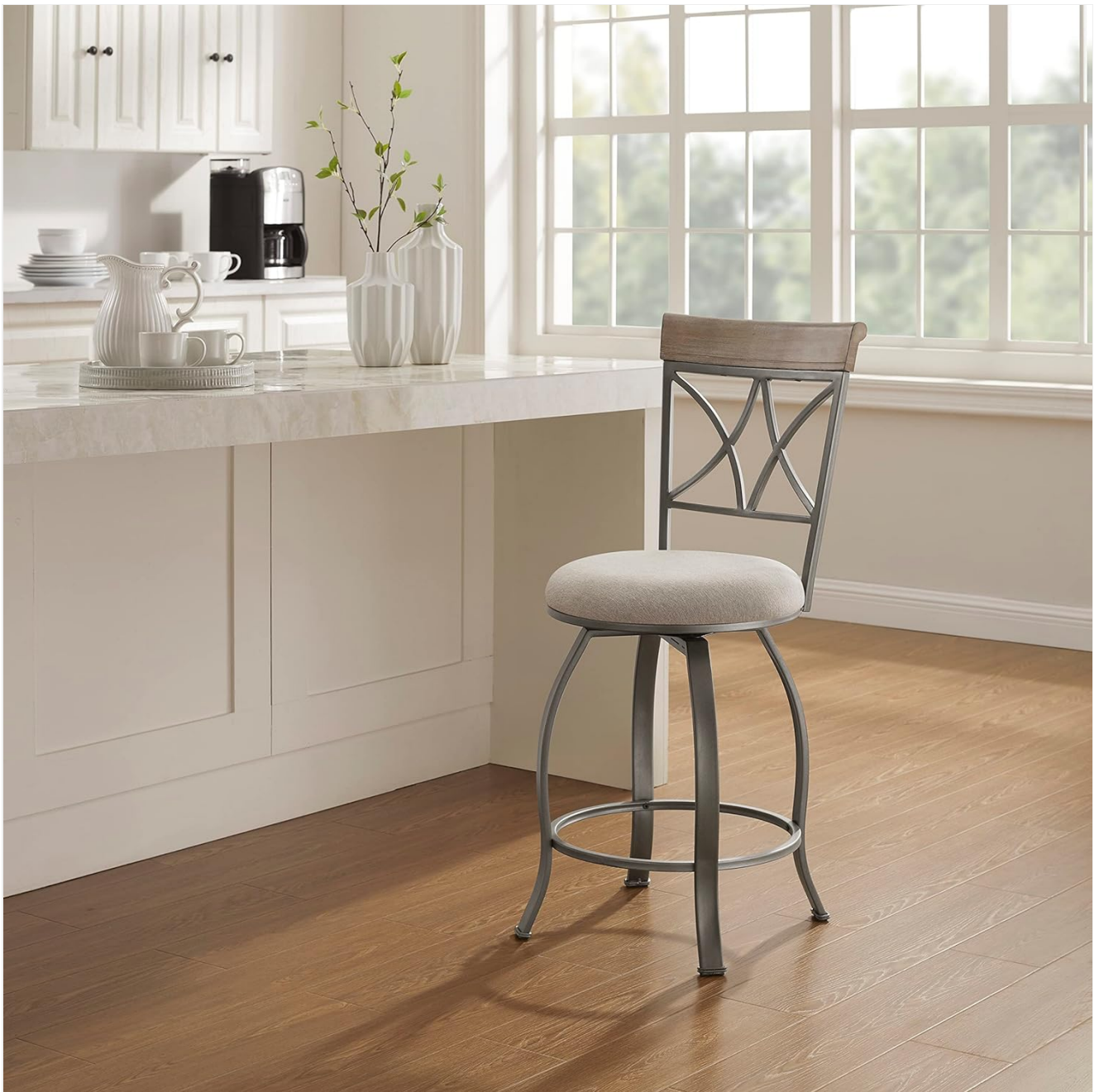
Image: Rear view of the assembled stool, showing the lattice backrest and greywash wood top.