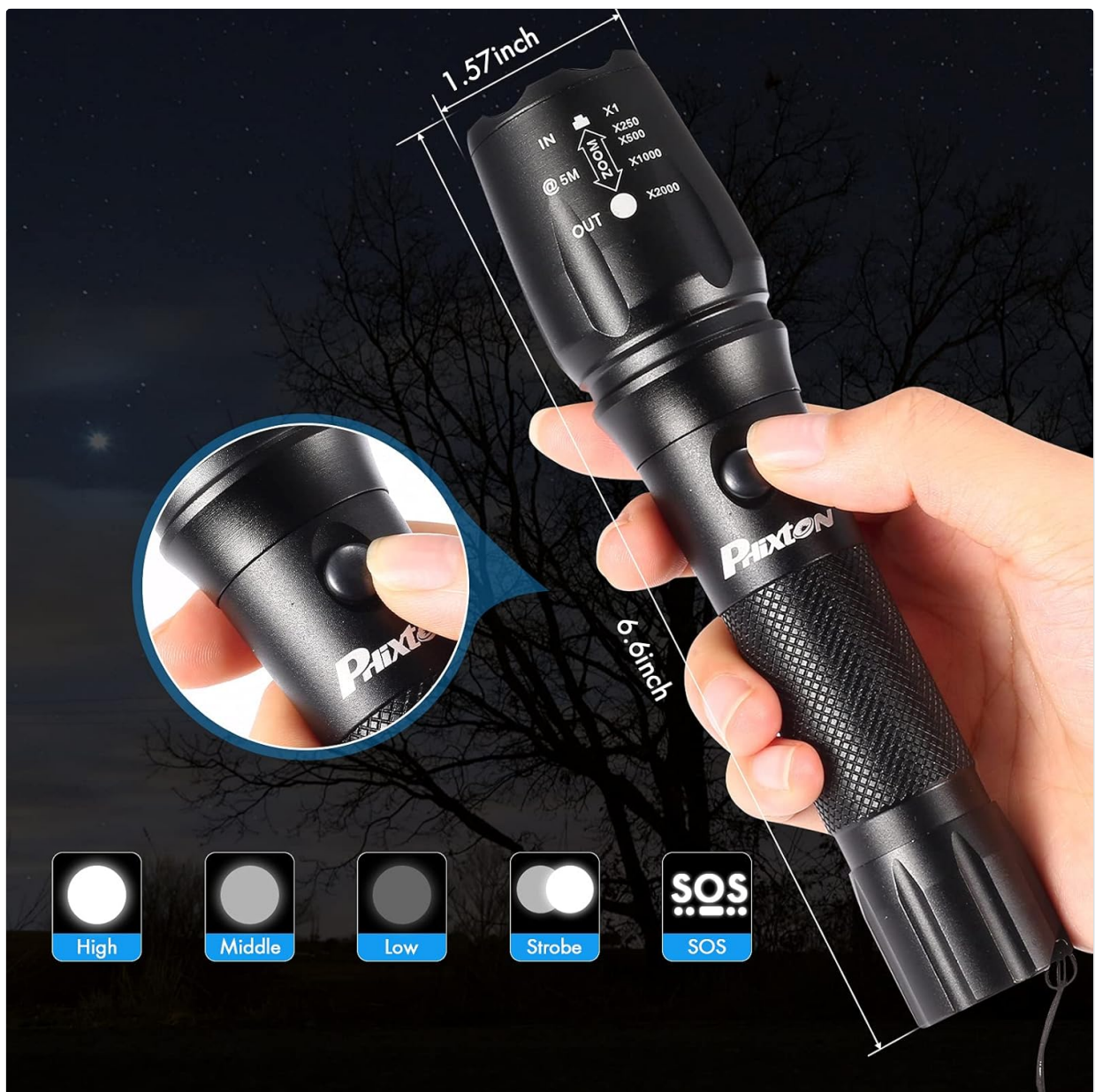
Image: Demonstration of the adjustable focus feature, showing how pushing the head in creates a spotlight for far distances and pulling it out creates a floodlight for near distances.

Your browser does not support the video tag.