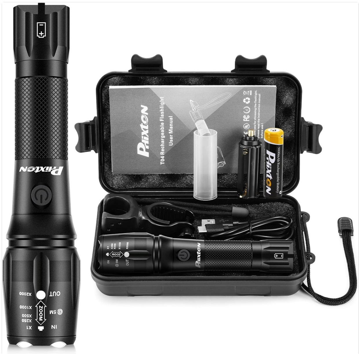
Image: PIXTON Rechargeable Flashlight with all included accessories neatly packed in its hard case.