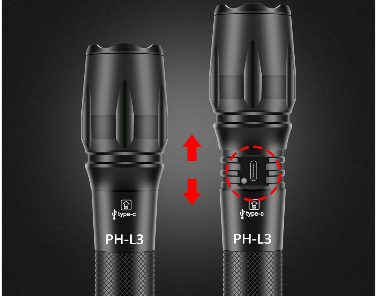
Image: The flashlight head slides forward to expose the hidden USB C charging port.