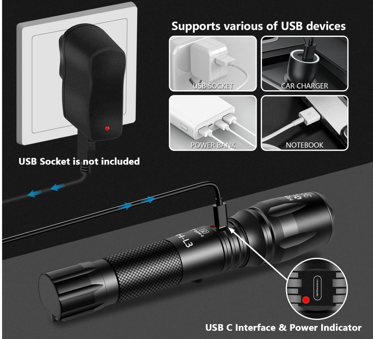
Image: Illustration showing different methods to charge the flashlight using the USB C cable, including wall sockets, car chargers, power banks, and notebooks.

Your browser does not support the video tag.