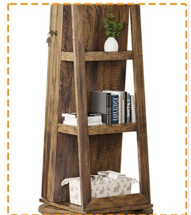
BACK 3-TIER STORAGE SHELF