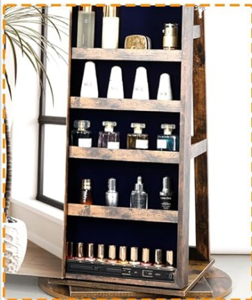
5 STORAGE SHELVES