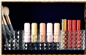
3 ACRYLIC STORAGE BOXES