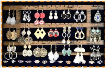
54 EARRING SLOTS