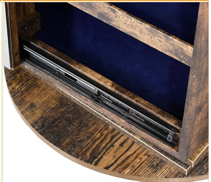
Smooth Slide Track

Image: Close-up images showing the HD silver mirror, the lockable mechanism with two keys, the 360-degree rotation base, and the smooth slide track for the mirror door.