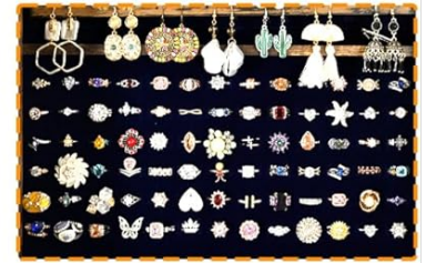
78 RING SLOTS