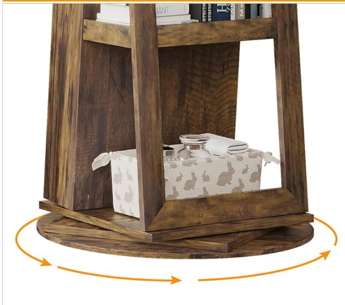
360° Rotation Base