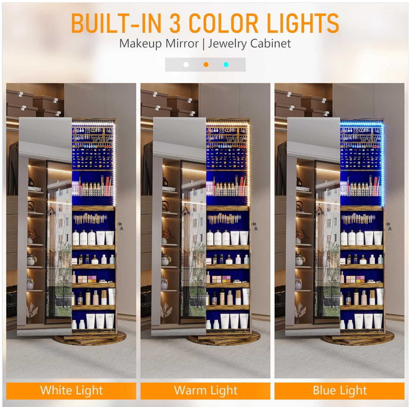
Image: The LVSOMT jewelry mirror cabinet displaying its three LED light color options: white, warm, and blue, illuminating the interior storage.

The internal jewelry cabinet features built-in LED lights with three color shades: blue light, white light, and warm light. Locate the button inside the cabinet to cycle through the light colors and turn the lights on or off. Ensure batteries are installed for the lights to function.