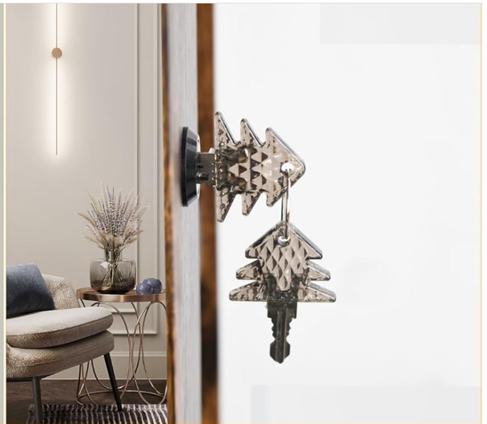
Lockable with 2 Keys