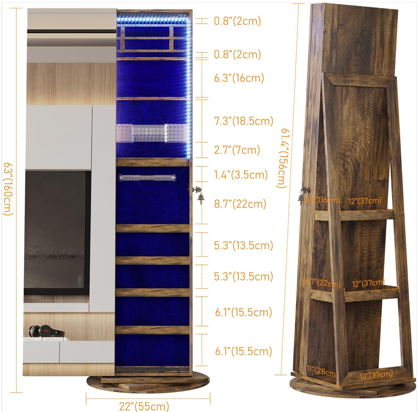
Image: Diagram showing the detailed dimensions of the LVSOMT 360 degree swivel jewelry mirror cabinet, including height, width, and depth measurements for both the cabinet and its internal compartments.