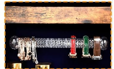
ACRYLIC HANGING RODS