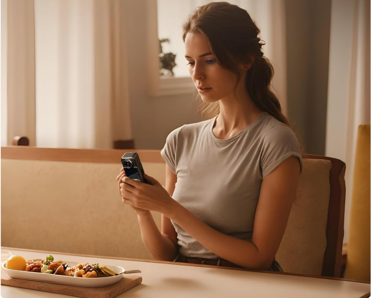
Figure 5: Long Battery Life with Modular Attachments

Enhanced Brightness, Say Farewell to Dim Shots!