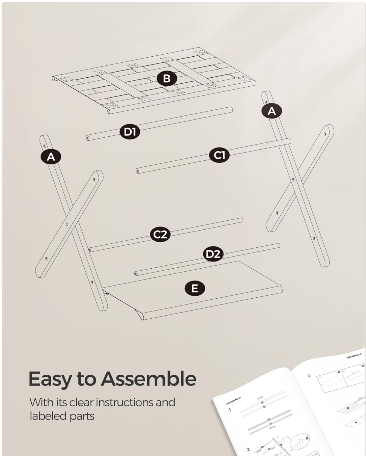
Image: An exploded diagram showing all individual parts (A, B, C1, C2, D1, D2, E) of the luggage rack and how they connect for assembly.