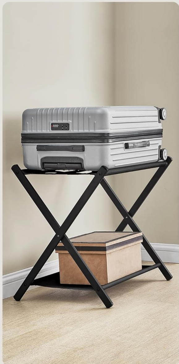
Image: A visual comparison of the luggage rack in its folded, space-saving configuration and its fully assembled, ready-to-use state with a suitcase.