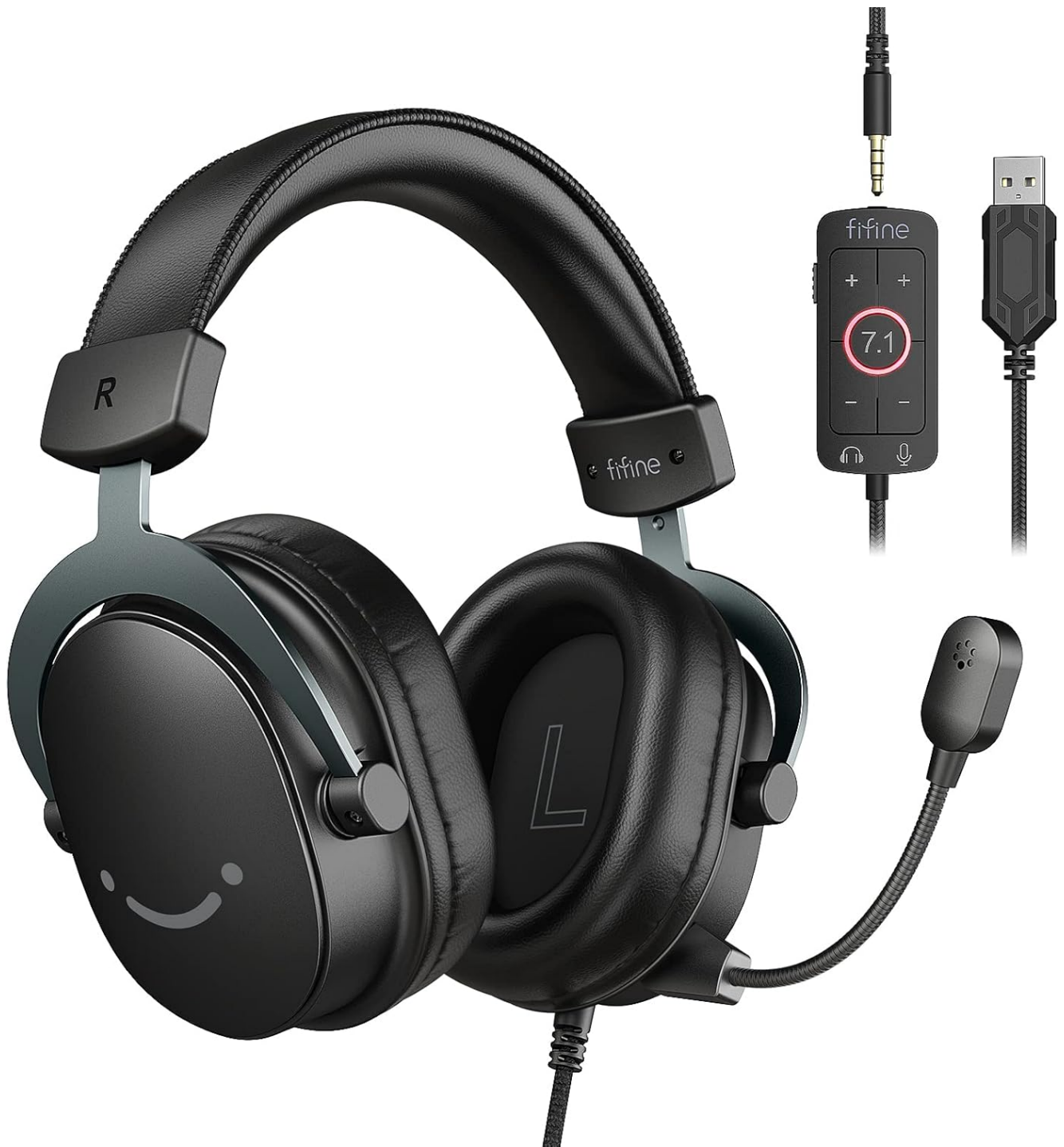
The FIFINE AmpliGame H9 Gaming Headset, showcasing its main components: the headset, detachable microphone, and USB control box.