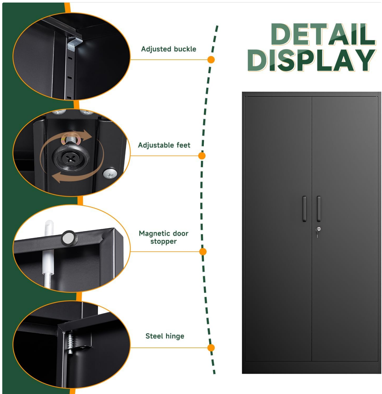
Figure 3.1: Close-up views of key components including the adjusted buckle for stability, adjustable feet for leveling, magnetic door stopper for secure closure, and durable steel hinges.

Assembly typically takes around 30 minutes. For detailed visual guidance, refer to the video assembly instructions mentioned in your product packaging. (Note: Specific video URLs were not provided in the product data. Please refer to the QR code or link in your physical manual for video instructions.)