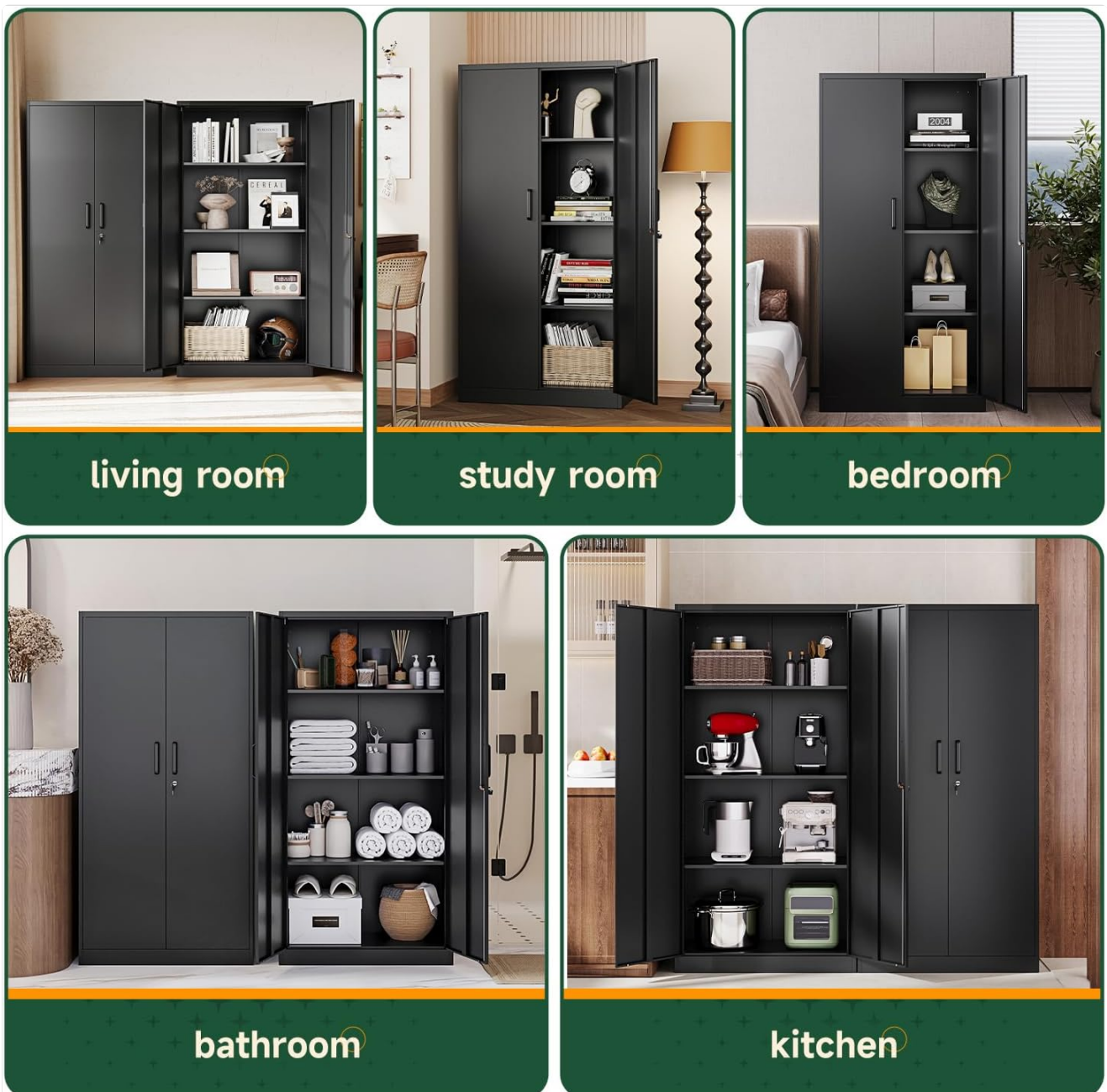
Figure 4.1: Examples of the cabinet's versatile use across different rooms, demonstrating its adaptability for various storage needs.

To secure your items, use the integrated lock. Insert one of the two provided keys into the lock and turn to engage or disengage the locking mechanism. Always ensure the doors are fully closed before locking.