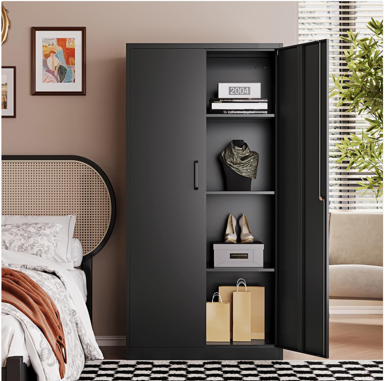
Figure 2.1: The Letaya Metal Black Storage Cabinet, showcasing its sleek design and ample storage capacity in a bedroom environment.