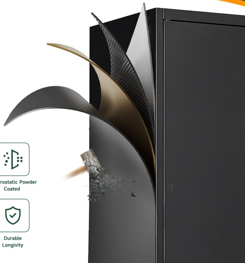
Figure 2.2: Illustration of the cabinet's construction, highlighting its heavy gauge cold-rolled steel, water-proof/rust-proof properties, high capacity, electrostatic powder coating, ease of installation, and durable longevity.