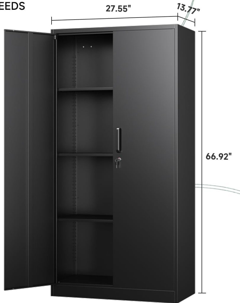
Figure 7.1: Detailed product dimensions (13.77"D x 27.55"W x 66.92"H) and total load capacity (480 lbs).