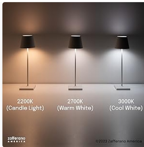
Image: Poldina Pro Lamp placed on its contact induction charging base.

The indicator light on the top of the lamp will glow red during charging. Once fully charged, the light will turn green. A complete charge typically takes 6-7 hours and provides at least 12 hours of illumination, depending on brightness settings.