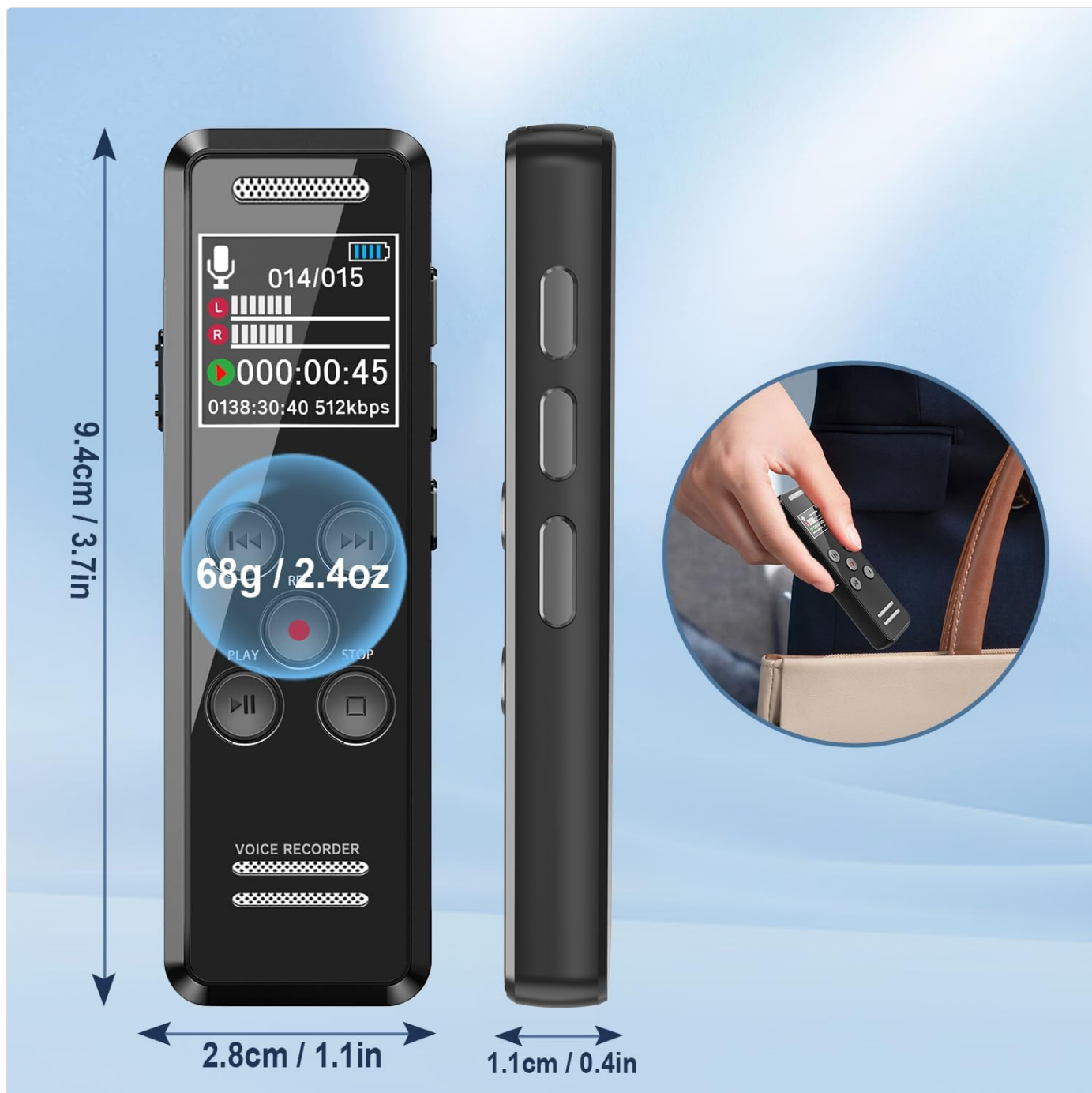
Image: Physical dimensions and weight of the recorder.