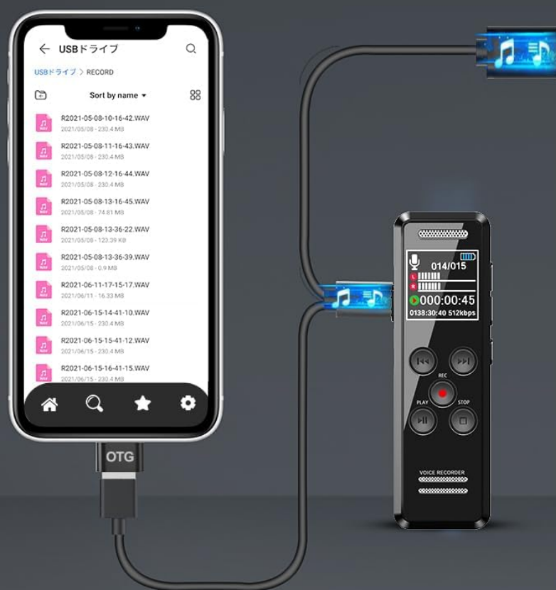
Image: Connecting the recorder for charging and data transfer.