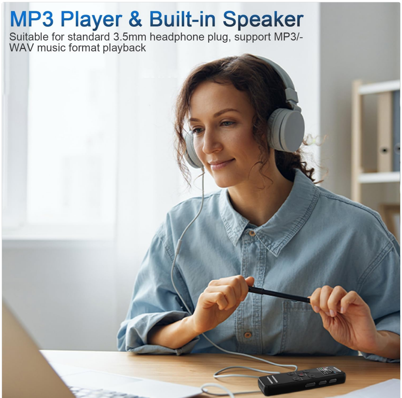
Image: Using the recorder as an MP3 player with headphones.

The device can also function as an MP3 player. Transfer MP3 or WAV music files to the recorder's memory. Connect headphones to the 3.5mm jack for private listening or use the built-in speaker.