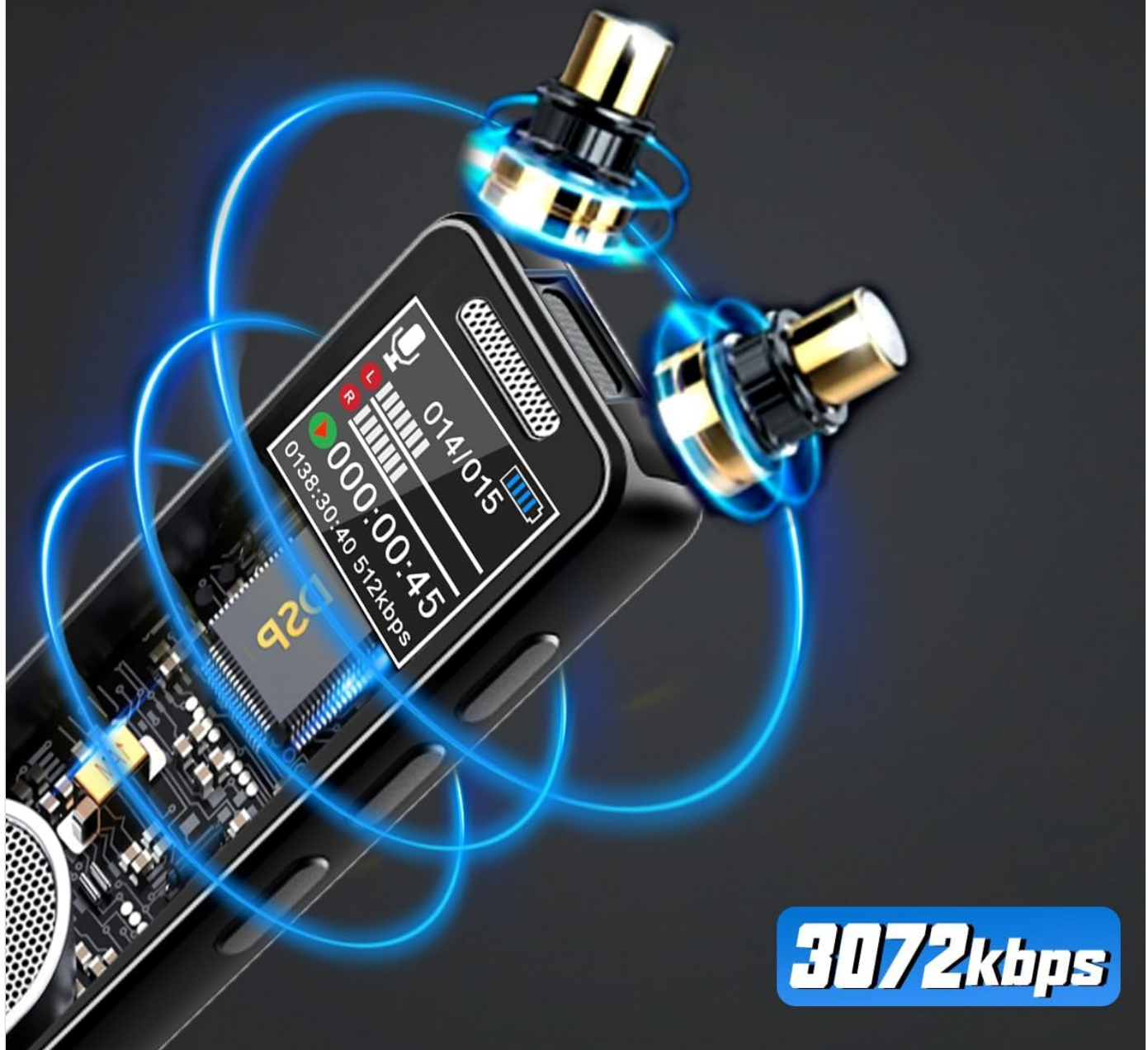
Image: The directional microphone and 3072kbps recording quality.

With 360° of 2 high-performance directional microphones and noise-canceling UPC, compact body, high-quality recording