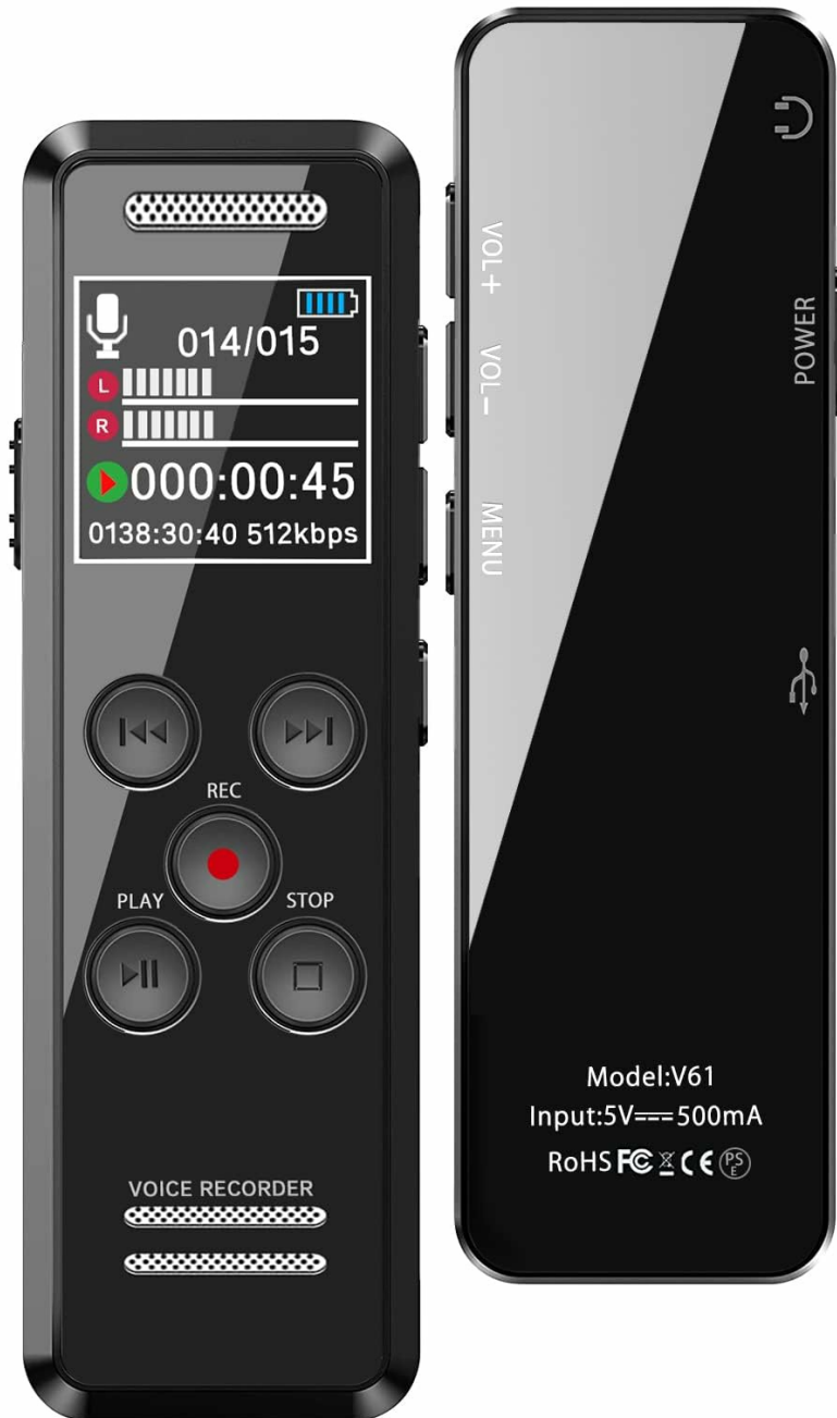
Image: The QZT Digital Voice Recorder V61-2 showcasing its main features and compact design.