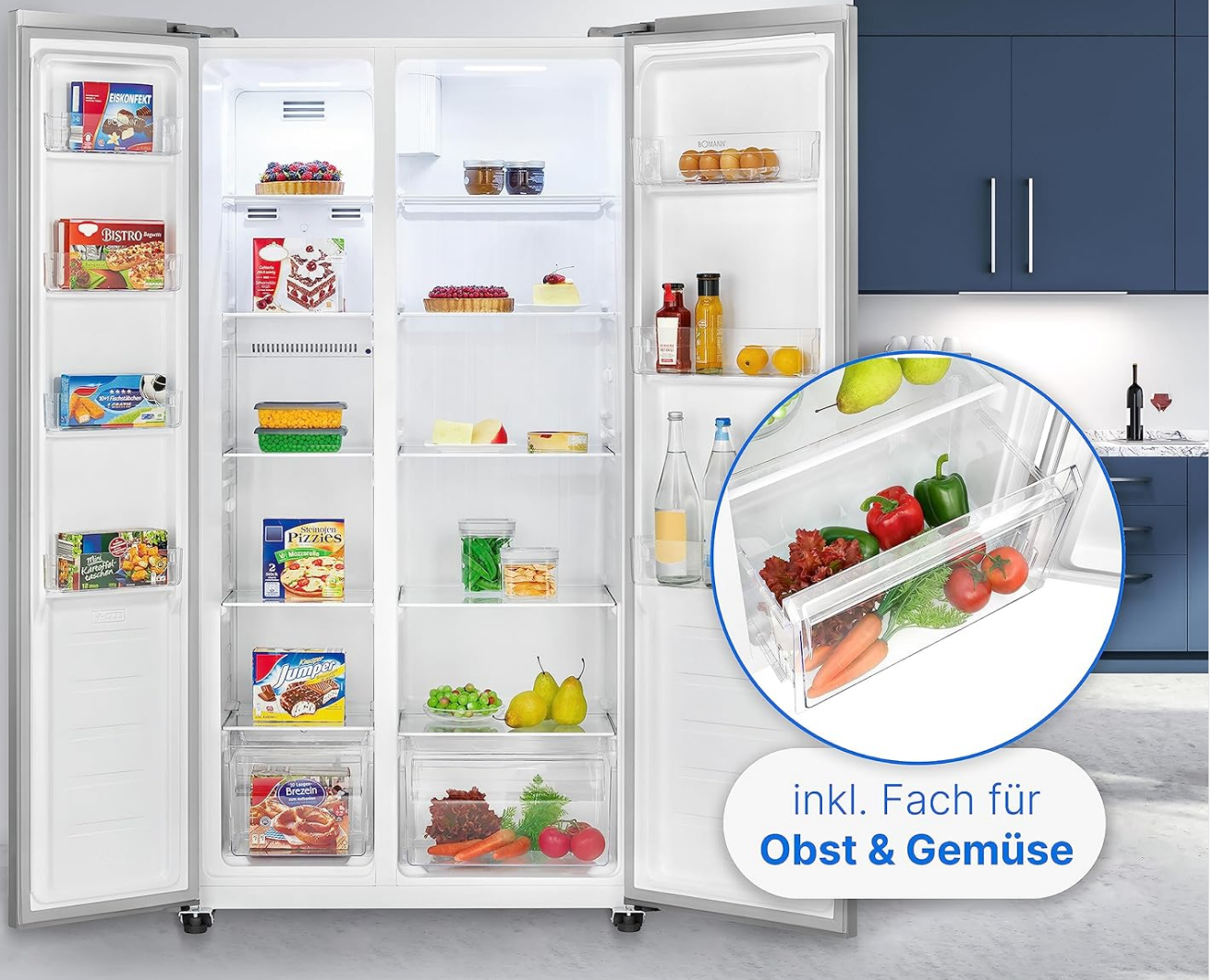
Figure 3.4.1: The spacious interior of the Bomann SBS 7344, showing various compartments, glass shelves, and a dedicated drawer for fruits and vegetables, providing ample storage for groceries.

442 Liter: 291 L Kühlen & 151 L Gefrieren