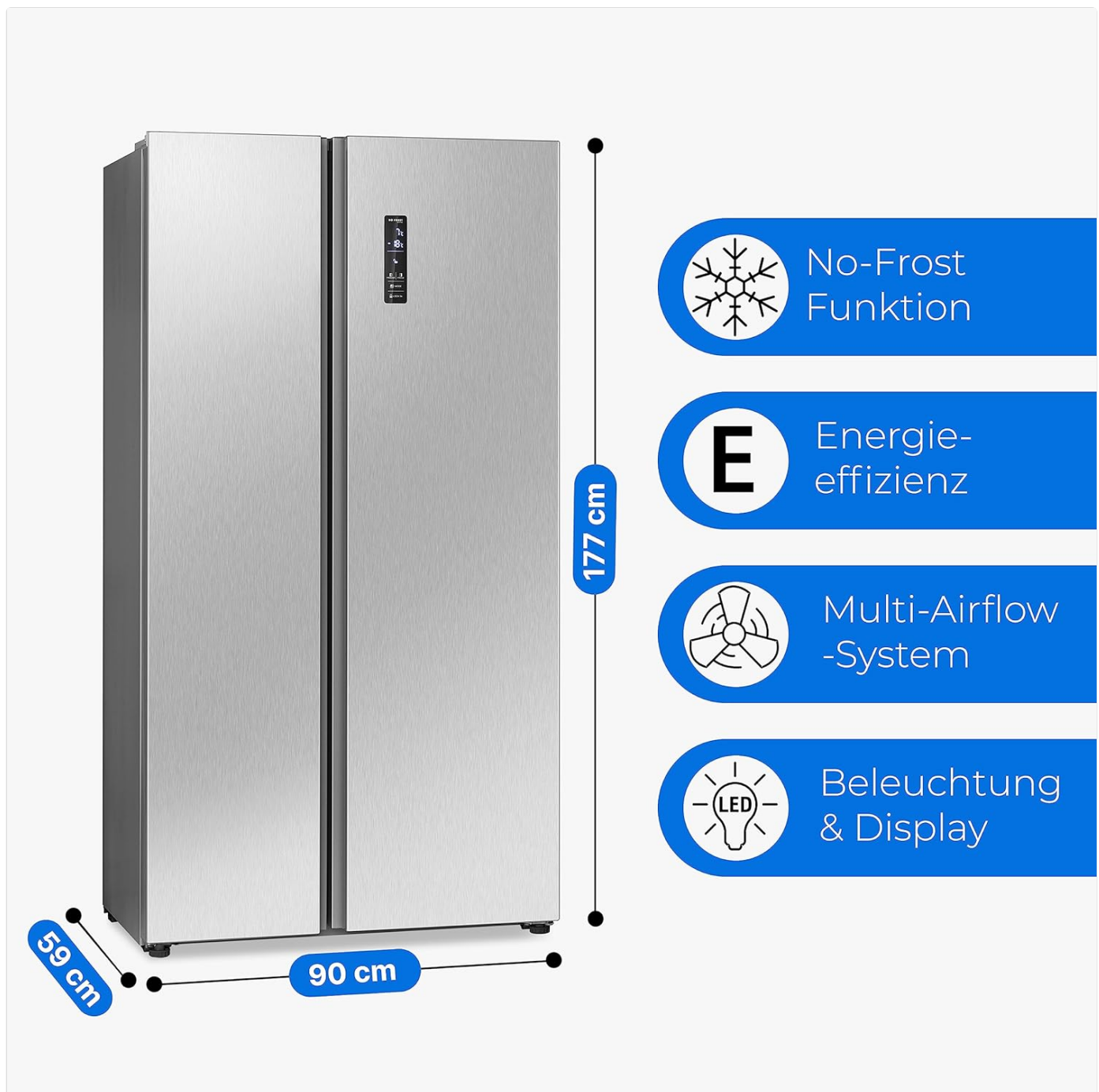
Figure 2.2.1: Appliance dimensions and key features. The refrigerator measures 90 cm in width, 59 cm in depth, and 177 cm in height. Key features include No-Frost function, Energy Efficiency Class E, Multi-Airflow System, and LED lighting & display.

The appliance is designed for ambient temperatures between 10°C and 43°C (Climate Class SN-T).