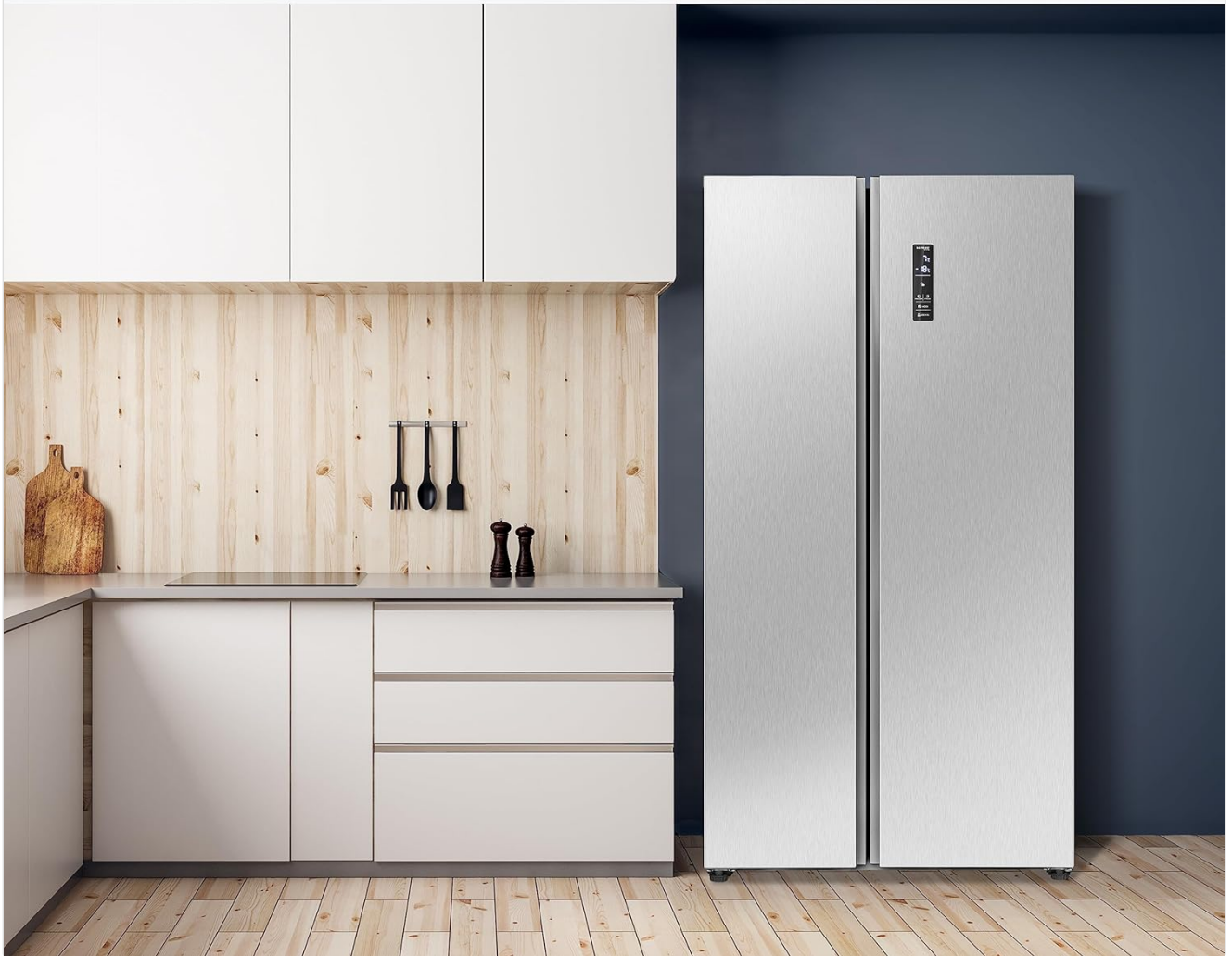
Figure 3.3.2: The Bomann SBS 7344 refrigerator in a modern kitchen, emphasizing its quick cooling and freezing capabilities, which are faster than conventional freezers.