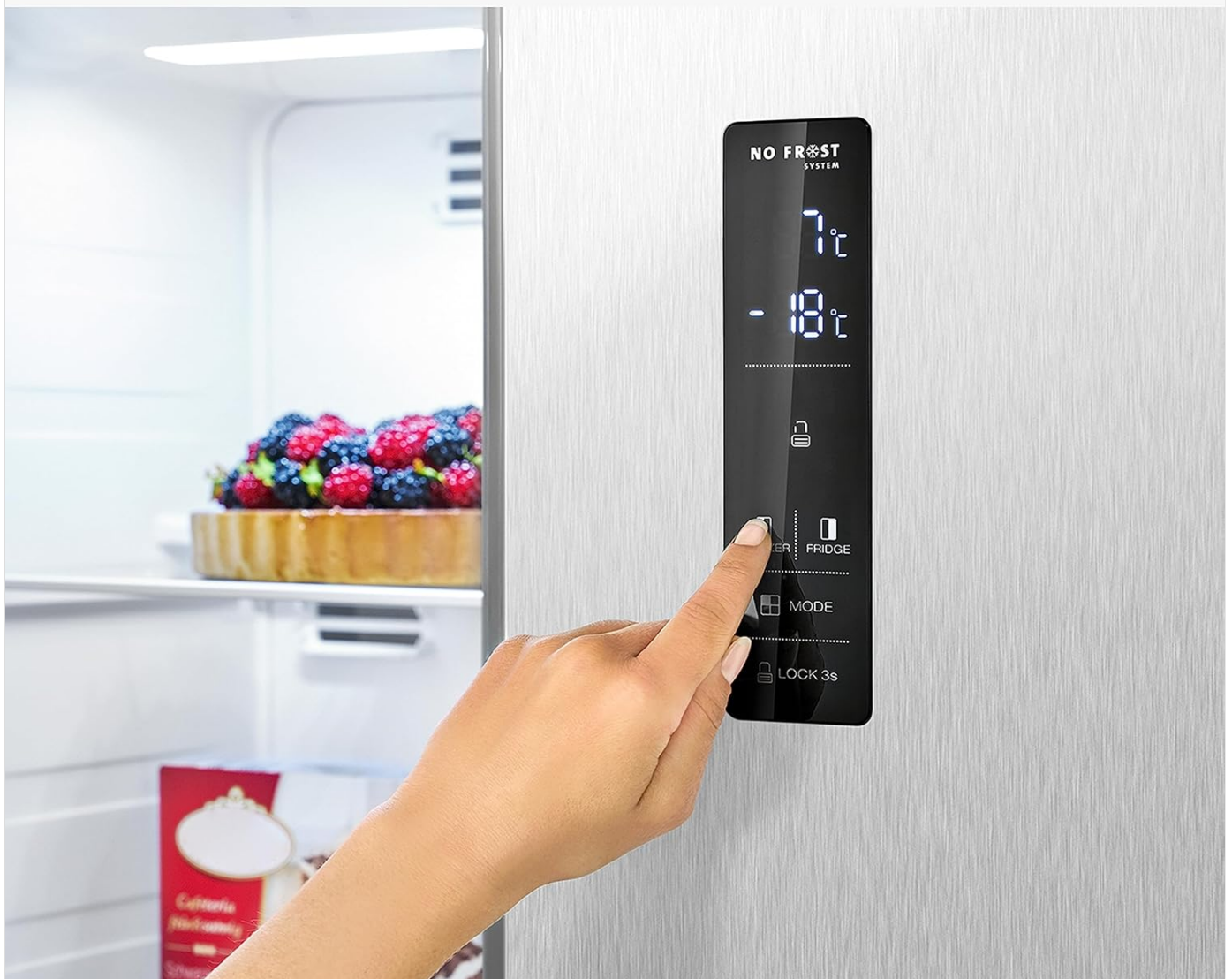
Figure 3.1.1: Close-up of the LED display and touch control panel. Users can adjust settings by touching the icons, and the display shows current temperatures for both compartments.