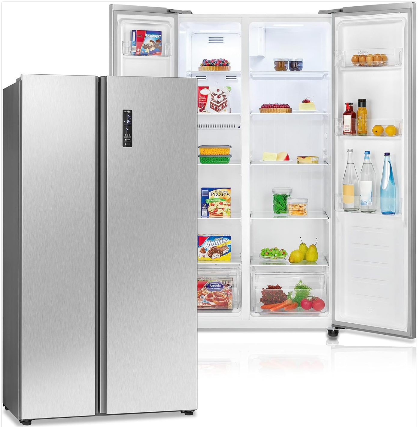
Figure 3.4.2: The Bomann SBS 7344 refrigerator with both doors open, providing a clear view of its extensive storage capacity and organized interior layout.