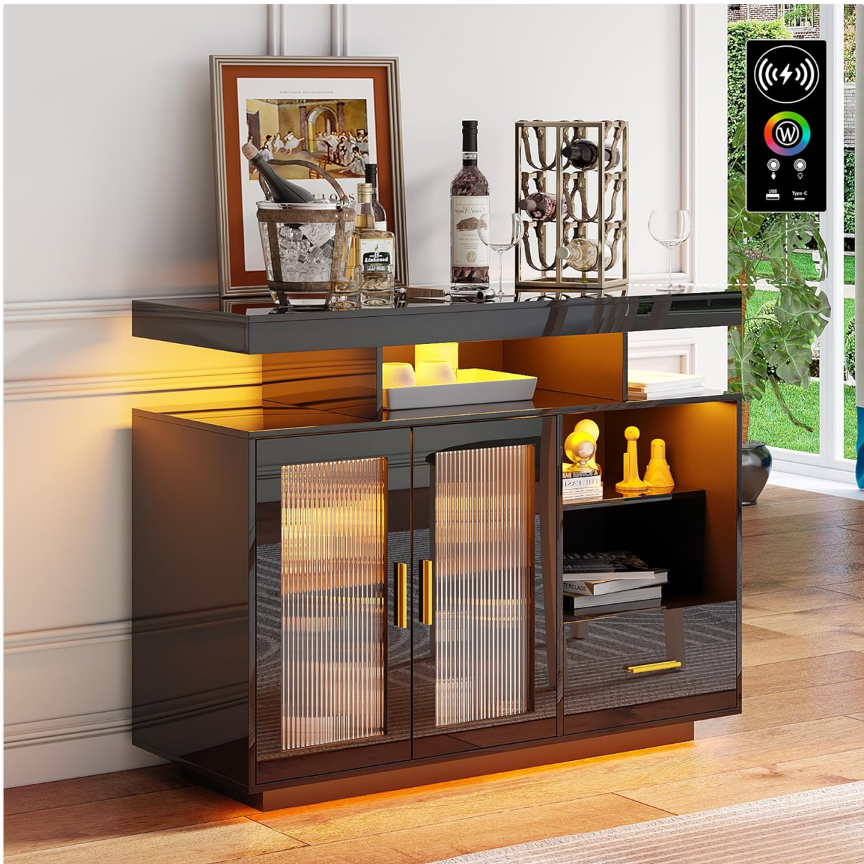
Image: The sideboard's spacious table top, three open compartments, open shelf, two-door storage cabinet, and sliding drawer for diversified storage.