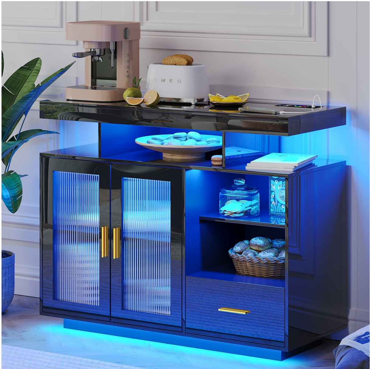
Image: Overall dimensions of the sideboard: 39.4"L x 15.7"W x 31.5"H. The package is delivered in 1 box and weighs 65 lbs.

included parts list in your package. If any parts are missing or damaged, please contact customer support.