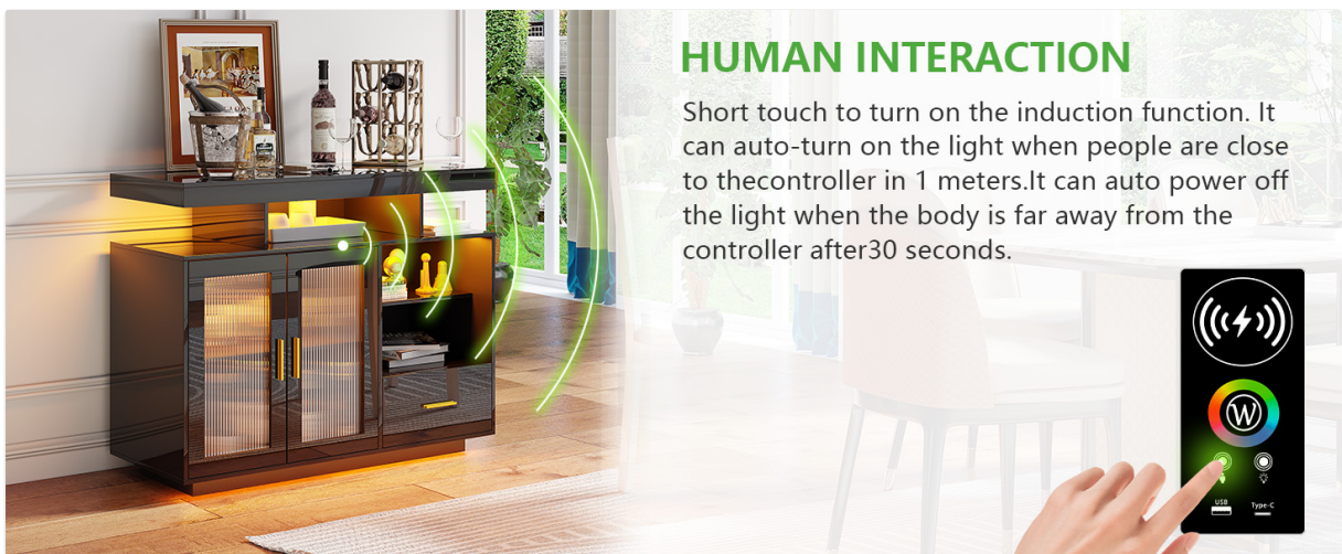
Image: Front view of the WOOVIVS LED Sideboard Buffet, showcasing its modern design and high-gloss black finish.