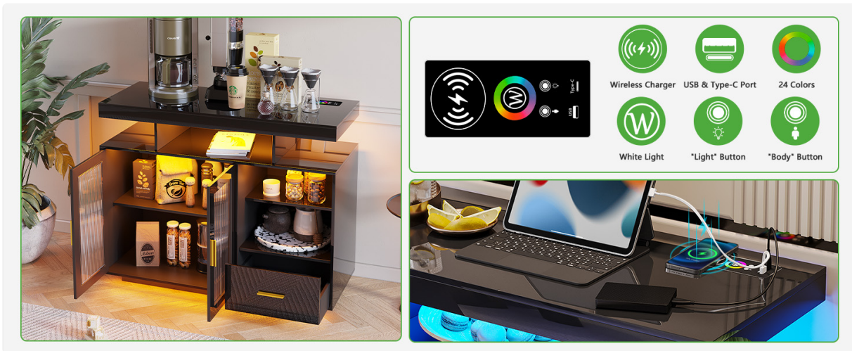
Image: The sideboard illuminated with different LED colors, demonstrating the adjustable lighting feature.