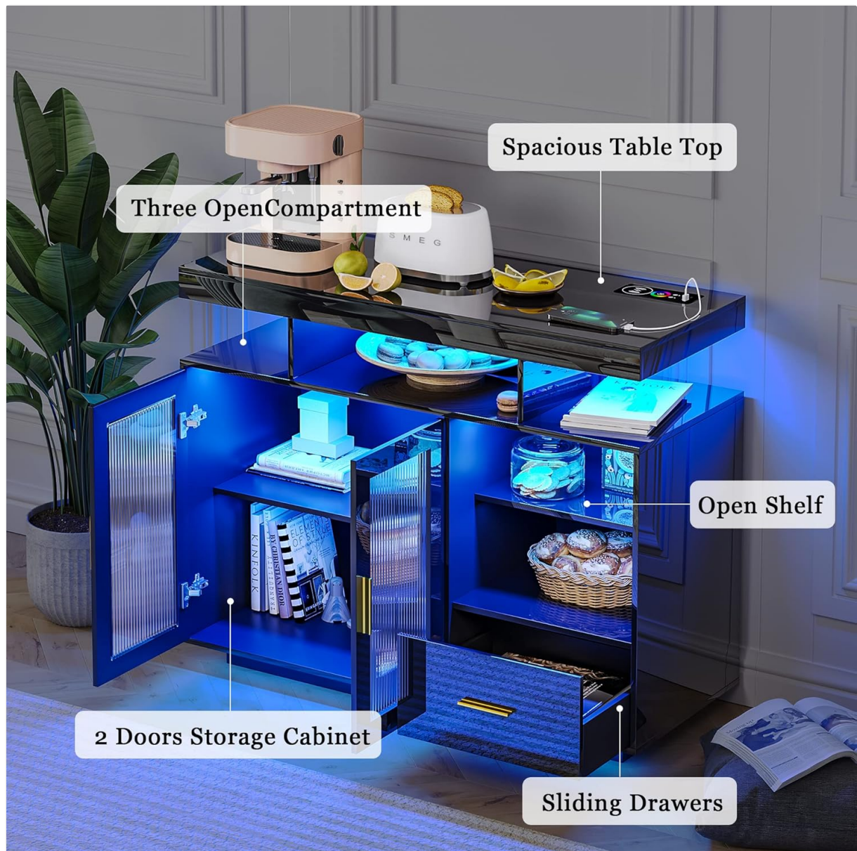
Image: The intelligent control panel features wireless charging, USB & Type-C ports, a 24-color selection circle, a white light button, a light button, and a body (motion sensor) button.