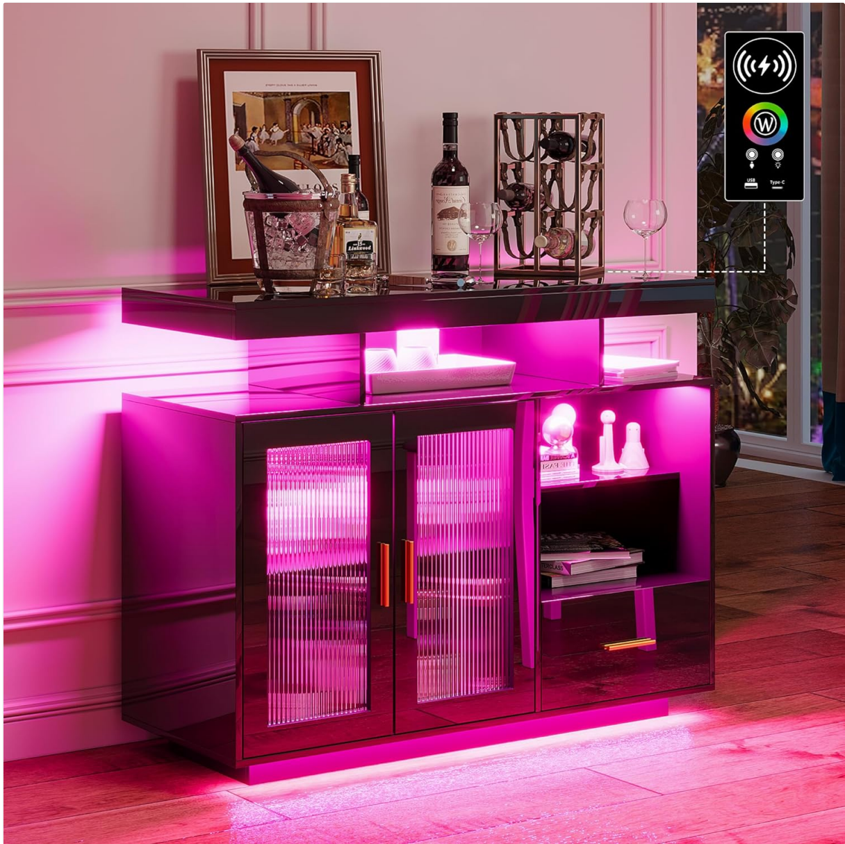
Image: A smartphone being charged wirelessly on the integrated charging pad of the sideboard.