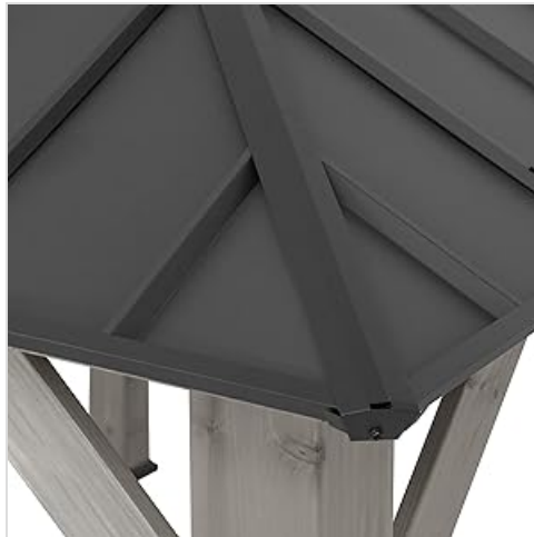
Figure 4.2: The durable black steel roof offers protection from the elements.

The 2-tier steel roof panels are installed after the main frame is erected. This step often requires lifting and careful alignment. Pay close attention to the orientation of each panel as shown in the instructions. Some users have reported issues with misaligned mounting tabs; verify correct orientation before fastening.