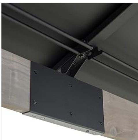
Figure 5.3: The dual rail system supports optional mosquito netting and privacy curtains.

The gazebo is equipped with a built-in dual rail system along the perimeter. This system allows for the easy installation of mosquito netting and privacy curtains (sold separately), providing additional comfort, privacy, and protection from insects.