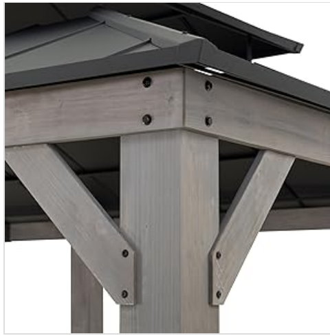
Figure 4.1: The premium cedar wood frame provides robust support for the gazebo structure.