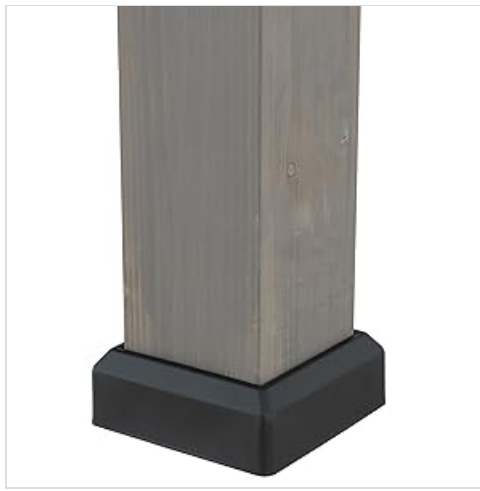
Figure 2.1: Anchoring plates with covers are used to secure the gazebo posts to the ground, enhancing stability.