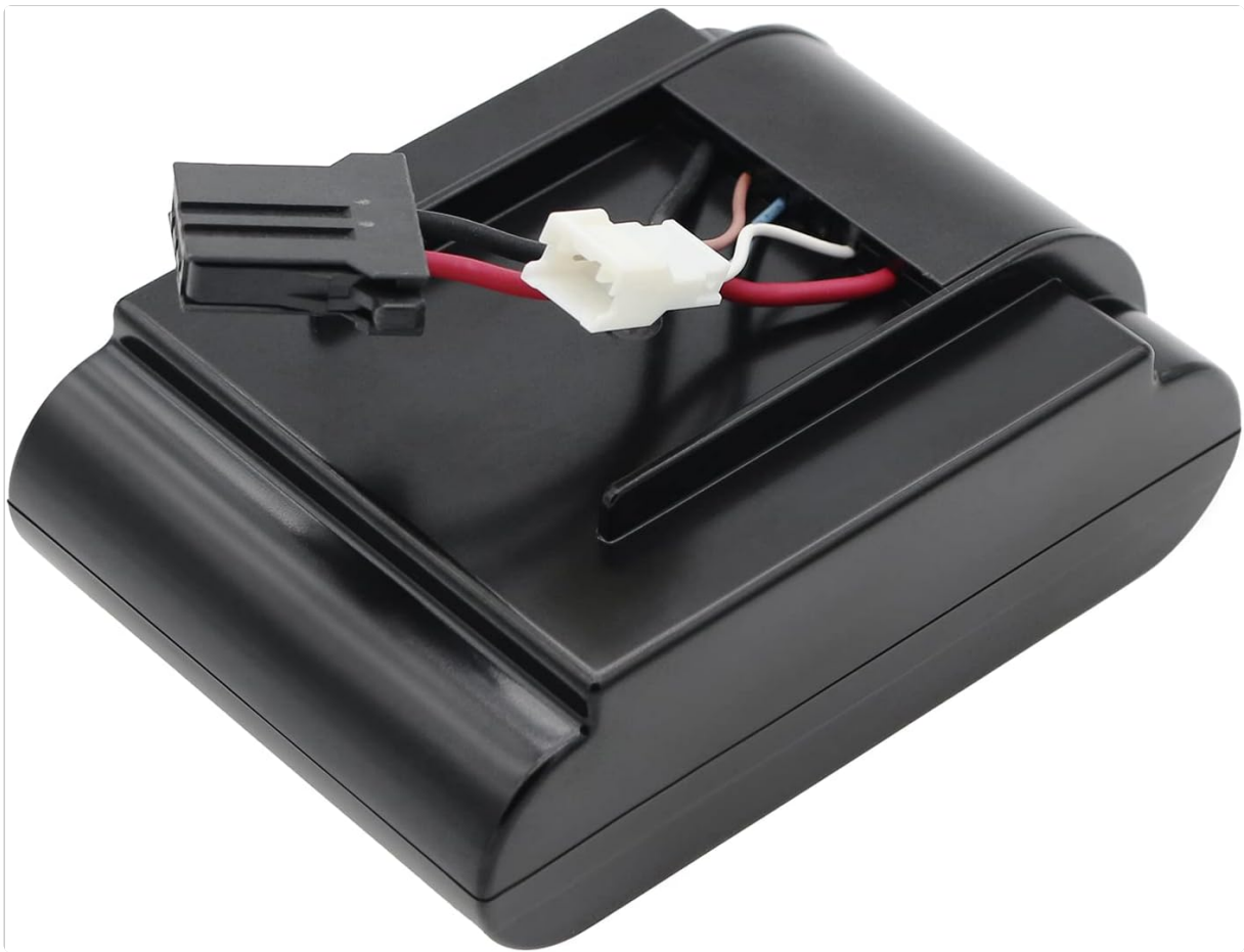
Image 3: The replacement battery showing its wiring and connectors. This view highlights the two main connectors, one black and one white, which are used to interface with the vacuum cleaner's power system.