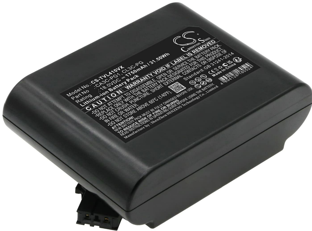
Image 1: The FITHOOD CS-TVL410VX replacement battery. This image shows the overall appearance of the battery pack, including its black casing and a portion of the label.