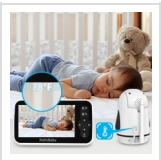
Figure 8: Temperature Monitoring Icon.

The parent unit displays the real-time temperature of the baby's room, helping you ensure a comfortable environment for your child.