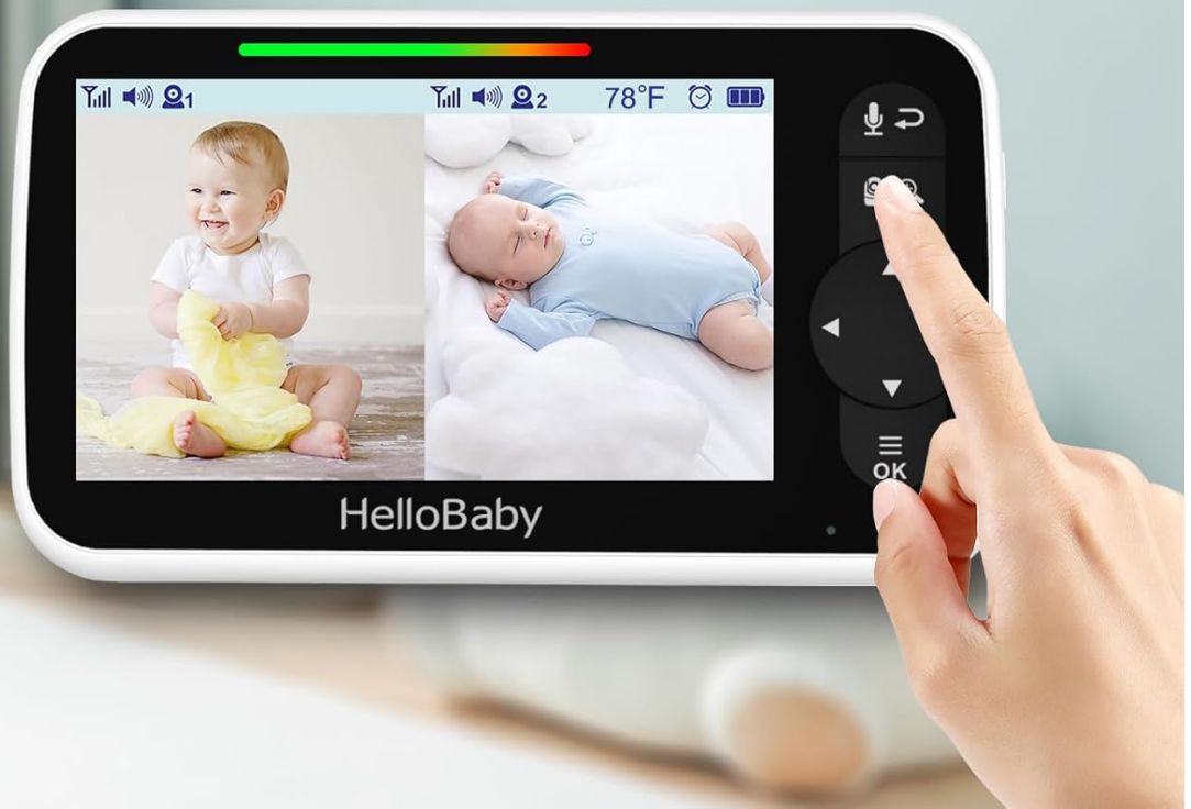
Figure 4: Split Screen Feature in action.