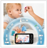
Figure 10: ECO Mode Icon.

The ECO mode helps conserve battery life. When activated, the parent unit screen will turn off, and the unit will only activate (screen turns on and sound is heard) when sound is detected from the baby's room, such as crying.