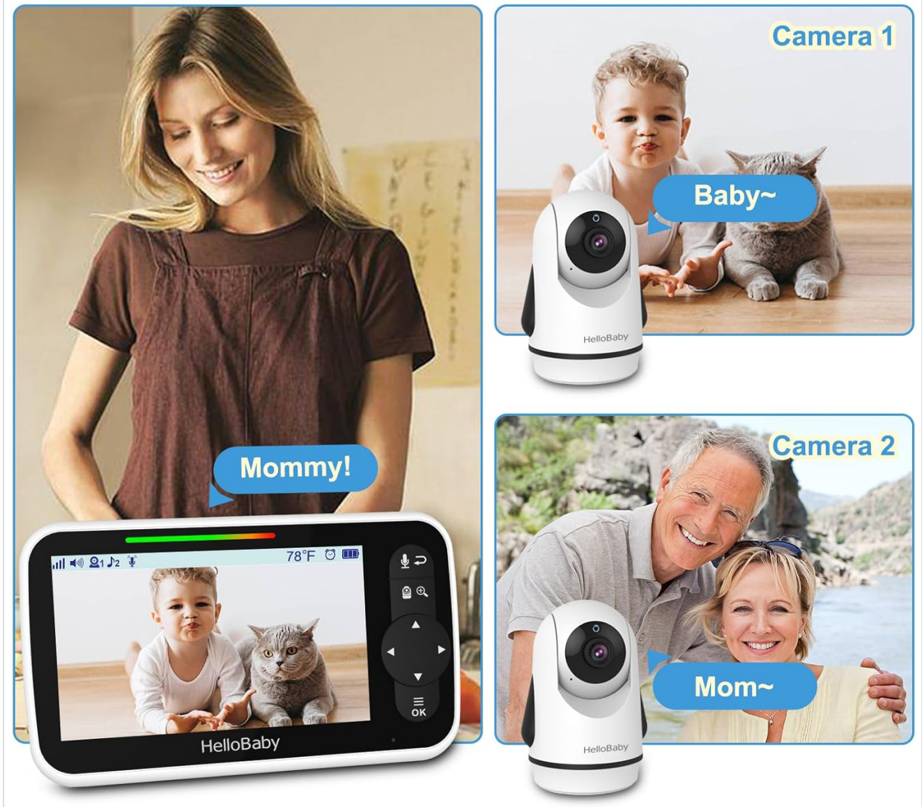
Figure 5: Clear Two-way Audio communication.

Talk to Your Loved Ones Whenever You Want