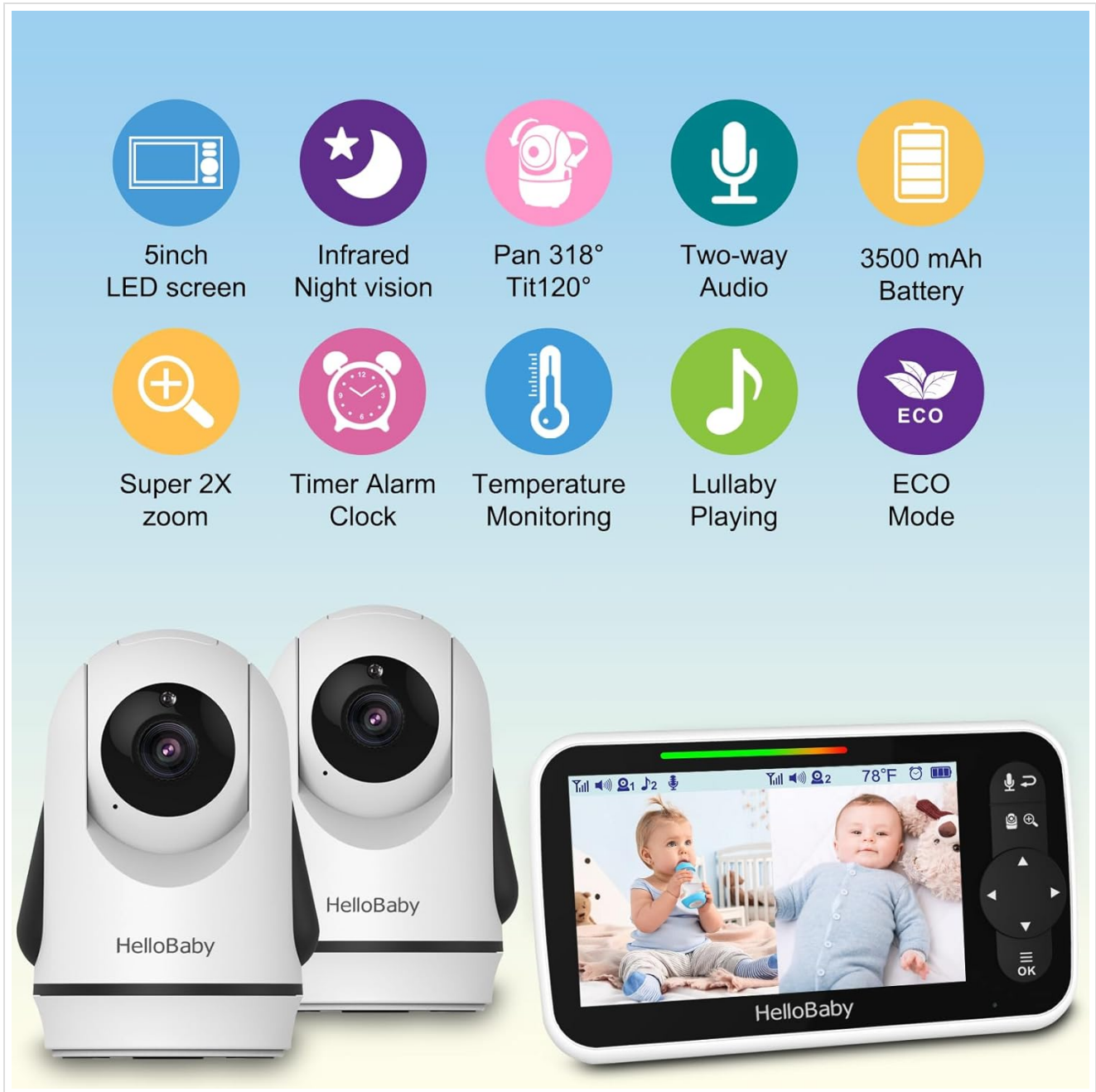
Figure 3: Parent Unit Main Menu and Features.

The parent unit features a user-friendly interface with dedicated buttons for various functions. Familiarize yourself with the layout for easy operation.