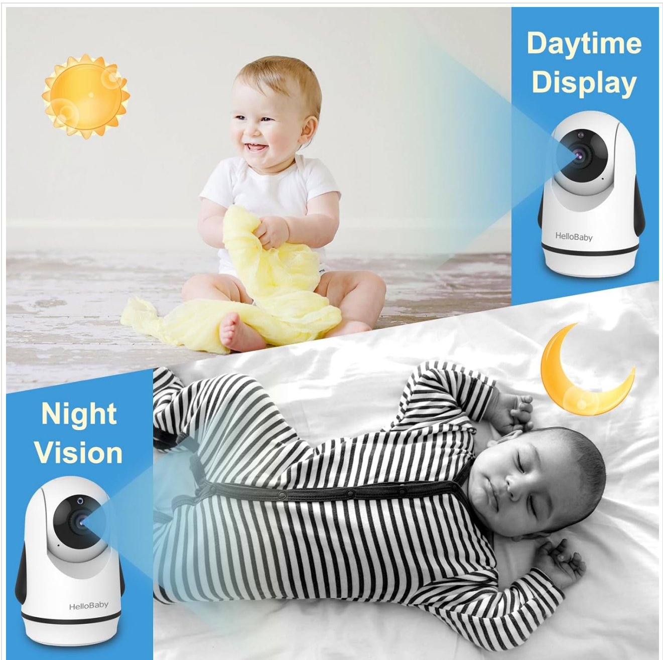
Figure 6: Automatic Day and Night Vision.