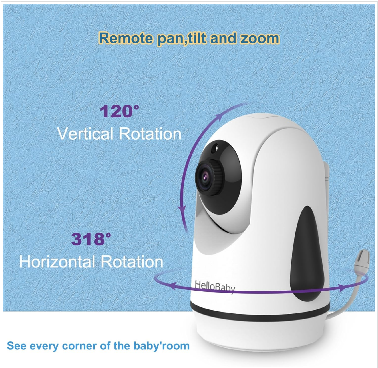
Figure 7: Remote Pan, Tilt, and Zoom functionality.