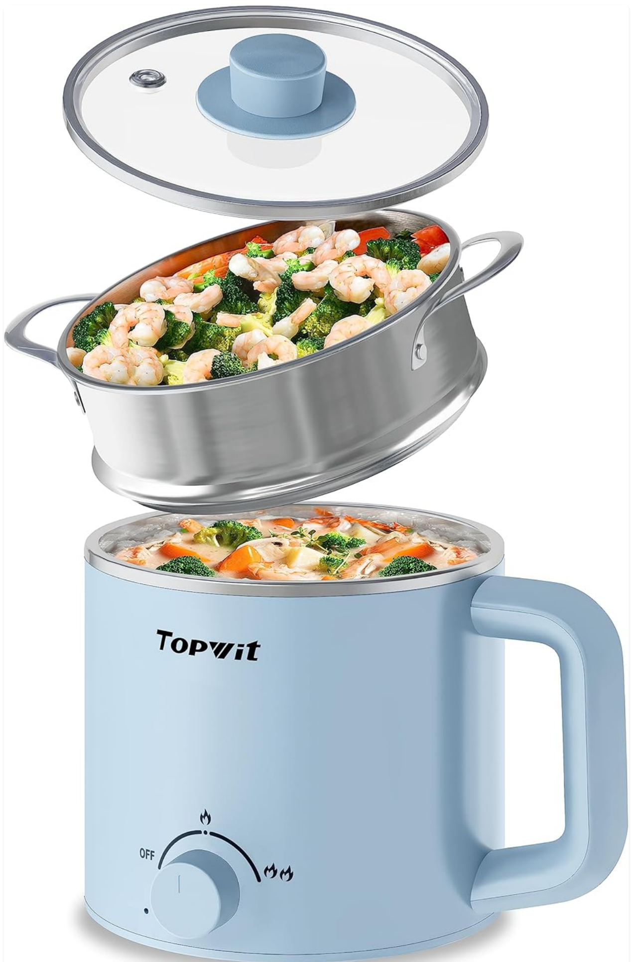
The main body of the electric hot pot, featuring a comfortable handle for easy portability.