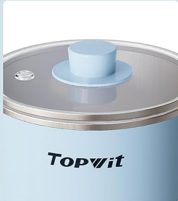
Visual Glass Cover