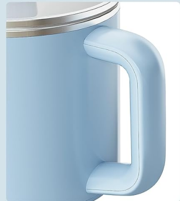
Cool Touch Handle