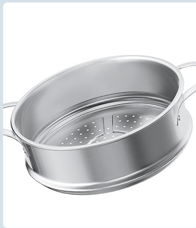
Stainless Steel Steamer