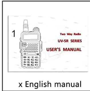
1 x English manual