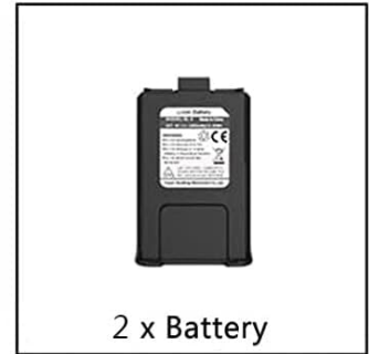
2 x Battery