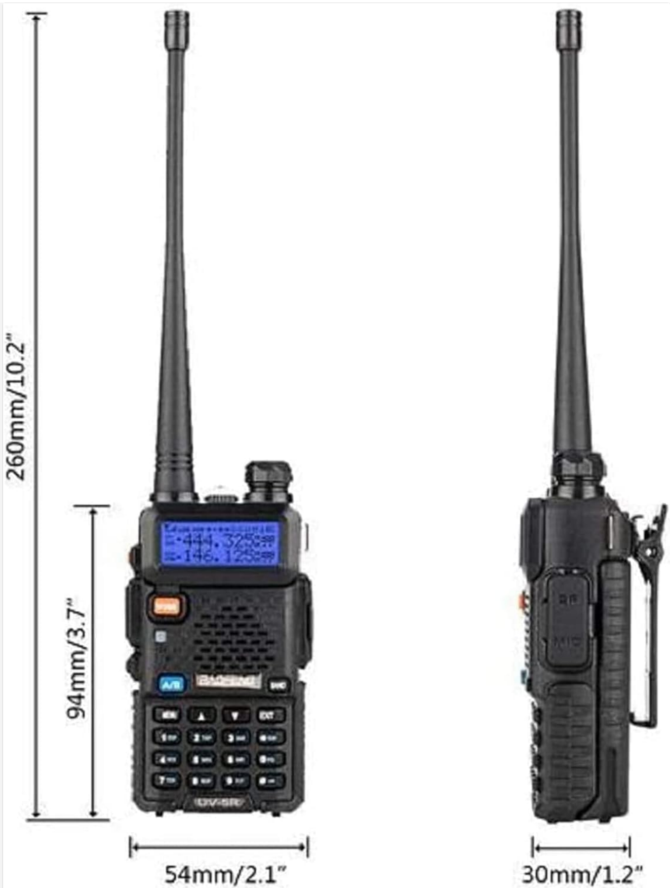
Image: Dimensional diagram of the BAOFENG UV-5R radio. The image illustrates the radio's width (54mm/2.1"), body height (94mm/3.7"), total height with antenna (260mm/10.2"), and depth (30mm/1.2").