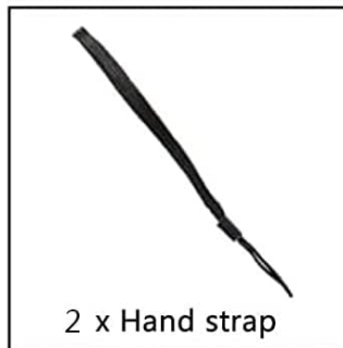
2 x Hand strap