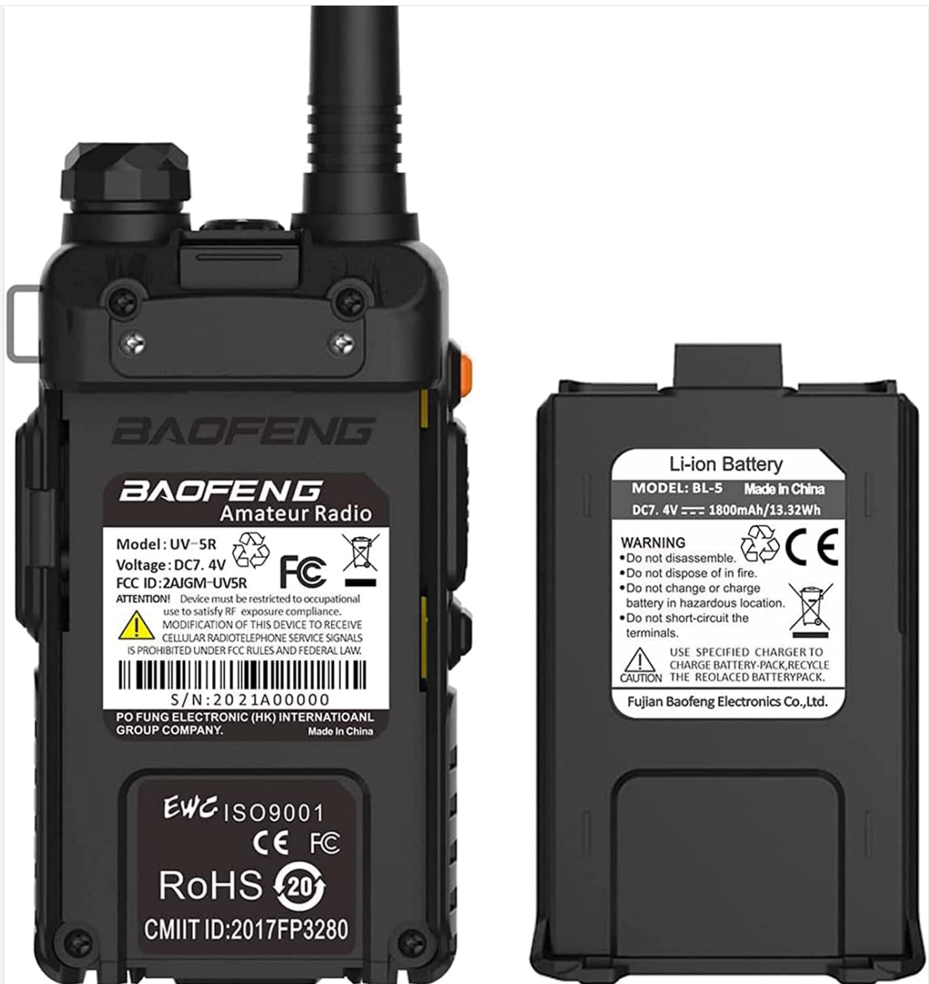
Image: Rear view of the BAOFENG UV-5R radio and its detachable Li-Ion battery. The radio's label displays the model number UV-5R and FCC ID: 2AJGM-UV5R. The battery label indicates model BL-5, 1800mAh capacity, and safety warnings.