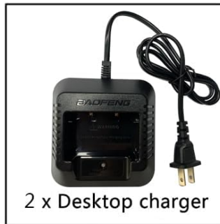
2 x Desktop charger