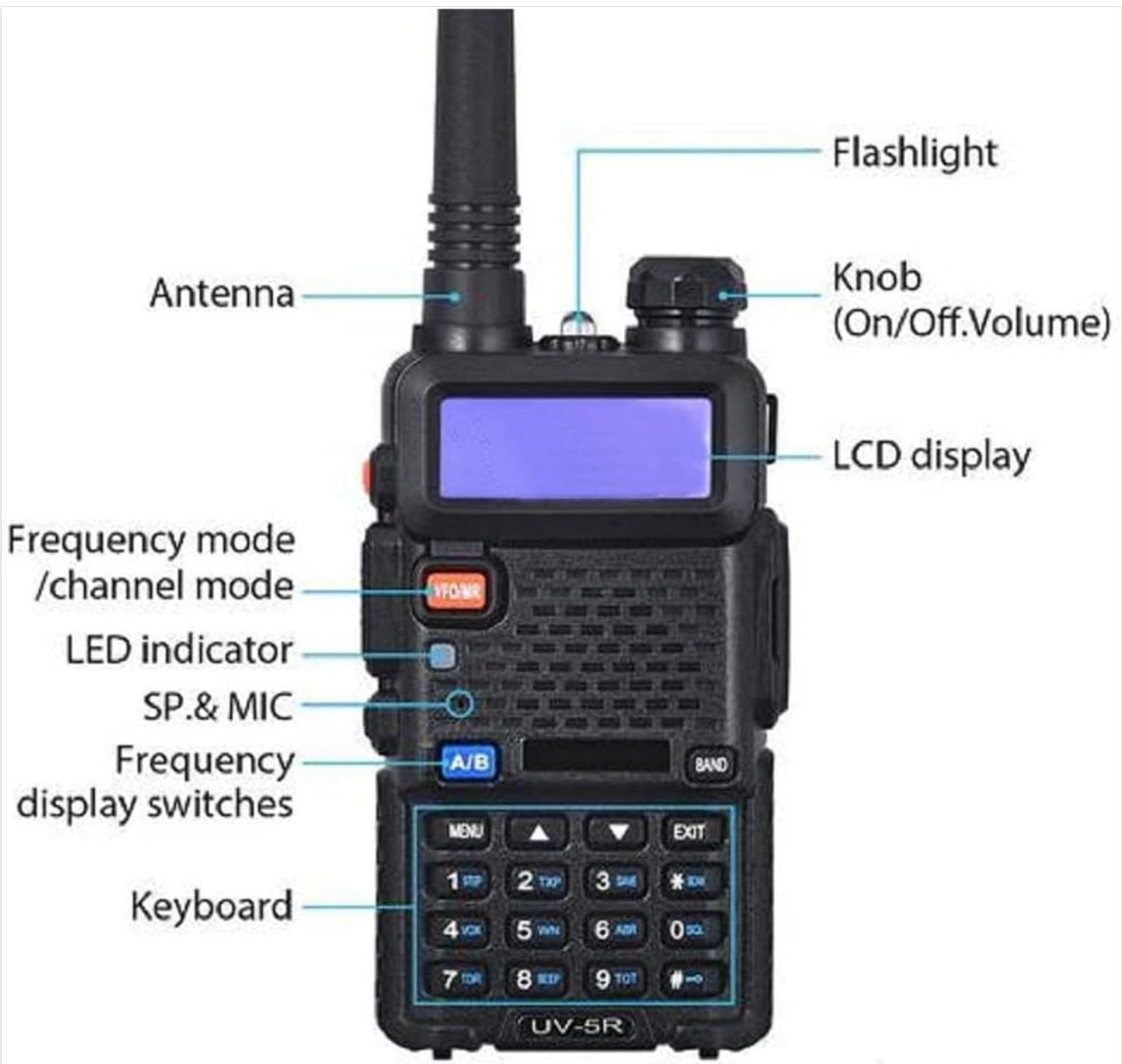
Image: Labeled diagram of the BAOFENG UV-5R radio. Key components such as the antenna, flashlight, power/volume knob, LCD display, VFO/MR button, LED indicator, speaker/microphone port, A/B frequency display switch, and keypad are clearly marked.