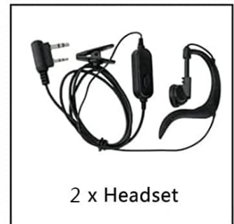
2 x Headset