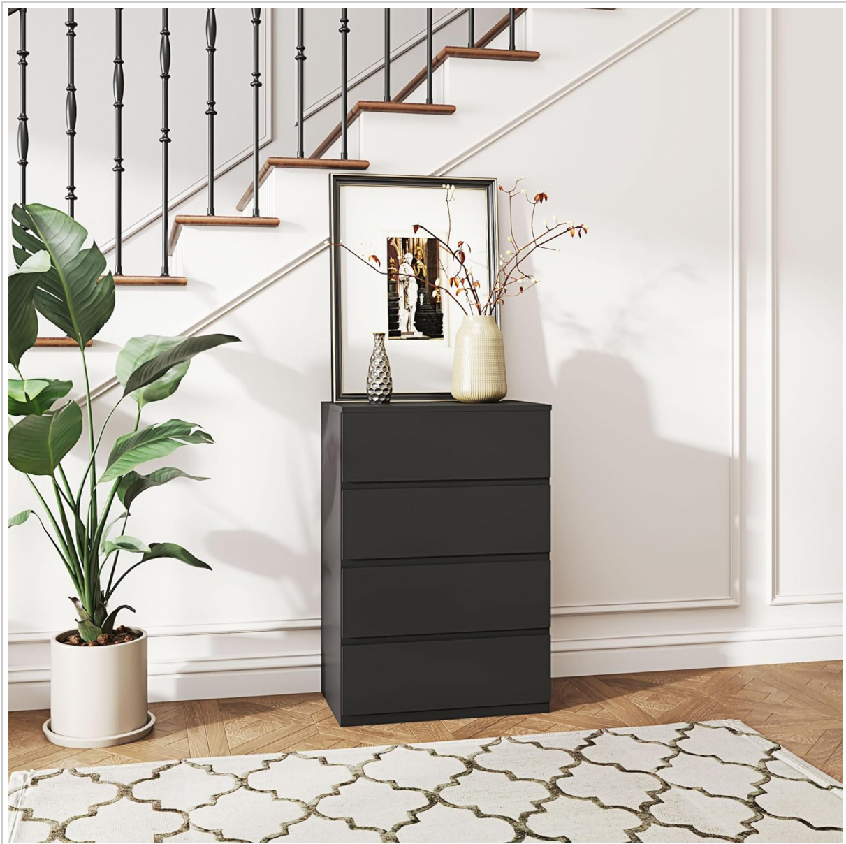
Image: The assembled HOMCOM 4-Drawer Dresser in a home setting, showcasing its modern design and functionality.