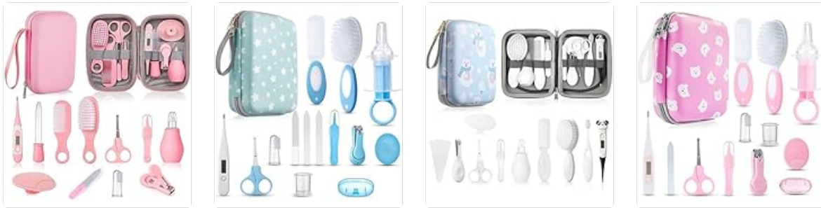
Image 3.3: Examples of various grooming tools in use: baby nail scissors, baby comb, finger toothbrush, and nasal aspirator.