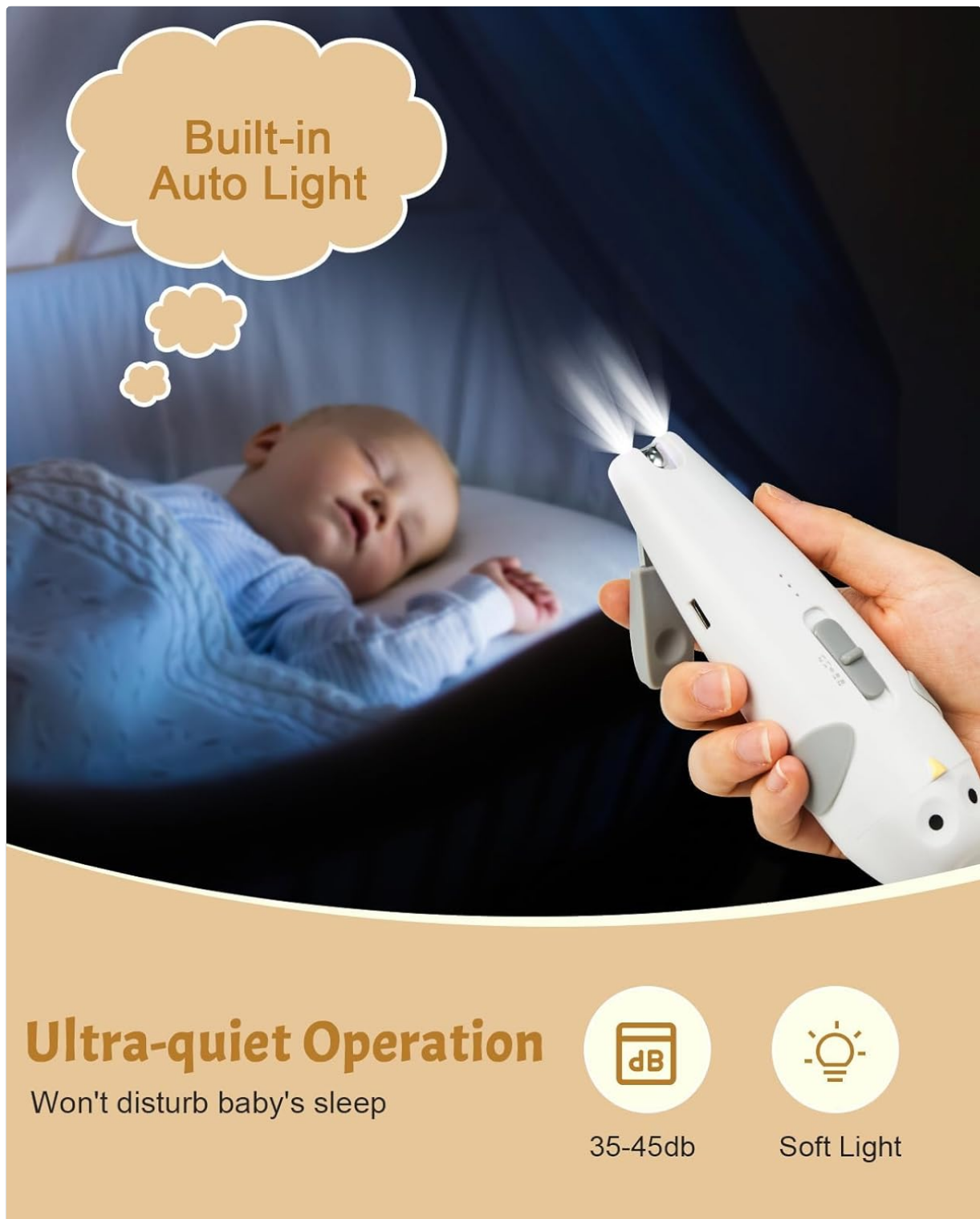
Image 3.2: The electric nail trimmer with its built-in auto light, demonstrating its quiet operation near a sleeping baby.