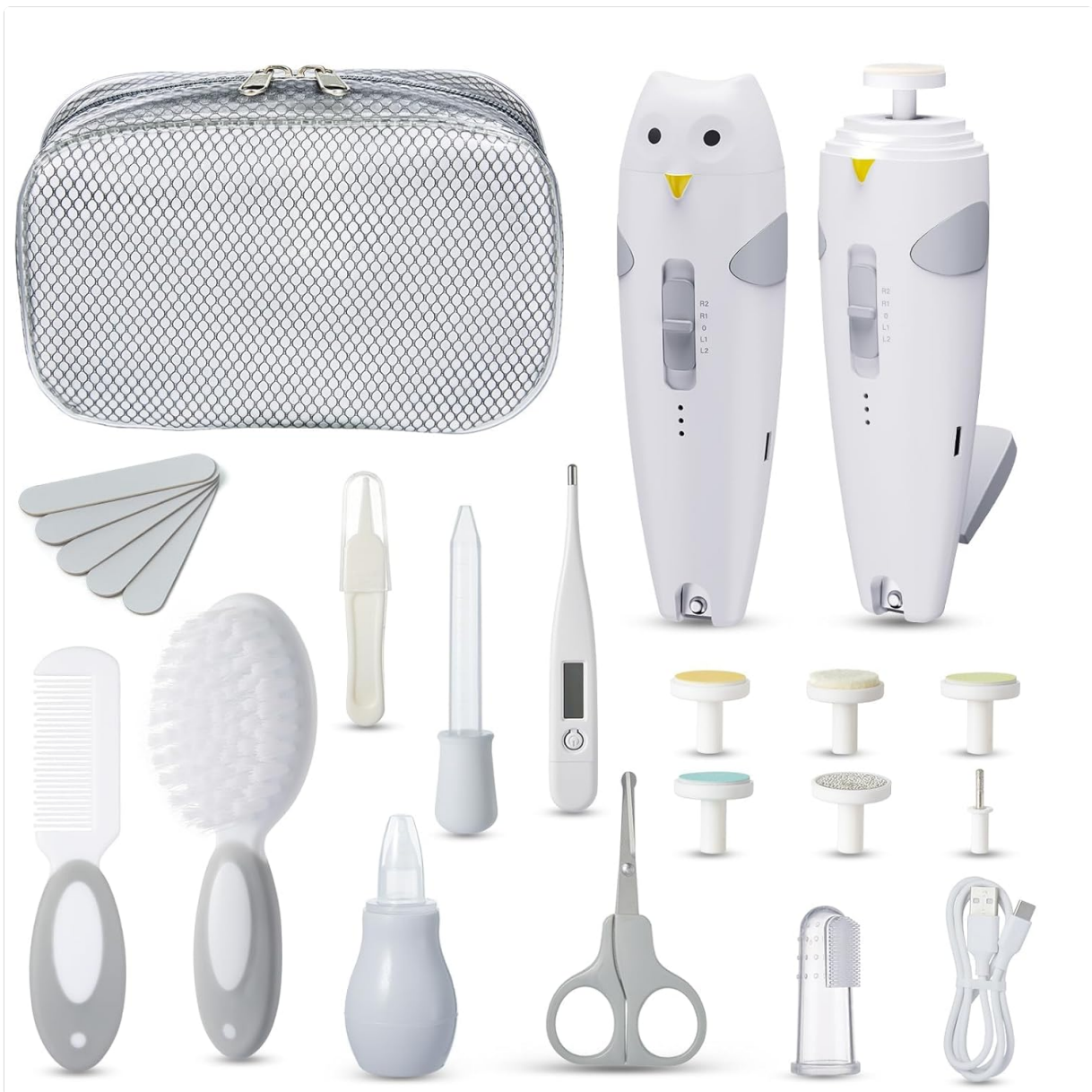
Image 1.1: Complete contents of the Lictin 26-in-1 Baby Healthcare and Grooming Kit, including the electric nail trimmer, various grinding heads, nail clippers, scissors, brush, comb, nasal aspirator, finger toothbrush, drug feeder, tweezers, nail files, and a storage bag.