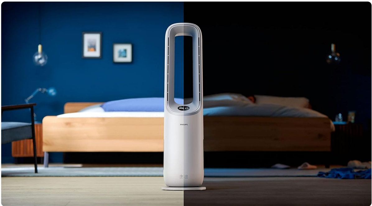
Image: The Philips Air Performer operating in a dimly lit bedroom, highlighting its quiet sleep mode feature.