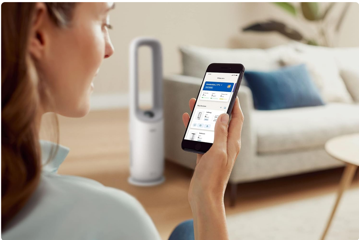
Image: A user interacting with the Philips Air+ mobile application, demonstrating remote control capabilities for the Air Performer.