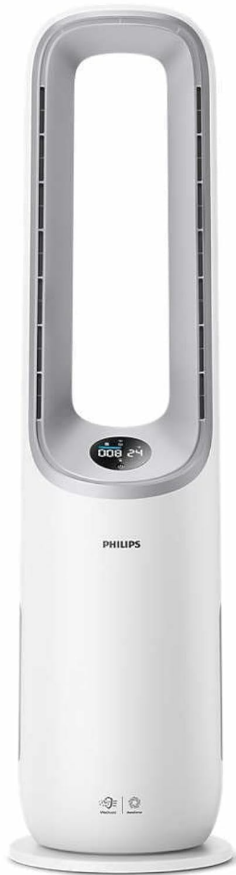
Image: The Philips Air Performer 7000 Series device, showcasing its sleek design and integrated display.

The Philips Air Performer combines advanced air purification with a powerful fan for cooling. It features a multi-layer filtration system and smart sensing technology.