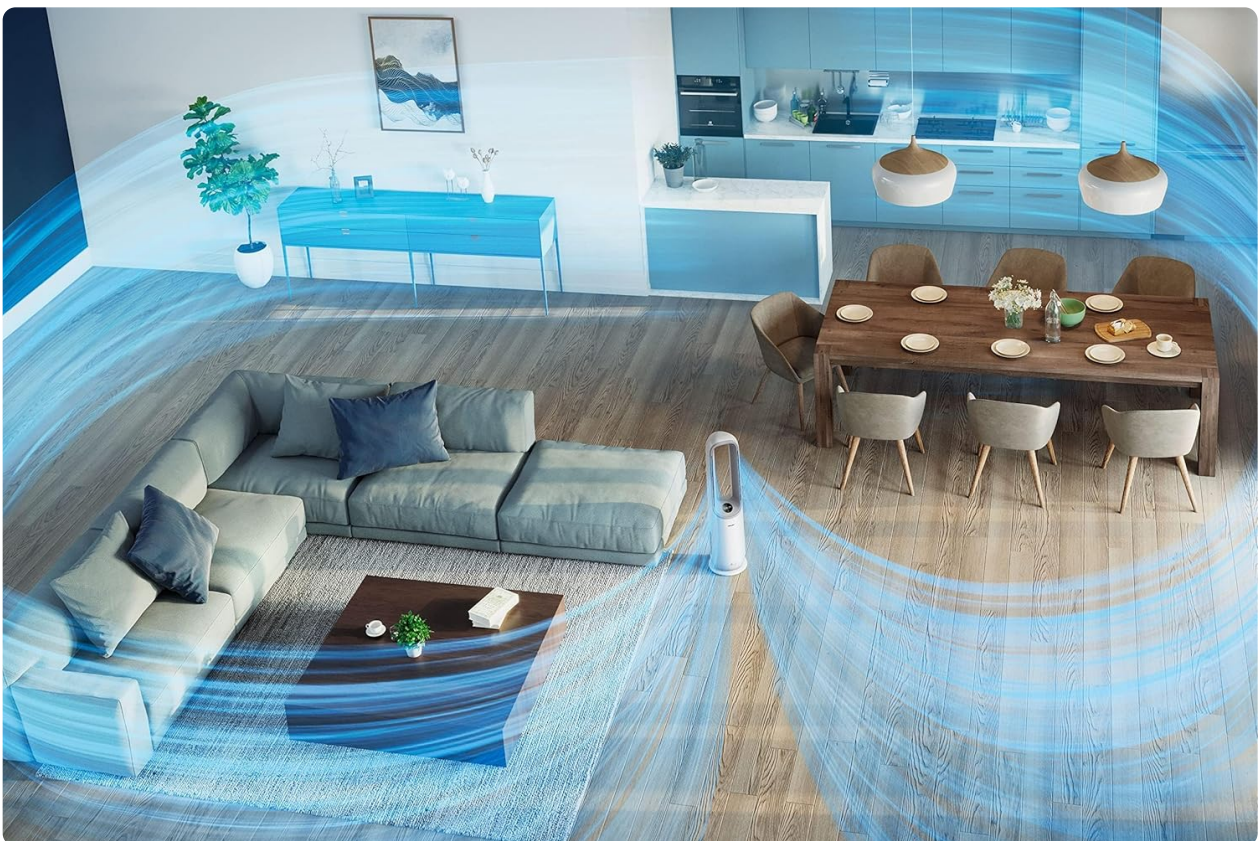
Image: An aerial view of a living space showing the Philips Air Performer effectively circulating purified air across the entire room.