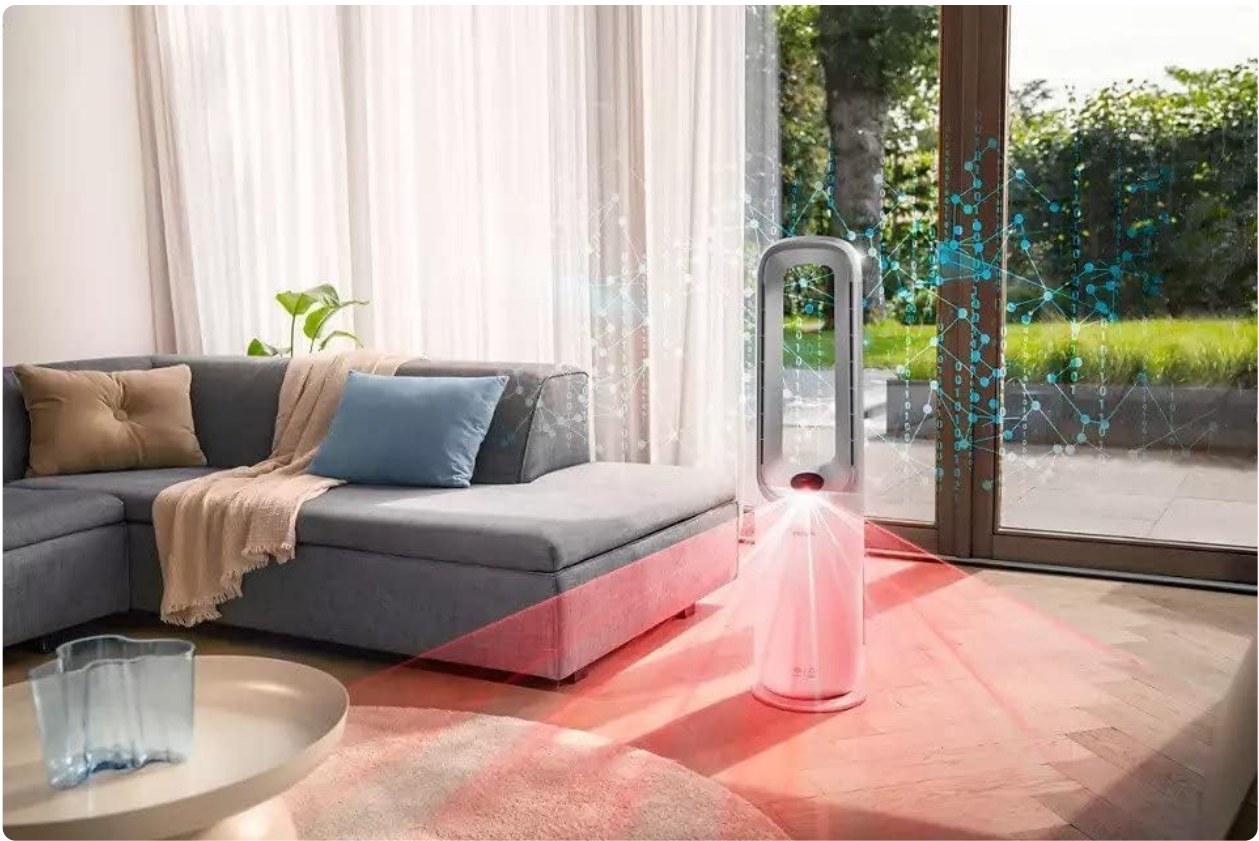
Image: The Philips Air Performer using a red laser to detect airborne particles, illustrating its smart sensing capabilities.