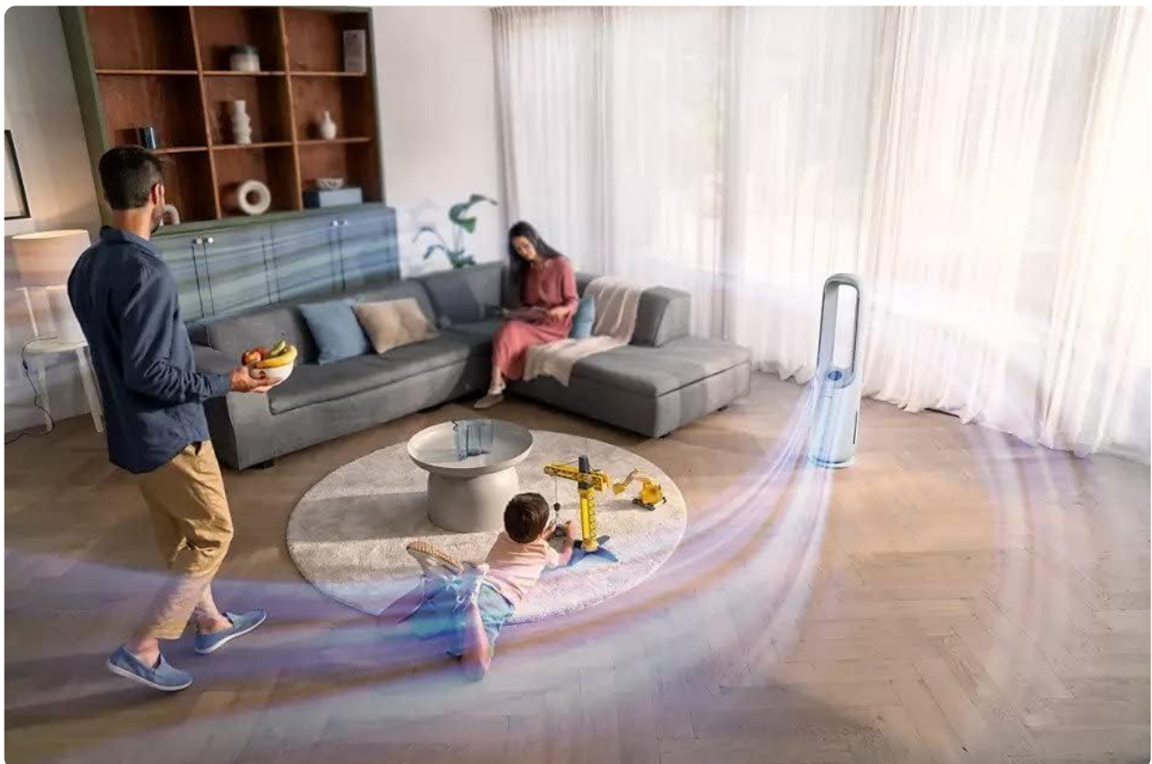
Image: The Philips Air Performer emitting a powerful stream of purified and cooled air, demonstrating its fan function.

The device may feature oscillation or adjustable airflow direction. Use the control panel or app to set the desired airflow for cooling.