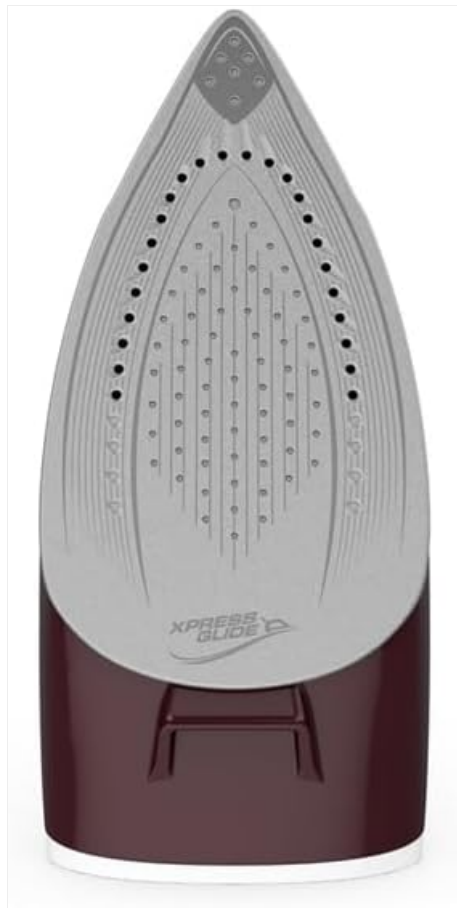
Figure 3: The ceramic soleplate of the Calor SV6120C0 Express Essential Steam Generator Iron, featuring multiple steam vents for even steam distribution and "Xpress Glide" technology for smooth gliding.