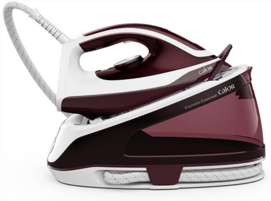
Figure 1: The Calor SV6120C0 Express Essential Steam Generator Iron, showing the iron resting on its base unit. The water tank is visible on the right side of the base, and the steam hose connects the iron to the base.

Familiarize yourself with the different parts of your Calor SV6120C0 Express Essential steam generator iron.