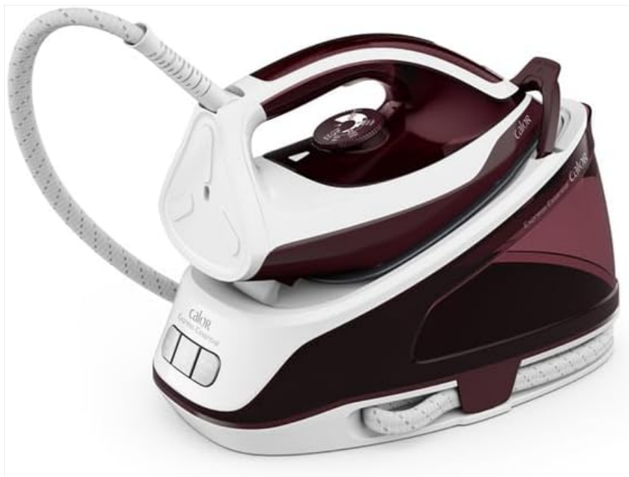
Figure 2: A side view of the Calor SV6120C0 Express Essential Steam Generator Iron, highlighting the ergonomic handle and the steam button located beneath the handle.