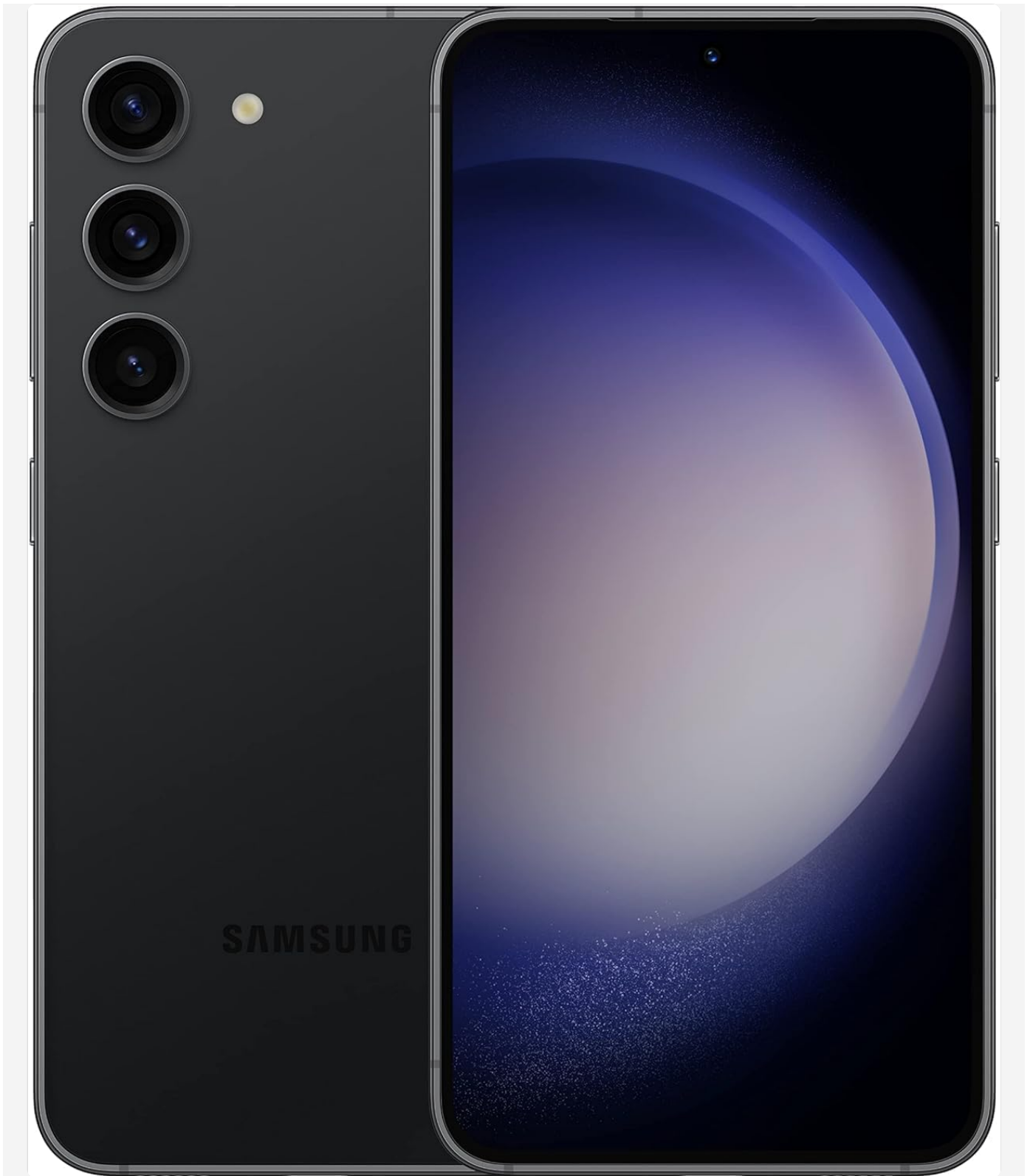
Figure 1: Front and Back View of the SAMSUNG Galaxy S23 5G. Shows the vibrant display on the front and the triple camera setup on the rear, along with the Samsung branding.