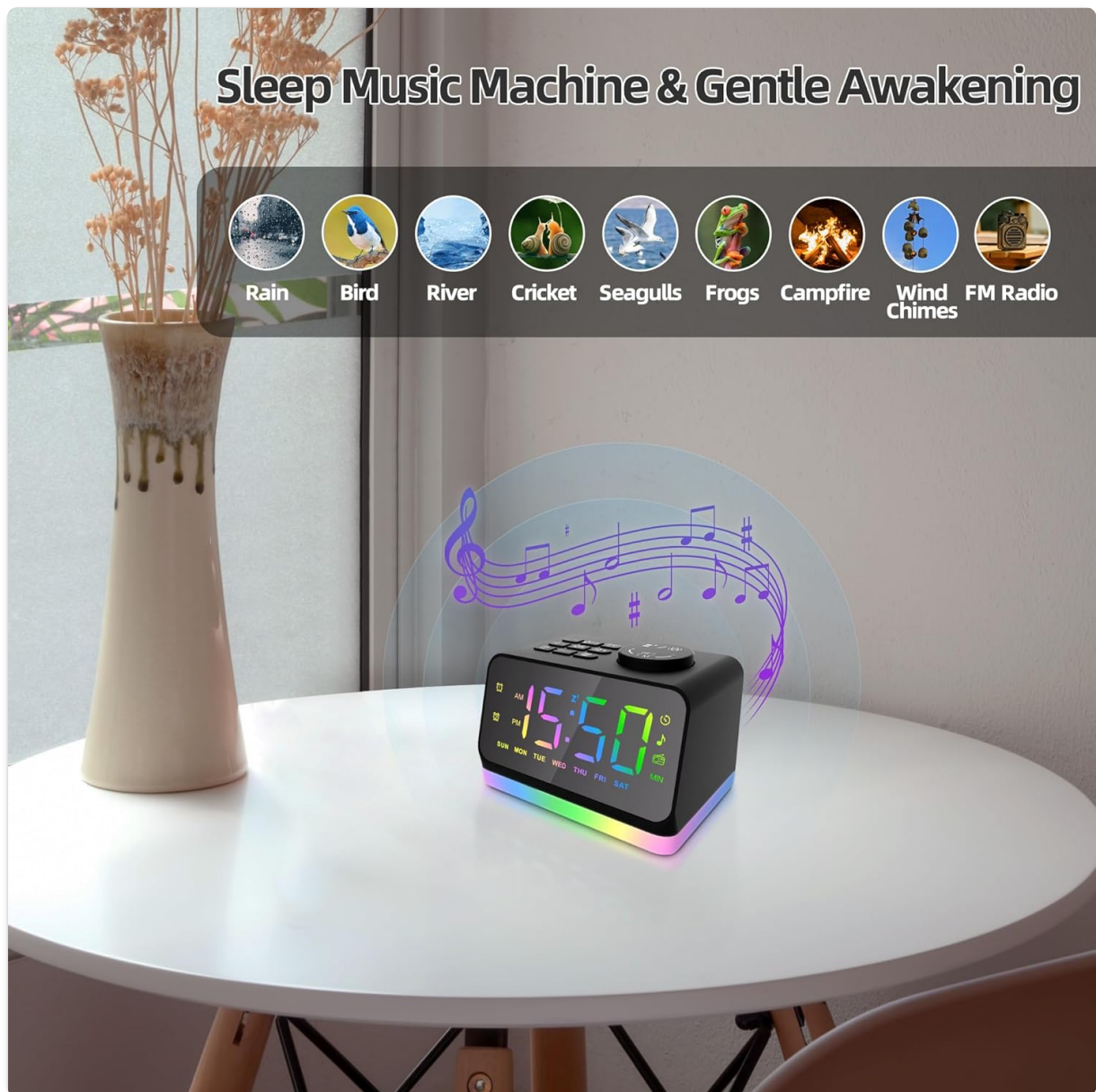
Figure 3: The sleep music machine feature, offering a variety of natural and soothing sounds for gentle awakening or relaxation.