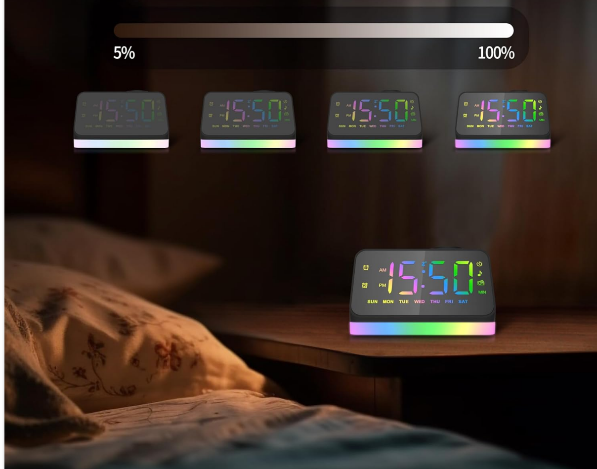
Figure 7: Demonstration of the 0-100% LED adjustable light feature, allowing users to set the display brightness to their preference.