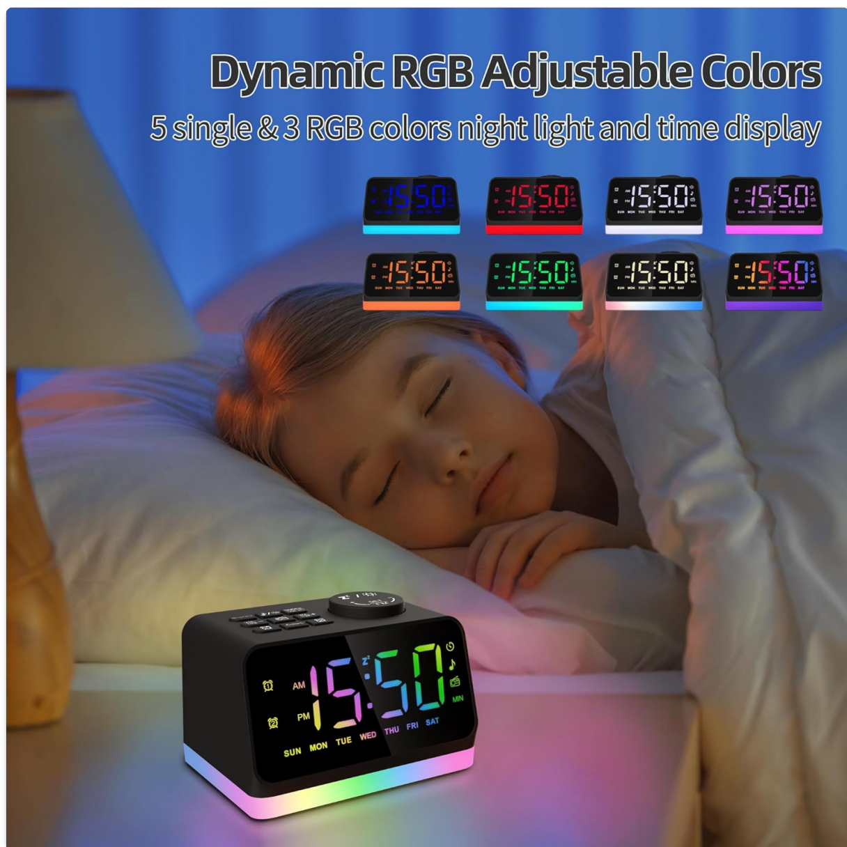
Figure 6: Examples of dynamic RGB adjustable colors for the night light and time display, offering various aesthetic options.