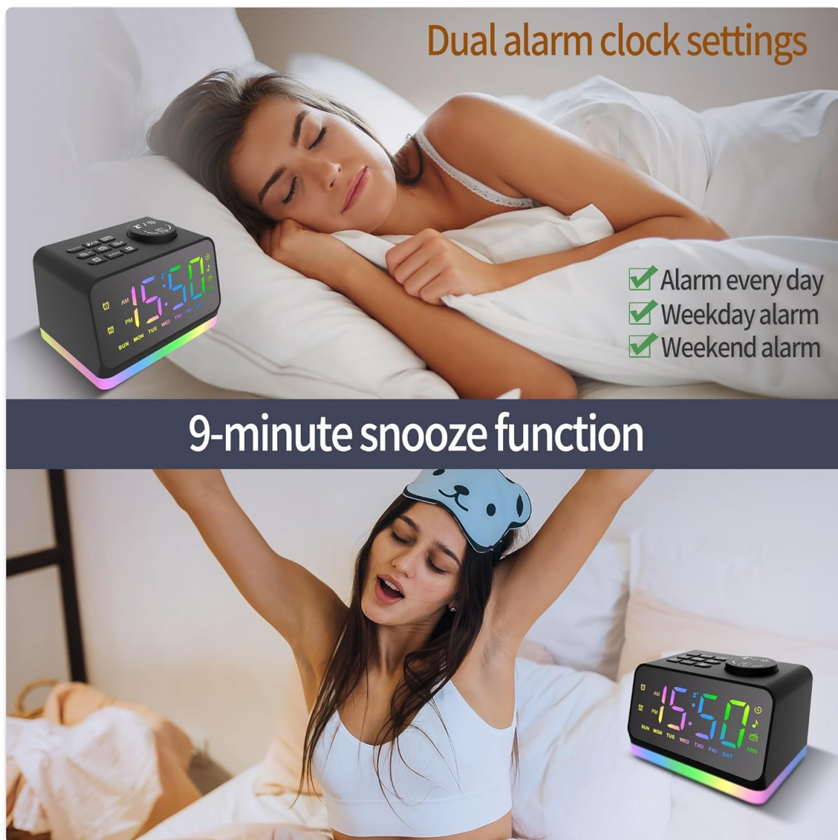
Figure 5: Illustration of the dual alarm clock settings and the 9-minute snooze function.