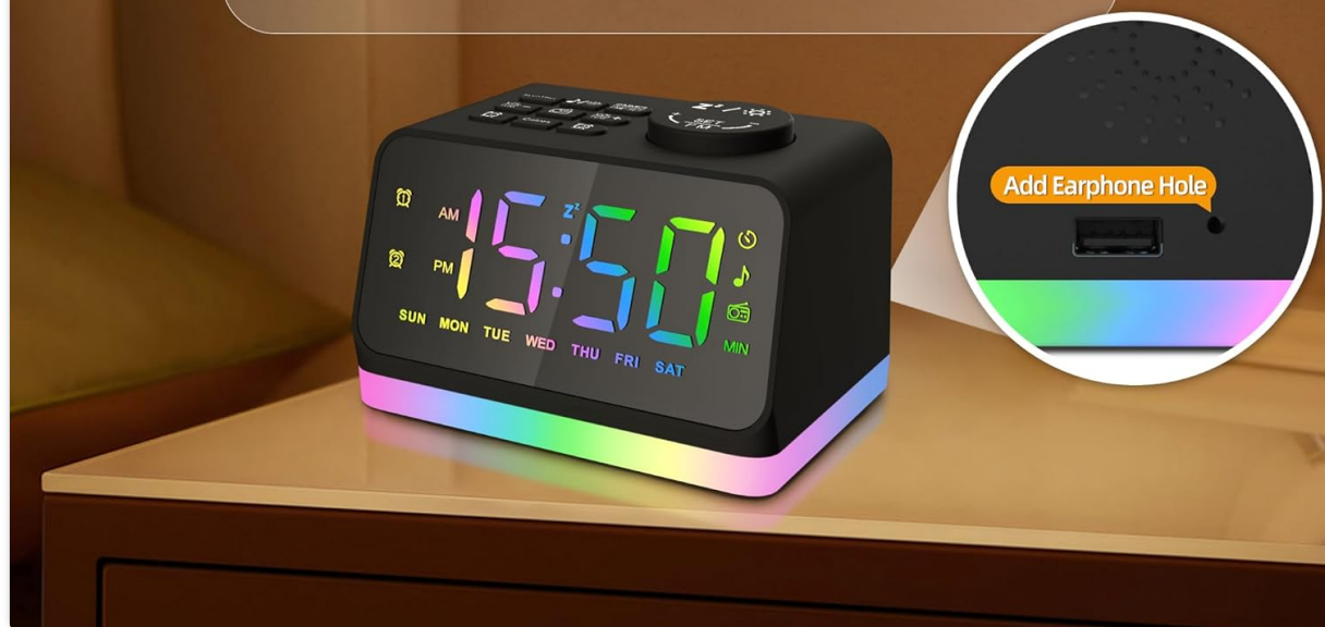
Figure 2: Overview of the 8-in-1 multifunctional features, including dual alarm, FM radio, sleep timer, USB charging, and more.