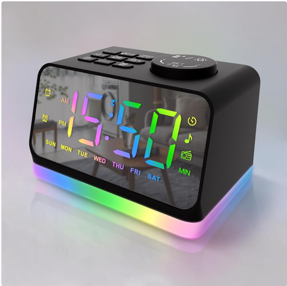
Figure 1: LEIKE Alarm Clock Radio, showcasing its digital display and vibrant RGB light base.