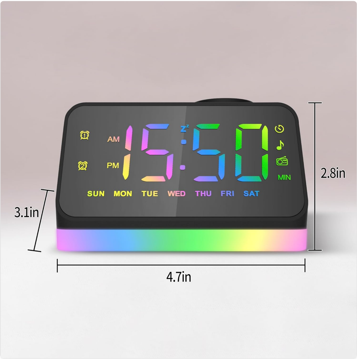
Figure 8: Product dimensions for the LEIKE Alarm Clock Radio.