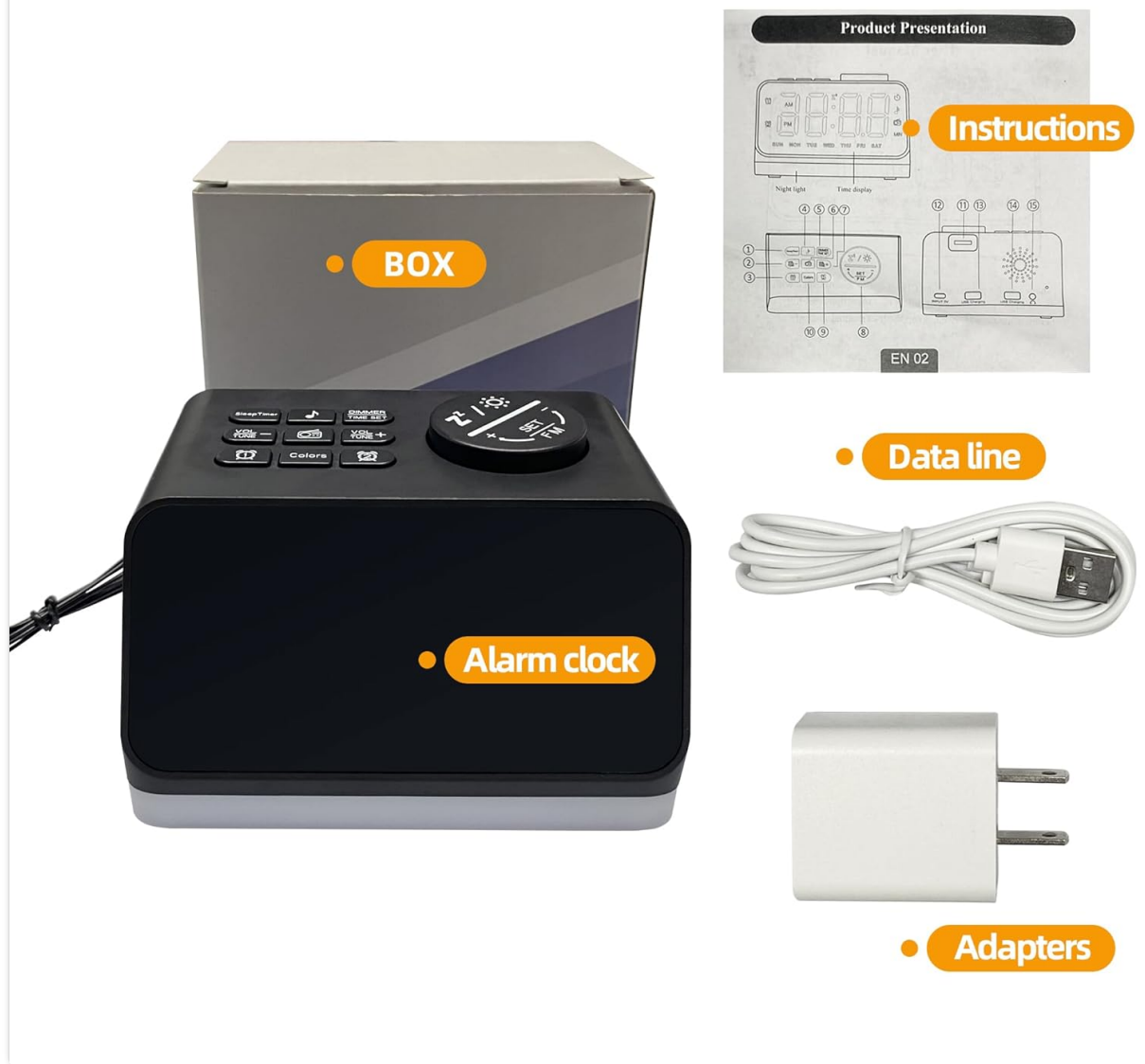
Figure 4: Contents of the product package, showing the alarm clock, data line, and power adapters.