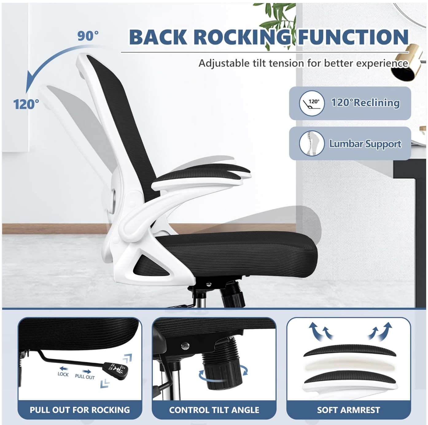
Figure 5.2: Back Rocking Function and Tilt Control