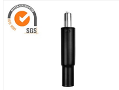
Figure 8.1: SGS Certified Gas Lift