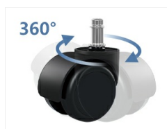
Figure 5.4: 360° Swivel Caster

The chair features a 360° swivel function for easy rotation. The durable casters allow for smooth and quiet movement across various floor surfaces without causing damage.