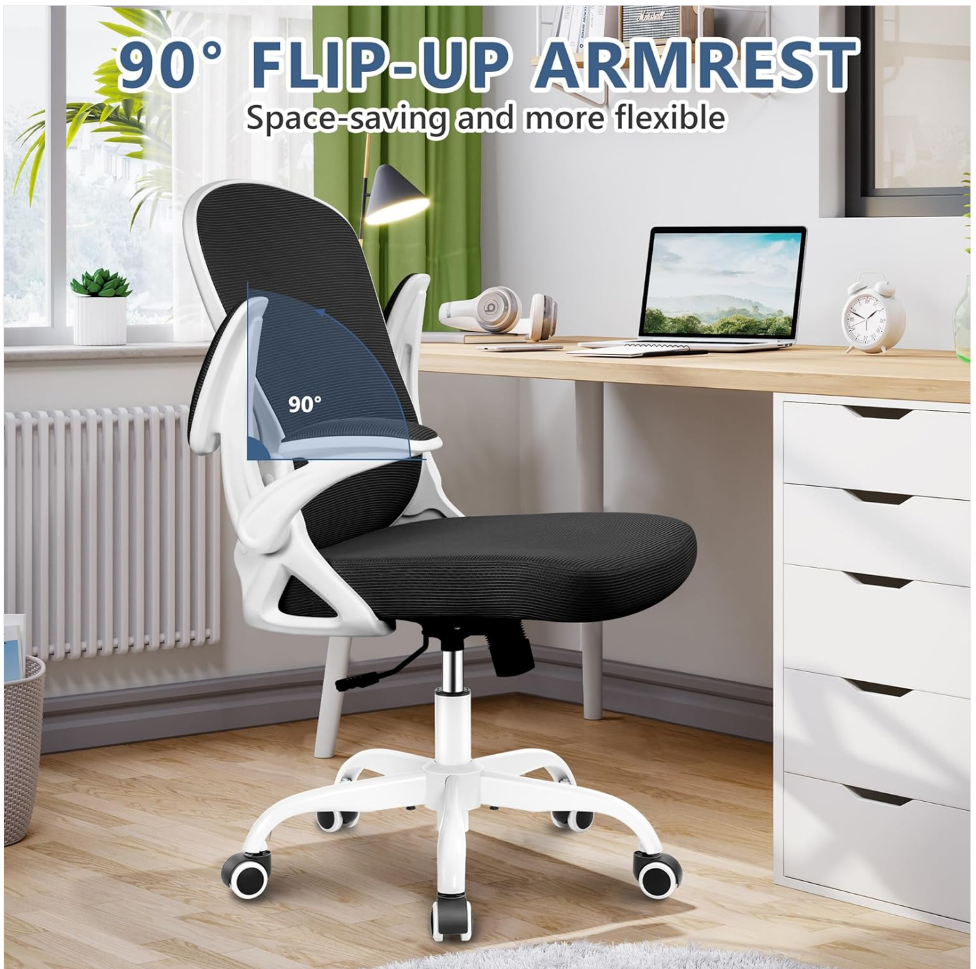
Figure 5.3: 90° Flip-Up Armrests