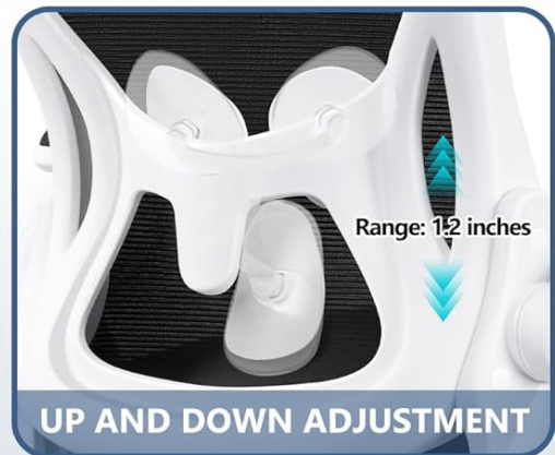
Figure 5.1: Ergonomic Design and Lumbar Support