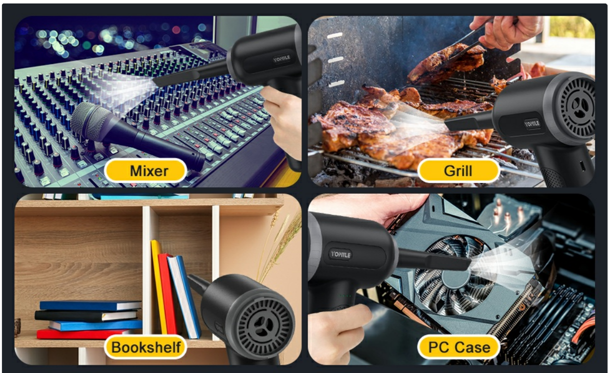
Figure 7: Diverse applications of the Yomile 2-in-1 device.