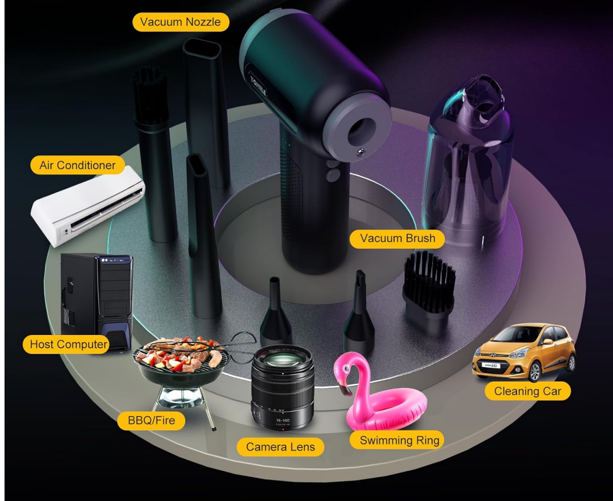
Figure 4: Overview of the 7 interchangeable nozzles.