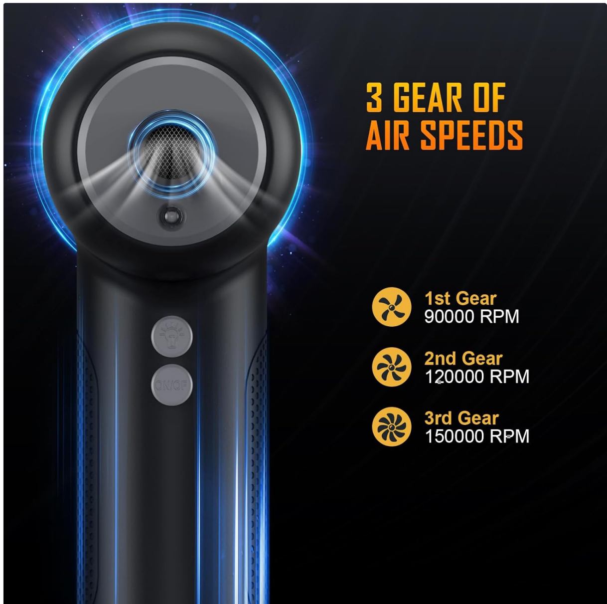
Figure 5: Air speed settings.