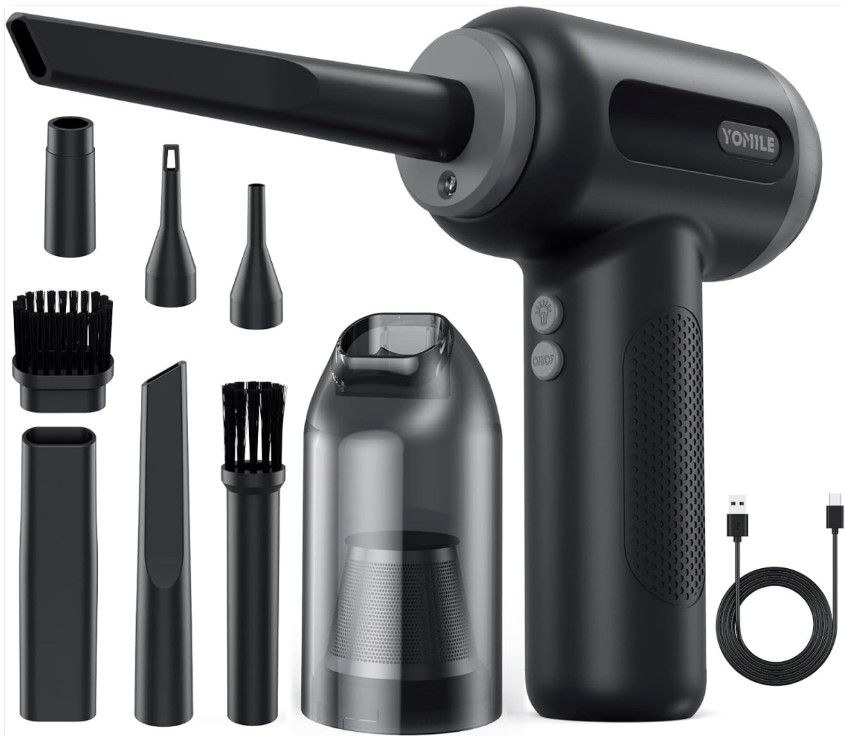
Figure 1: Yomile 2-in-1 Cordless Air Duster and Mini Car Vacuum with included accessories.

This device features a powerful motor capable of reaching up to 150,000 RPM for blowing and providing up to 15,000 PA of suction. It is powered by a built-in 9000mAh battery, offering extended operating time and quick recharging via USB-C.