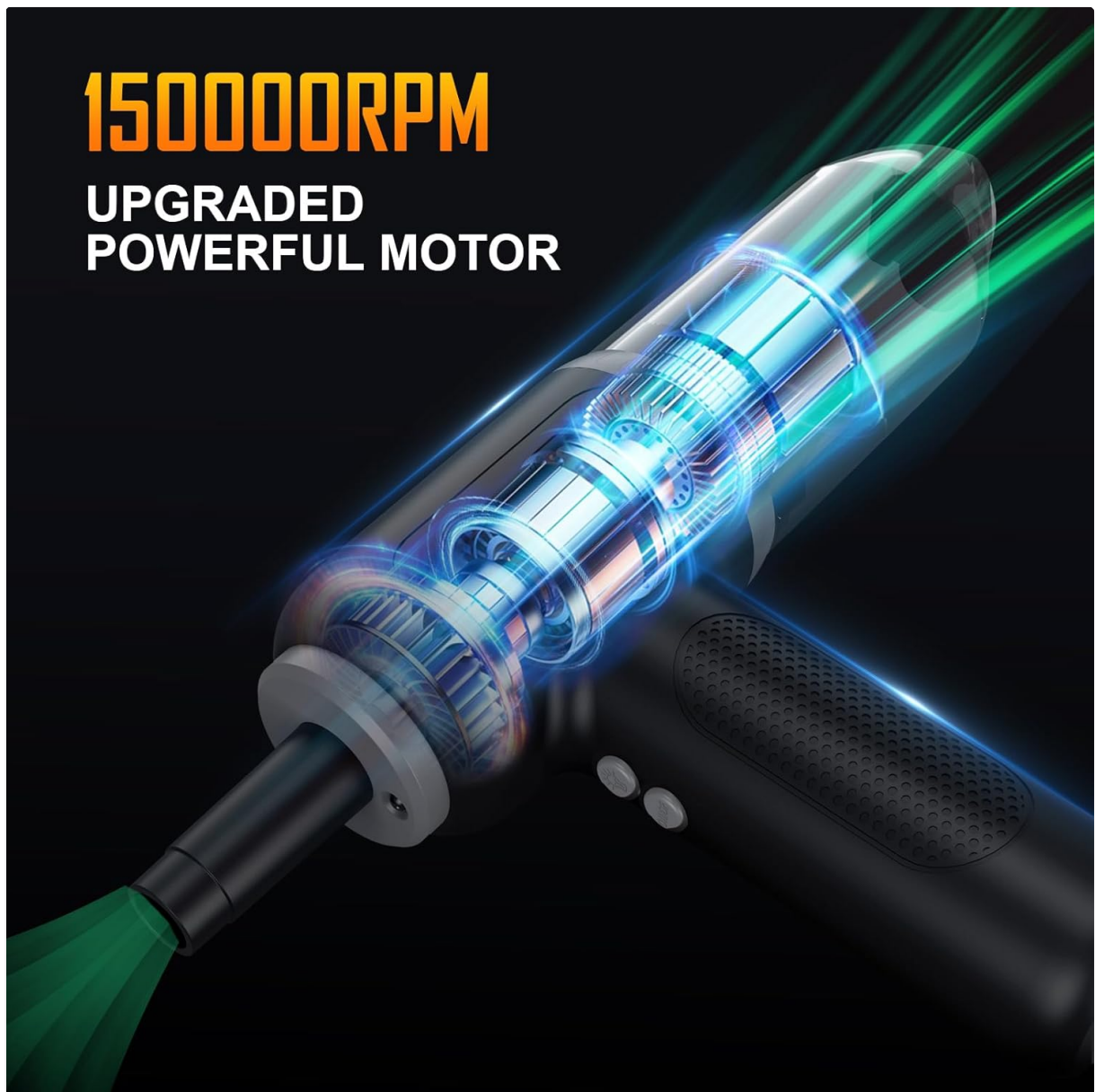
Figure 2: Illustration of the powerful 150,000 RPM motor.