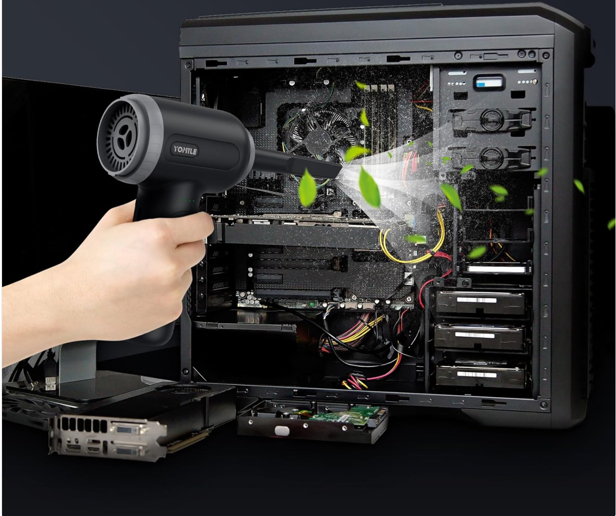
Figure 6: Example of using the air duster for deep cleaning a computer.