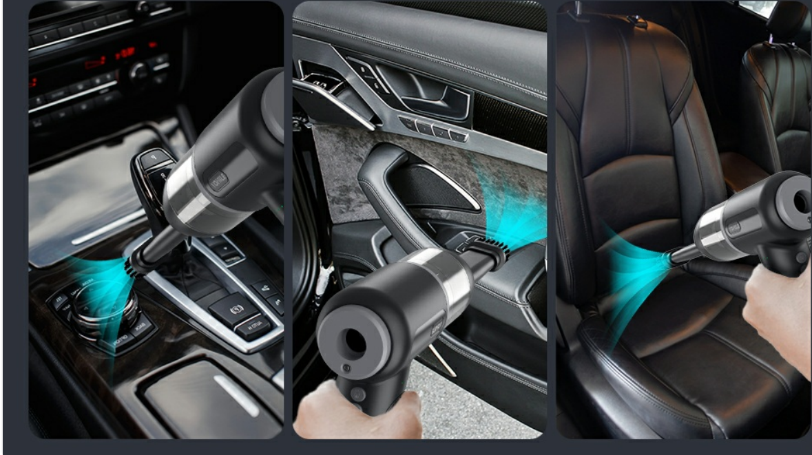
Figure 8: Using the 15Kpa mini vacuum cleaner for car interiors.